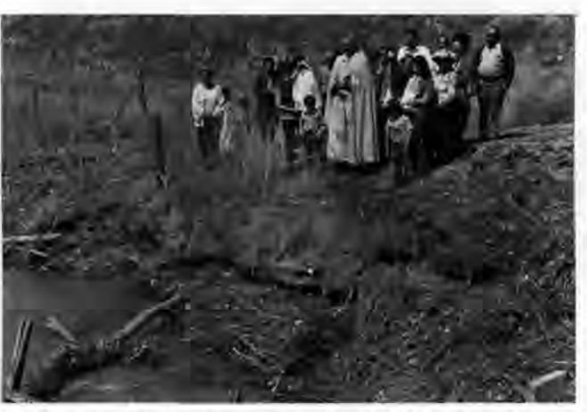
Blessing of the waters in the accquia, or irrigation ditch, that serves the communities of La Joya and Contreras, NM.