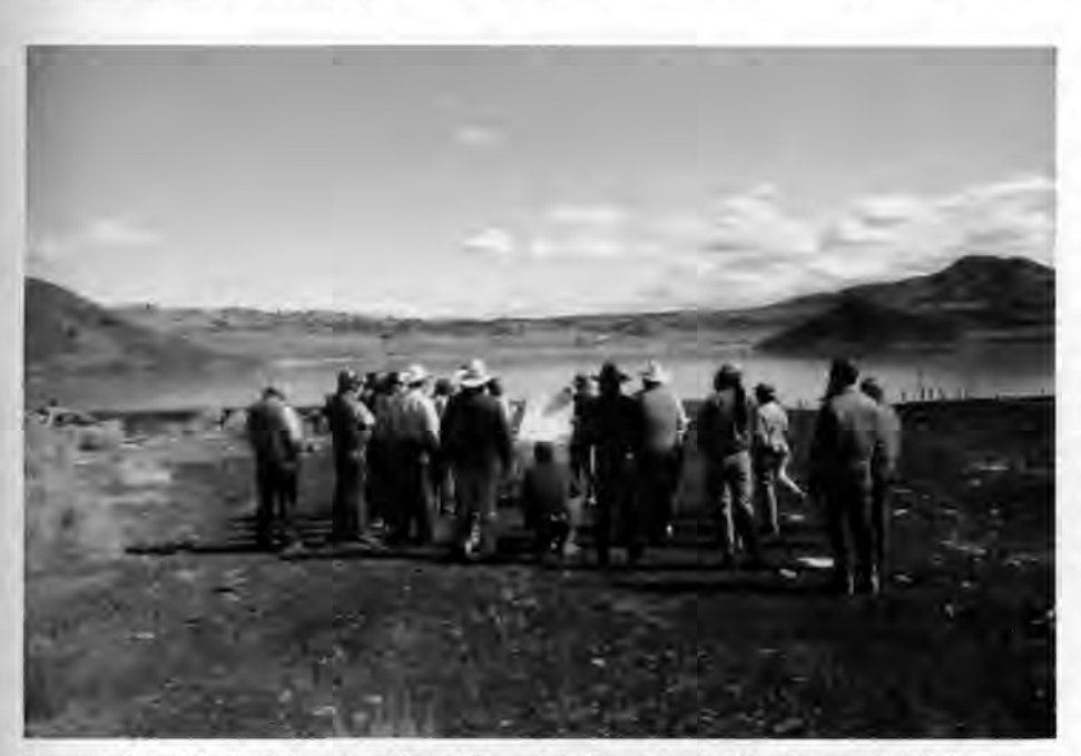
Representatives of the Zuni, Acoma, and Hopi tribes and the Ramah band of Navajos consult with the Bureau of Land Management and the U.S. Geological Survey at Zuni Salt Lake, March 10, 1992.

ly been finalized. At that point, historic properties are dealt with through avoidance, at best, or most commonly, through a program of treatment designed to mitigate the effects of the undertaking on those properties. The tribe knows of no way to mitigate impact to a traditional cultural property that is to be affected by an undertaking. Consequently, from the perspective of the Zuni Tribe, it would be much more appropriate for agencies and developers to consider traditional cultural properties when the feasibility of projects is being initially considered. In this way more equity can be developed between the dominant society's needs and those of the Zuni Tribe.