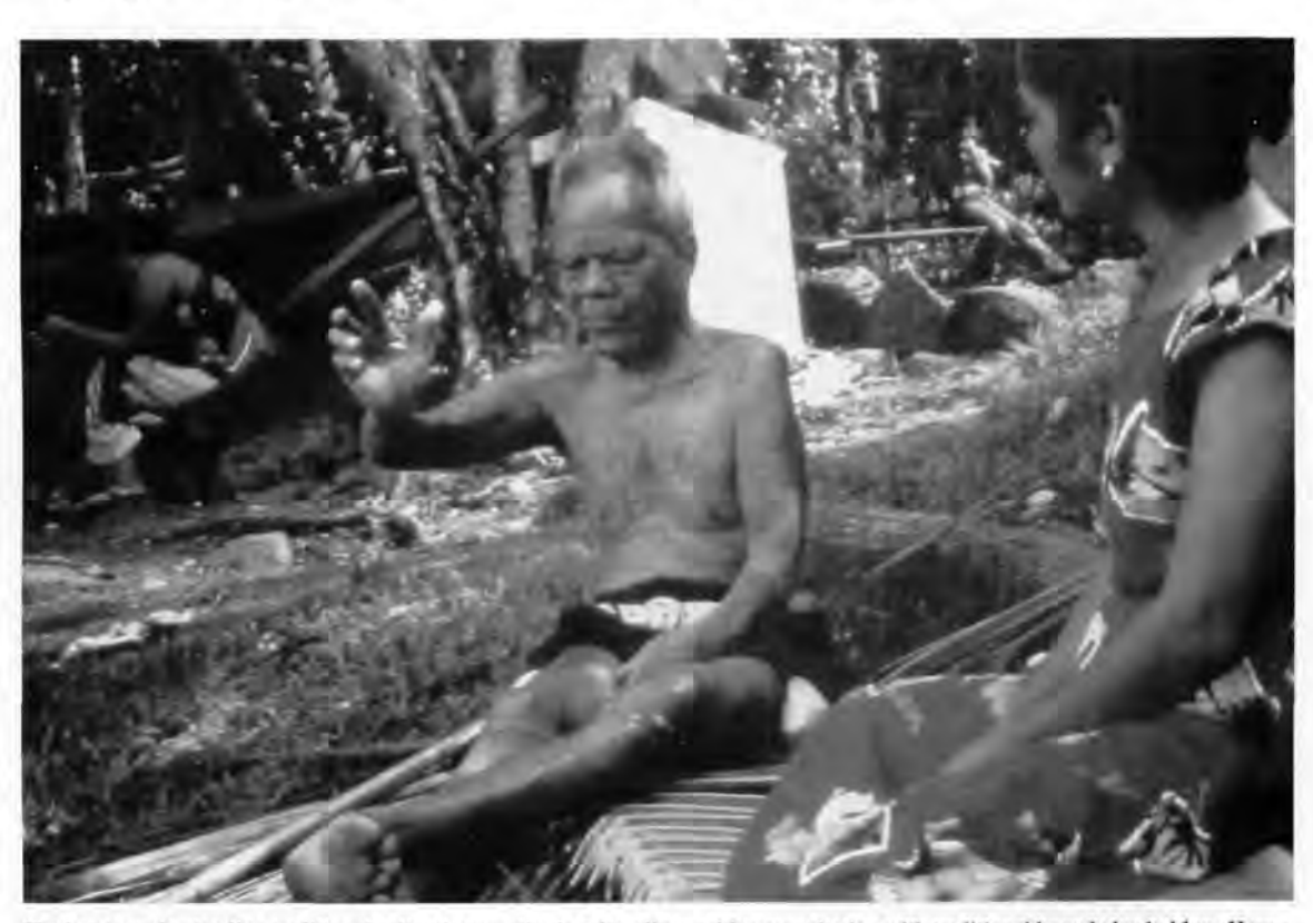
The key to understanding traditional cultural properties is culturally sensitive consultation with traditional knowledge holders. Here a Micronesian elder imparts traditions about his islands to a respectful listener.

In this early phase, there was no attempt to understand use of the area from a Pikani perspective. The forest archeologist at that time contacted the Blackfoot Cultural Representative by mail and asked that he identify sacred sites on a map so that they could be avoided. He never responded. The Forest Service believed they had made a good faith effort to identify and protect sites important to the Blackfoot people. The cultural representative believed he had been asked to do the impossible. Following the surveys, the forest archeologist and the Blackfoot Cultural Representative visited one of the identified sites. The forest archeologist concluded the site was probably not a significant Blackfoot cultural site and instructed the Cultural Representative to relay that conclusion to Blackfoot traditionalists. Results of the various archeological studies, with limited input regarding specific locations by Blackfoot representatives, comprised the basis for consideration of