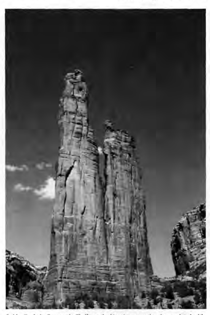
Spider Rock, in Canyon de Chelly on the Navajo reservation, is associated with a number of important cultural traditions among the Navajo, including the teachings of Spider Woman, one of the First People.

As we see it, there are two issues that must be addressed to alleviate some of the practical problems