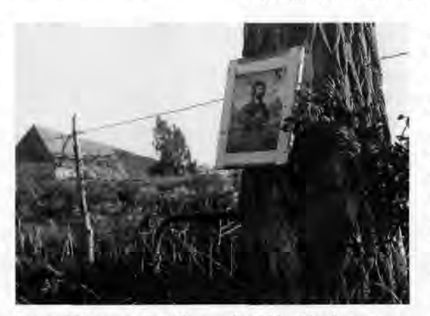
Image of the patron saint of farmers, San Isidro Labrador, on a tree in a corn field at La Manga, NM.

natural and cultural resources identified in the park. This information can then be used by park staff to ensure the protection of places and resources of significance to the American Indian and Hispanic communities with traditional ties to the park. We also propose to outline a consultation procedure for the park staff to follow in future contacts with the traditional communities.