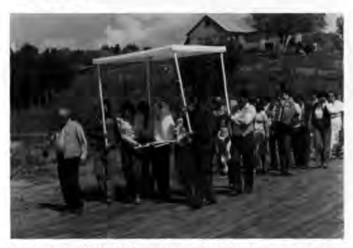
Religious processions are an important part of feast day observances. in this photo residents of Tecolote, NM carry the image of their patron saint, Our Lady of Sorrows.

Adjacent Landowners—these are people whose lands adjoin the park. Their concerns have largely to do with the impact of park operations on the long-term value and use of their own lands.