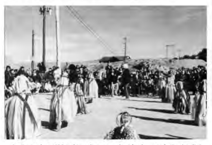
... for the conduct of Matachines dances was found to have made the site eligible for the National Register.