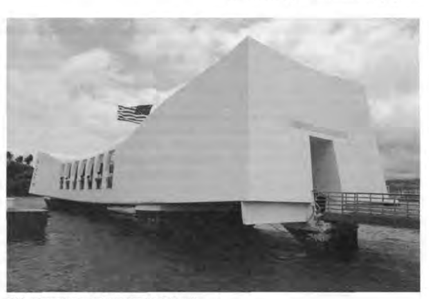
USS Arizona Memorial, Pearl Harbor, Hawaii