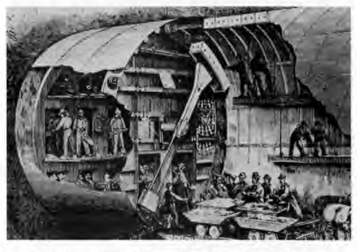
Excavating and assembling the cast iron tunnel lining. Scientific American,

The first structure type to be studied under this initiative will be tunnels. Tunnels are built for different needs, including transportation, mining, and water supply. Depending on the purpose of the tunnel, and the nature of the material through which it must pass, different methods of construction are required. For example, the most difficult aspect of tunneling through hard rock is the method by which the rock is cut and removed from the tunnel heading. At the same time, little problem is encountered in shoring-up the ceiling of the excavated void because the rock often supports its own weight. On