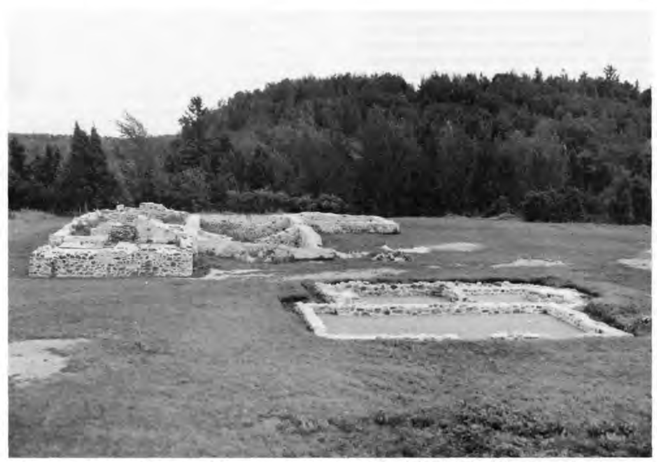
Stabilized ruins of La Grande Maison and the bakery (foreground) at Forges du Saint-Maurice NHS in 1973: major intervention, minimal presentation.