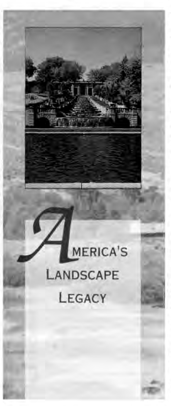
America's Landscape Legacy brochure.

This work, written as a result of the authors' participation in the Institute on Teaching Public History held at Arizona State University during the summer of 1984, examines fundamental questions regarding the nature and relevance of history as a discipline and calls for the reconciliation of academic and public history