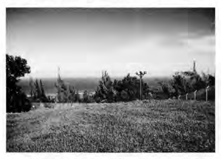
Opana radar site, Kawela, Hawaii, view looking north.

An even more significant aspect of the Opana radar story was the fact that the potential military implications of radar was now obvious for all to see. The use of radar gave the United States the important technological edge that was needed to redress the balance of power with Japan in the Pacific in 1942. In the months after Pearl