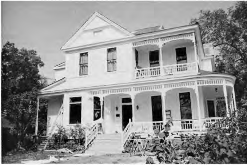
This house at 1200 Dauphin Street in Mobile was condemned by the fire marshall and was days from demolition (August 1990 photo). After being placed on the Endangered Properties List, it was purchased by new owners and underwent a $80,000 restoration in which a $10,000 facade grant played a role (September 1992 photo).