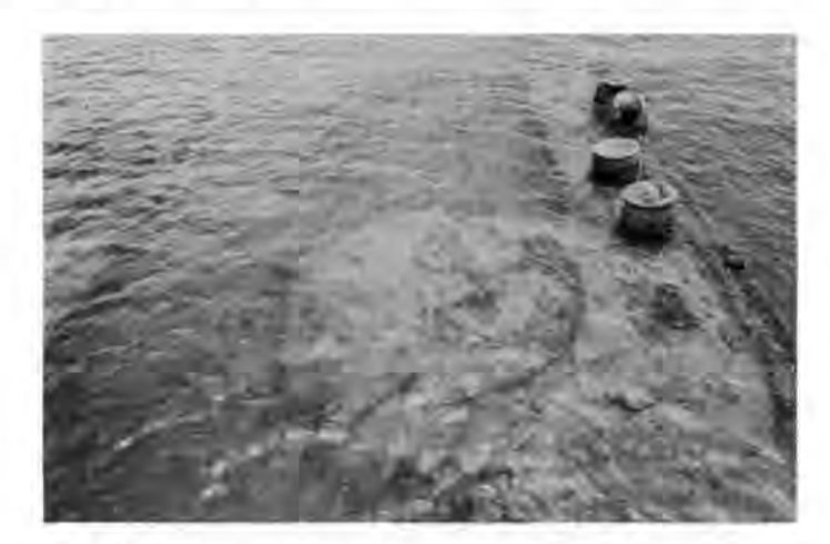
View of USS Arizona under the surface.

many of which are on lands administered by the Department. Sites and programs of the National Park Service will continue to be used to enhance public respect for and understanding of the events leading to the Allied triumph over the Axis.