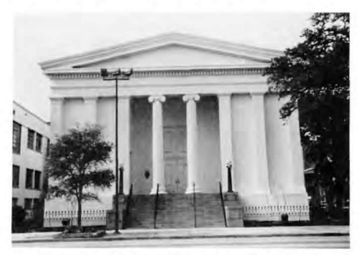
14. Government Street Presbyterian Church (1836-37), Mobile.

However, before the 19th century Mobile was not a very prosperous town, and, until the Americans took over in 1813, most of the buildings were simple wood houses. It was not until the 1830s, when Mobile became second only to New Orleans as a cotton port that there was a need for important or monumental buildings. This demand occasioned the arrival of the Dakin Brothers and James Gallier from New Orleans whose Greek Revival-styled stucco buildings had put a fashionable appearance on New Orleans. During the 1830s, this firm designed some of Mobile's most notable stuccoed Greek Revival buildings. These include the Barton Academy (1835-37) and the Government Street Presbyterian Church (1836-37). Both of these structures are of stuccoed brick, and the Government Street Church is probably one of the firm's greatest architectural successes (photo 14). The Dakins may have also been responsible for the design of another important stucco