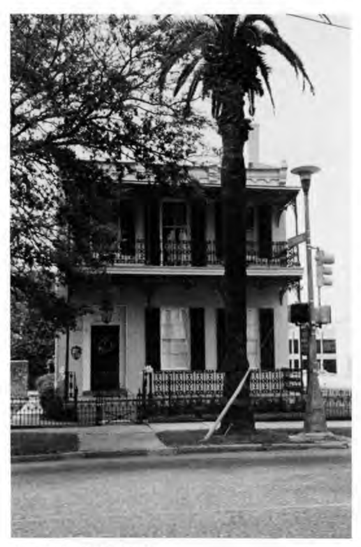
16. Carter House (1854), Mobile.

Partly as a consequence of these fires, the Dakins left Mobile and returned to New Orleans in 1839, but stucco continued to be a popular building material in Mobile for such public buildings as the U.S. Marine Hospital (1839–42) and the City Hall and Southern Market (1856–57) (photo 15). In fact, it appears that most of the major public as well as private structures in antebellum Mobile were stuccoed, including residences such as the 1854 Carter House (photo 16).