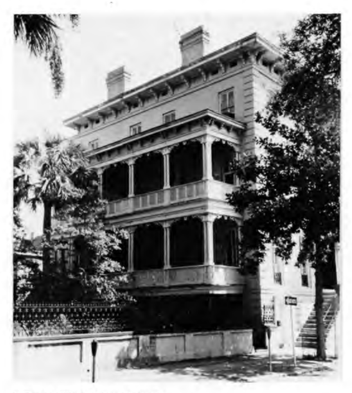
6. Tuscan Villa (c. 1860s), Savannah.