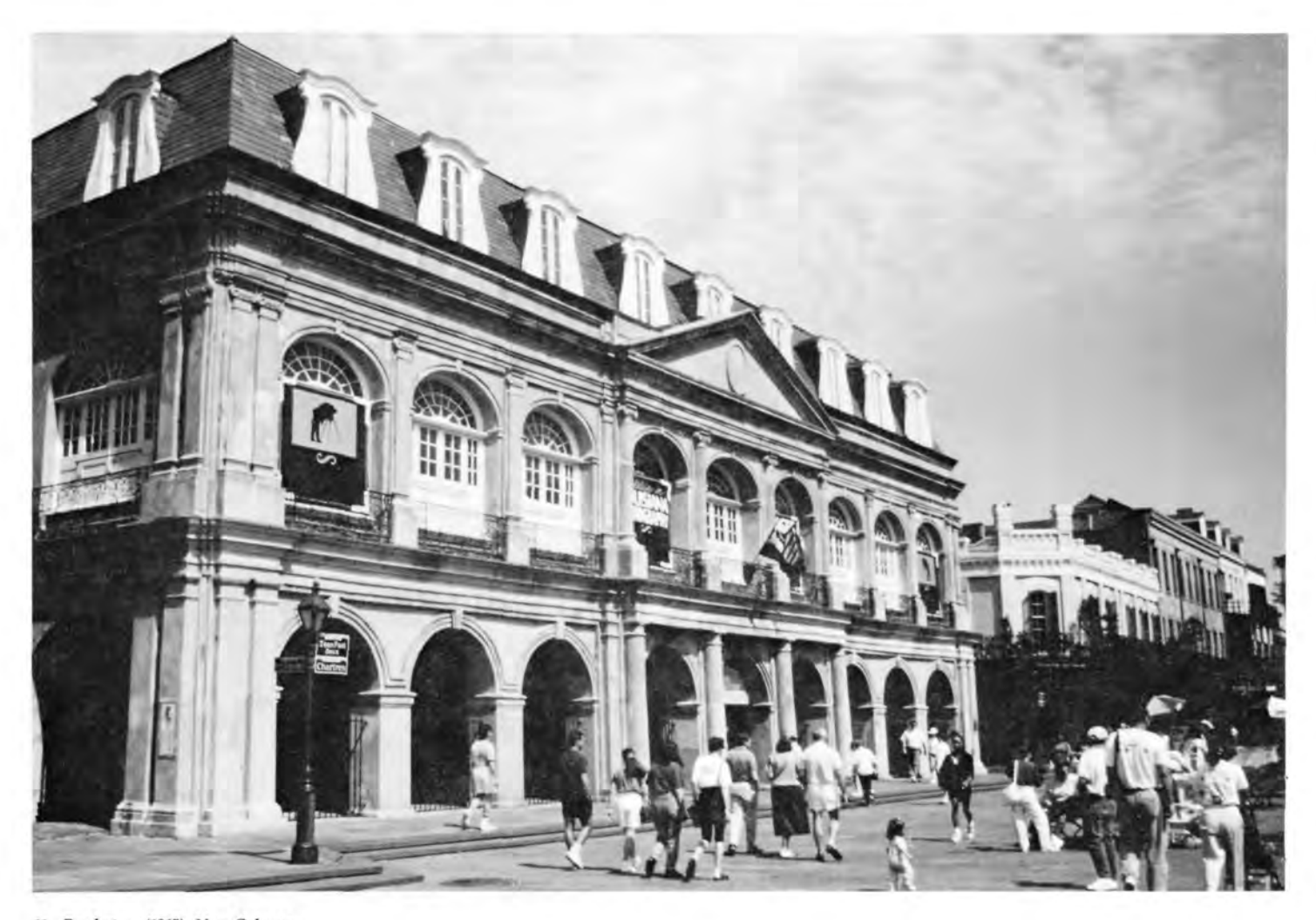
11. Presbytere (1815), New Orleans.

in Regency England where stucco was the exterior finish coat of choice for brick buildings. Despite his short time in New Orleans—he died of yellow fever nine months after his arrival—Latrobe had a notable impact on New Orleans' architecture. Perhaps most significant was the stuccoed Louisiana State Bank (1820–22), built according to his designs but after his death (photo 12).