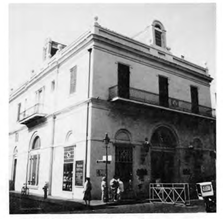
12. Louisiana State Bank (1820-22), New Orleans.

In New Orleans, stucco endured as a popular building material throughout the 19th century for all types of structures including this mid-19th century residence in the Lower Garden District (photo 13).