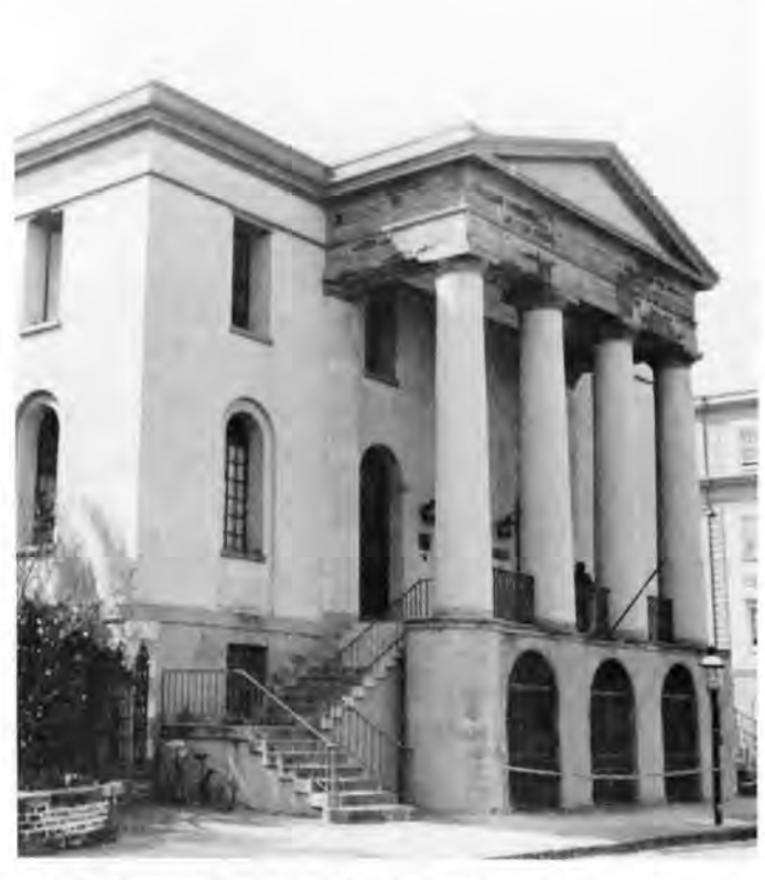
Public Records Office, or Fireproof Building (1822-26), Charleston.

The popularity of stucco in Charleston peaked again with the advent of the Gothic Revival and Greek Revival styles. The Gothic-style stuccoed Marine Hospital, also designed by Mills, was built in 1831. When the Hibernian Society Building, designed by Thomas U. Walter, one of the architects of the U.S. Capitol, was constructed in 1835, it marked the beginning of the Greek Revival style in Charleston (photo 8). The 1840–41 Market Hall, a National Historic Landmark and one of the city's most familiar stucco buildings, is an example of another of the revival styles—in this case, Roman Revival.