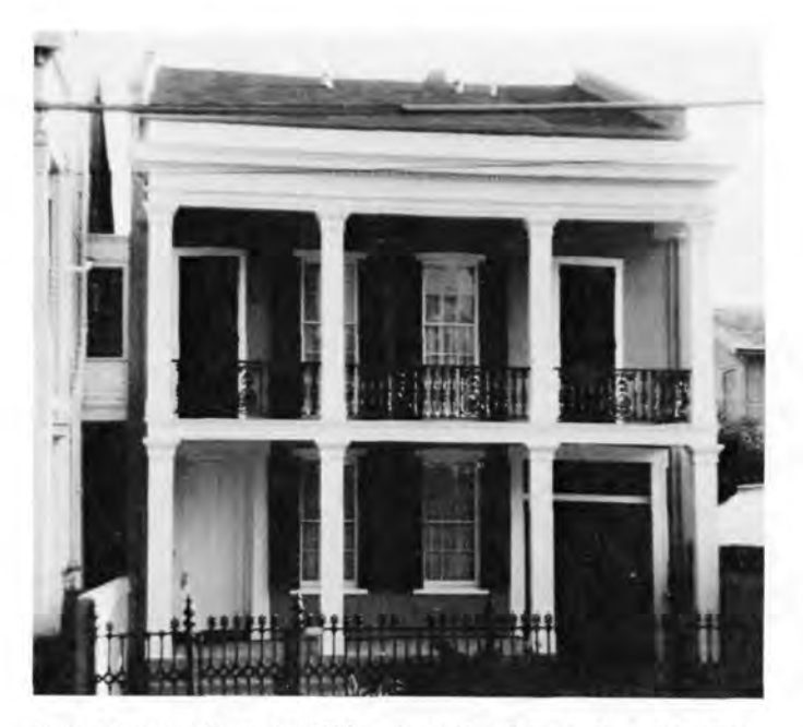
13. Greek Revival House (mid-19th century), New Orleans.

The Southern Stucco Tradition (continued from page 15)