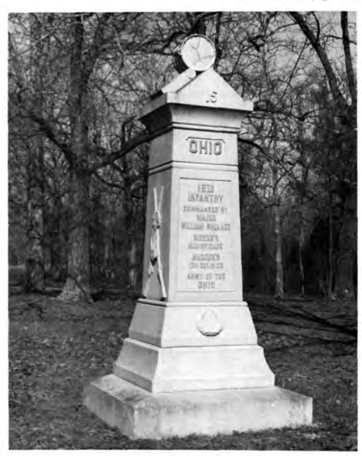
Information on monuments like this one at Shiloh will eventually be a part of the CWSS.

Cultural Resources Management Information for Parks, Federal Agencies, Indian Tribes, States, Local Governments and the Private Sector