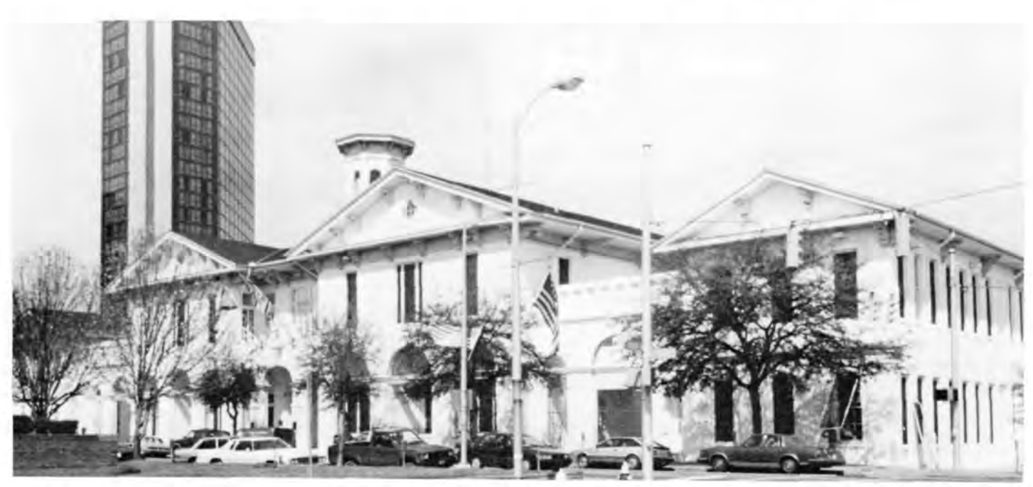
15. City Hall and Southern Market (1856-57), Mobile.