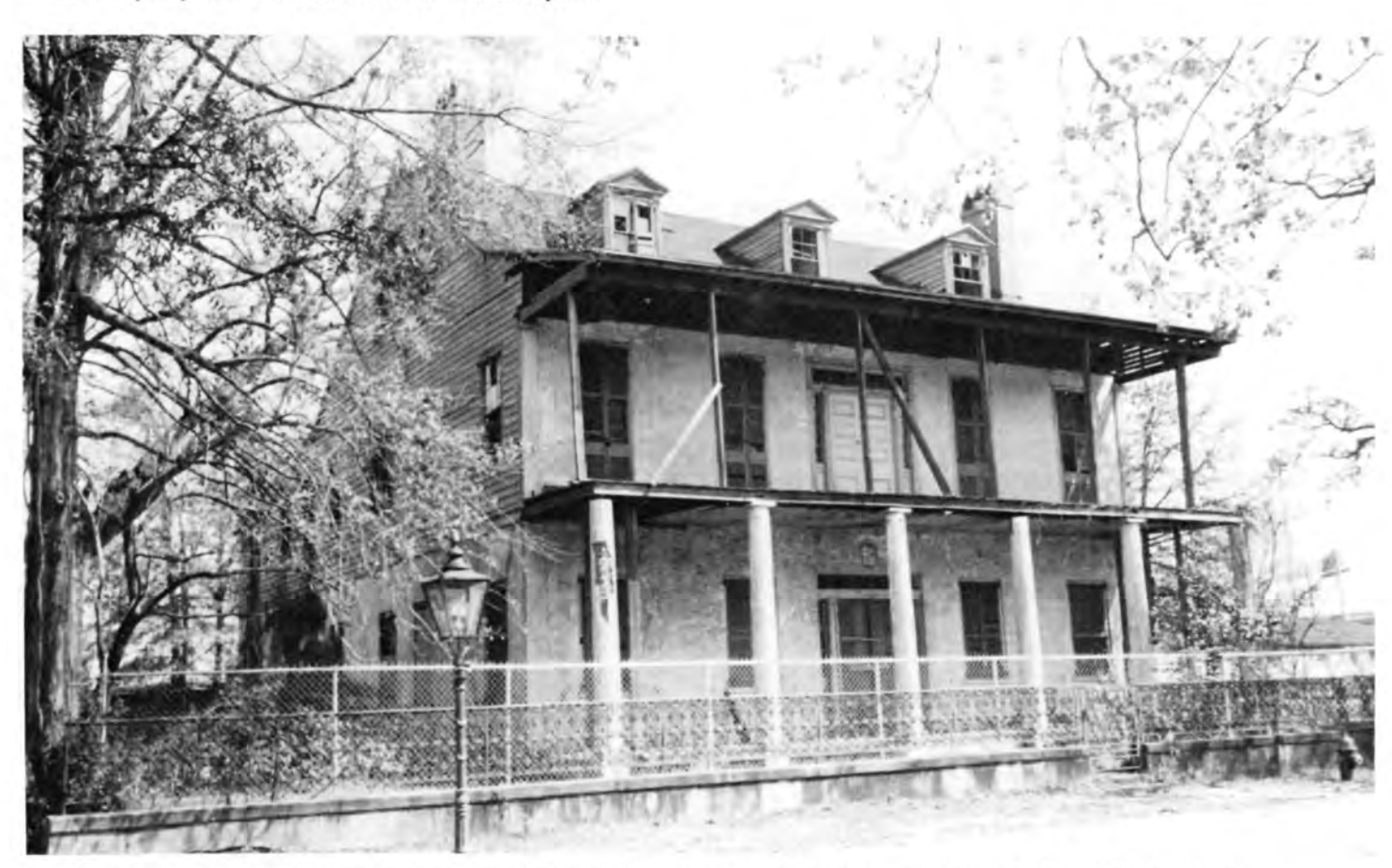
20. The primary facade, and first story of the side elevation of this early 19th century house in Mobile have been stuccoed and scored, but the second story of the side elevation is clapboarded.