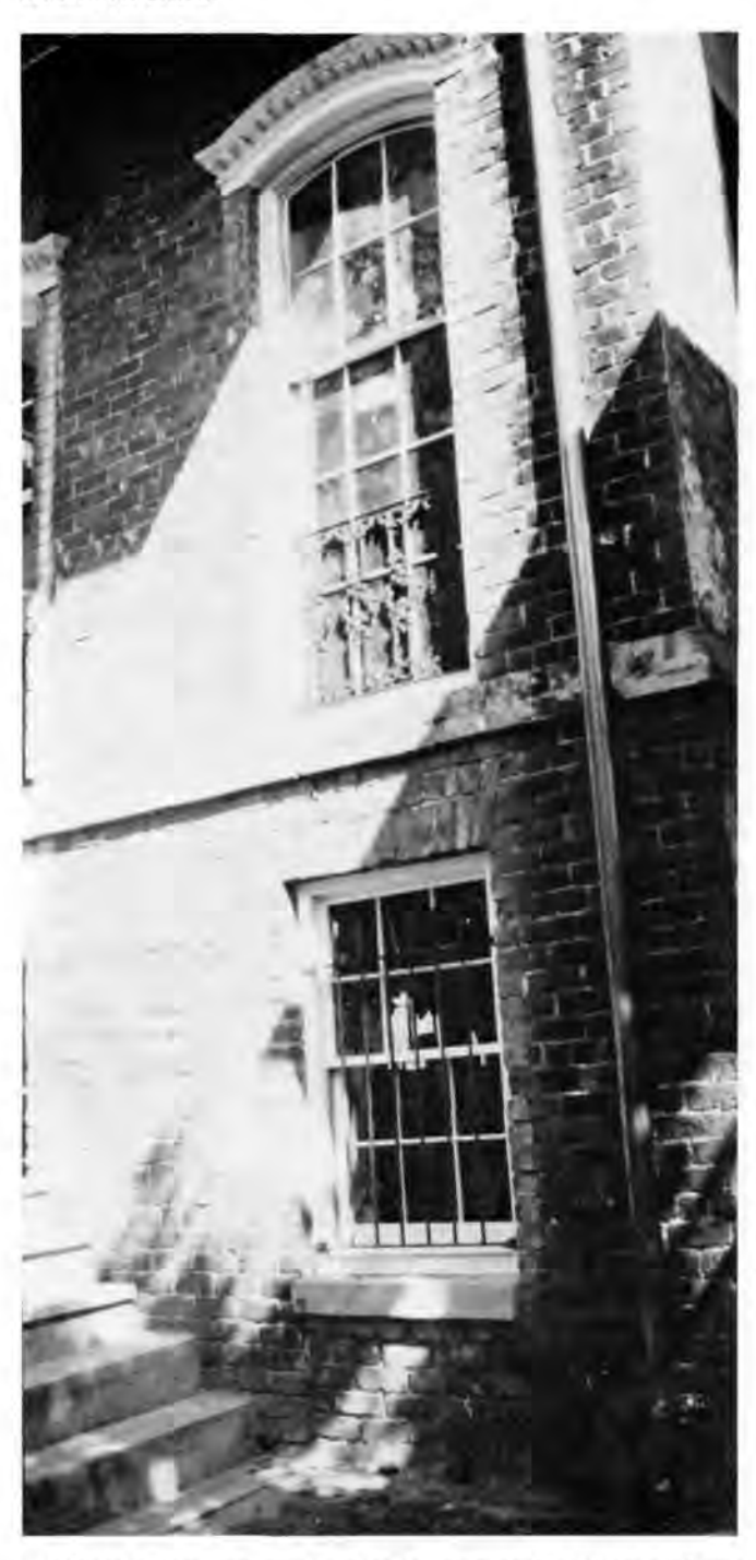
The somewhat rough quality of the brickwork on this 19th century house in Savannah may indicate that the house was stuccoed originally.

were of poor quality and needed a stucco coating for protection. Stucco was, and is, an inexpensive material, and for minimal cost, a coat of stucco could give the impression of finely-dressed stonework. Yet, it appears that the immense popularity of stucco as an exterior finish treatment in Charleston, Savannah, New Orleans and Mobile in the late 18th century and through much of the 19th century was primarily the result of the influence of European architectural tradition and fashion, combined with the versatility of stucco and its compatibility with the lifestyle and climate of these southern cities.