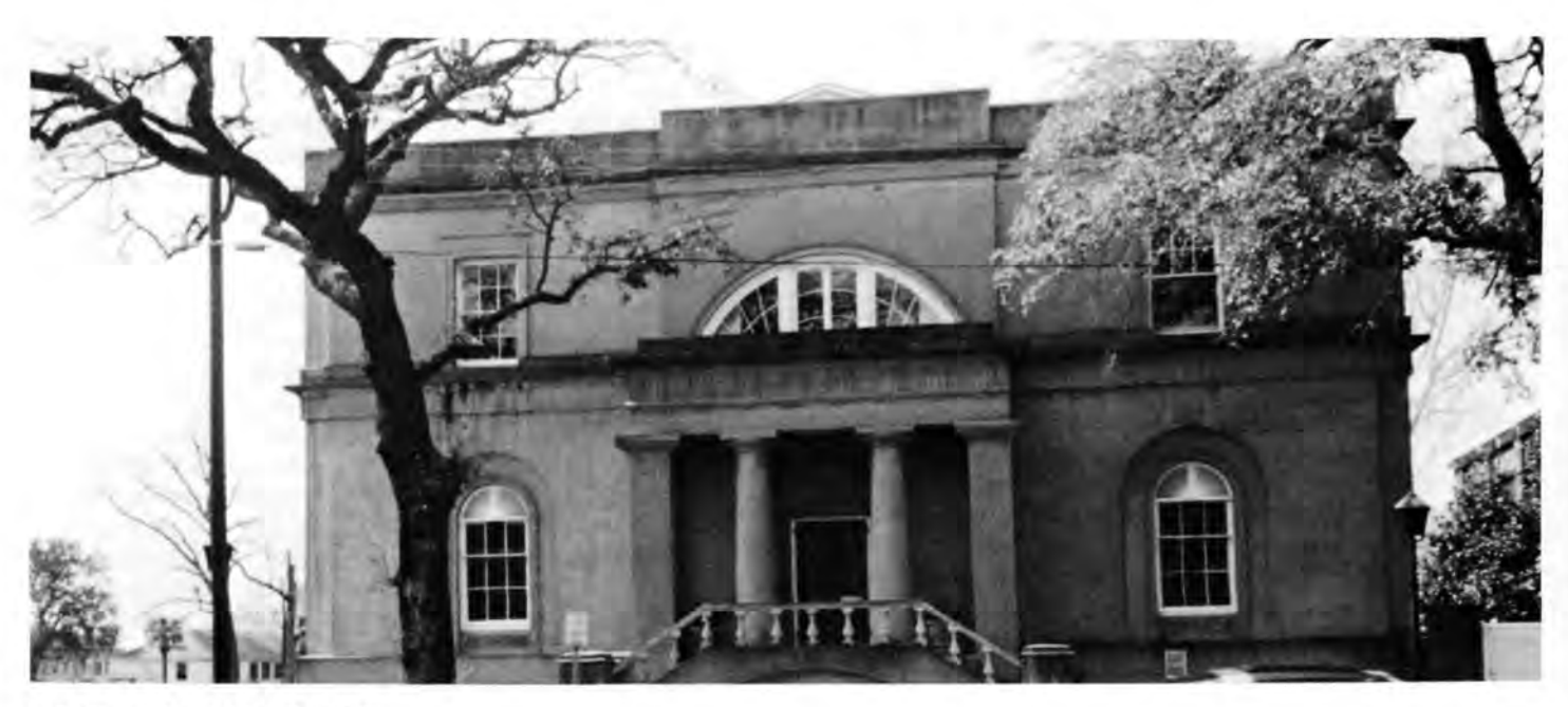
3. Scarbrough House (1819), Savannah.