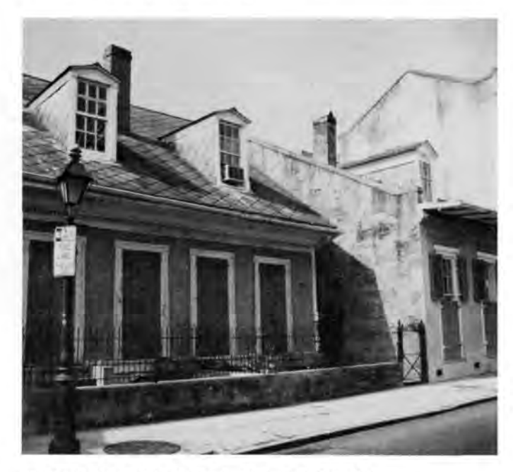
17. Creole Cottage (late 18th-early 19th century), New Orleans.

While remnants of original lime and natural cement stuccos can be found on some buildings in these cities, obviously the great majority of stuccoed buildings have been patched, or totally recoated with modern portland cement-based stucco. The stuccoed surfaces of most of the high-style, and public buildings in these cities were originally scored to resemble masonry units. The stucco was either incised, or lined with white lime or a black-pigmented powder, but over the years as they have been patched and restuccoed, many of them have lost their scoring. Stucco was also used decoratively to create cast or molded details, such as decorative quoins and banding. But scoring may not have been so typical for many of the early, smaller residential buildings, such as the one or one-and-one-half story Creole cottages in New Orleans' Vieux Carre, or similar houses in the other cities (photo 17). Scored stucco appears to have become more popular for some of these smaller residential buildings later in the 19th century, around the 1840s, with the introduction of more sophisticated architectural styles of that period.