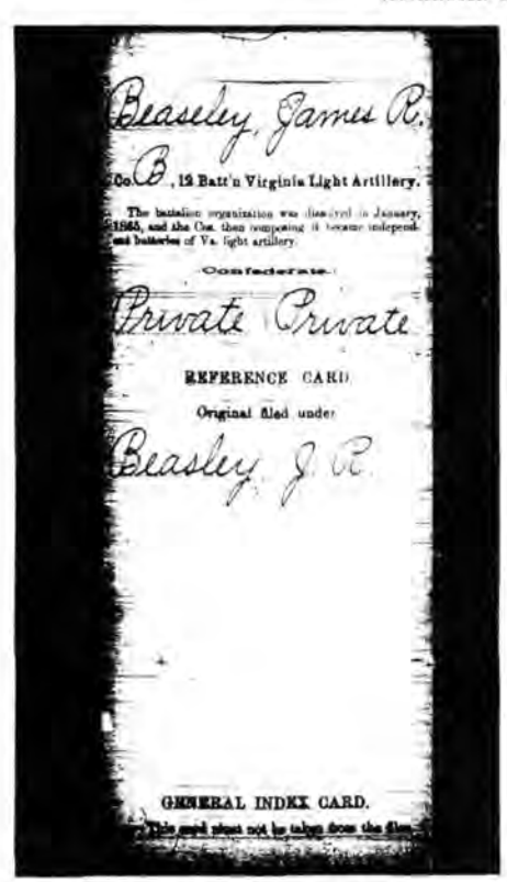
A microfilm copy of one of more than five million index cards to the Combined Military Service Records at the National Archives.