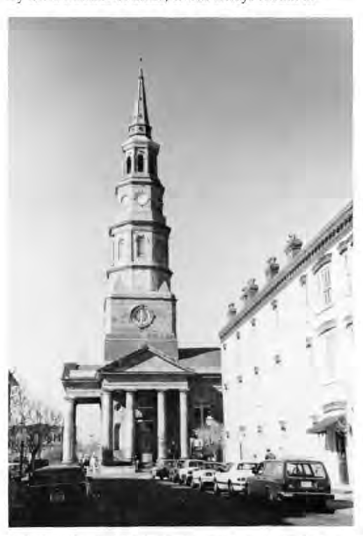
2. St. Philip's Episcopal Church (1711-23, restuccoed c. 1839), Charleston.

In Charleston, St. Philip's Church was constructed from 1711–1723 with elegant classical proportions based on English stylebooks (photo 2). It marked the arrival of academic architecture in South Carolina, and although the church was damaged and nearly destroyed by fire a number of times, it was always rebuilt in