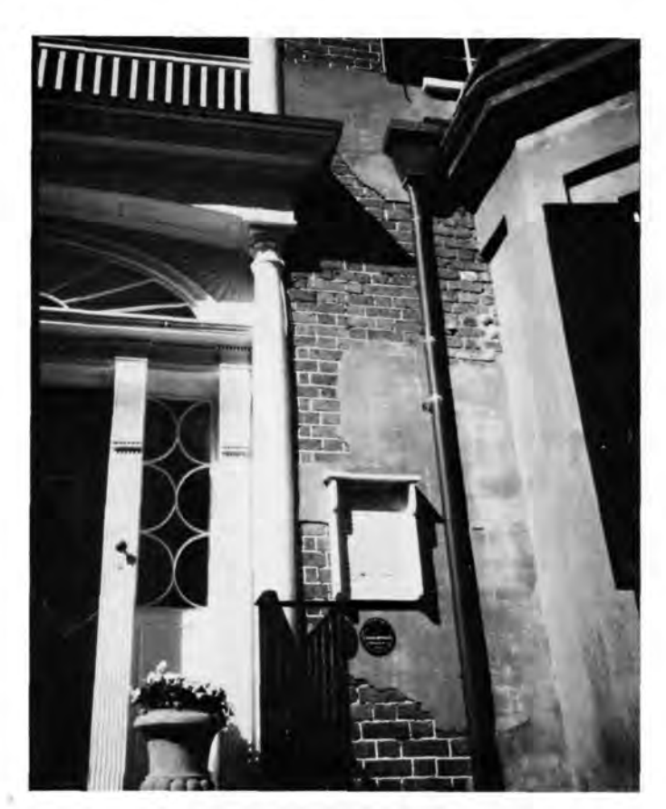
The existence of such fine quality mortar joints is evidence that this brick house in Charleston was not stuccoed originally.

The Southern Stucco Tradition (continued from page 13)