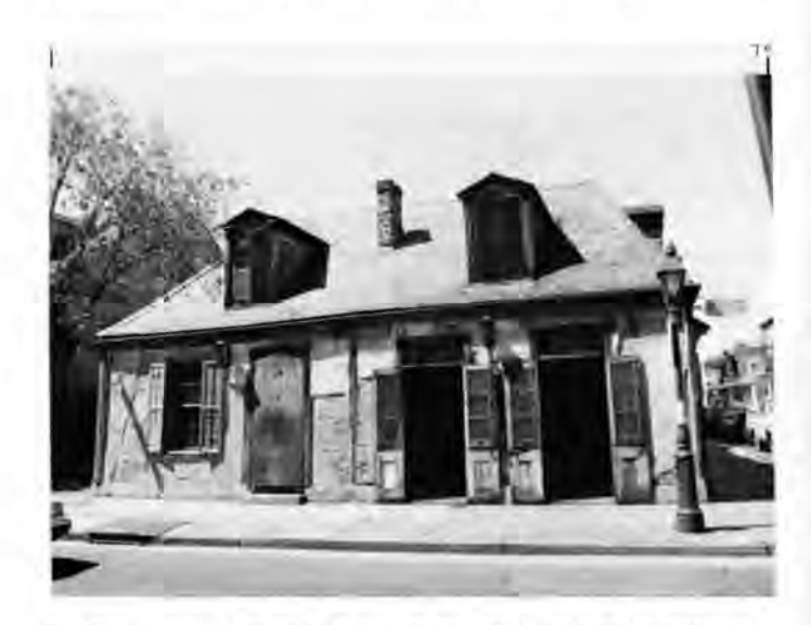
The restoration of Lafitte's Blacksmith Shop (c, 1772-91) in New Orleans' Vieux Carre reveals the building's "briquette entre poteaux" construction.

But the majority of the very early settlements were of wood, and consequently victim to the fires that ravaged these cities with such regularity. The city of Charleston, for example, was swept by so many devastating fires in the 18th century that no structures remain that were built before 1740. Savannah, too, suffered a major fire in 1796, and again in 1820. Most of the important public and private buildings of Mobile were destroyed by two fires in 1839, and New Orleans was scarred by fires in 1788 and 1794. As a result of the 1794 fire, in an attempt to prevent future fires of this magnitude, the Spanish authorities in New Orleans enacted a law in 1795 requiring that all new houses within the central fortified area of the city be constructed of brick, or of timber frame filled with brick ("briquette entre poteaux"), and coated with cement or lime 1" thick. This law was undoubtedly responsible at least in part for an increase in the numbers of stucco buildings in New Orleans in the late 18th and early 19th century.