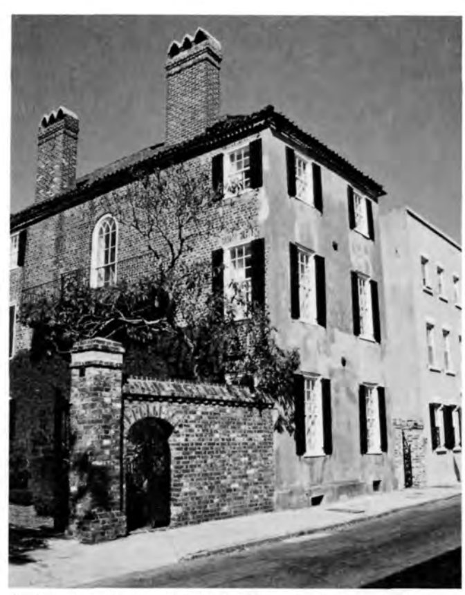
Only the primary facade of this brick house in Charleston has been stuccoed, perhaps because of fashion dictates or to conceal repairs.