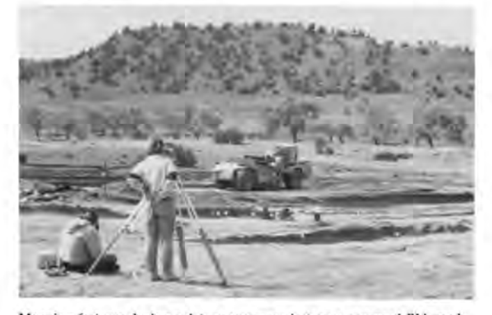
Mapping features during a data recovery project on a proposed BIA road, Mexican Springs, New Mexico. The Zuni Archaeology Program is conducting all phases of the data recovery under a NNHPD Roads Program contract.

In 1990, HPD contracted, through the Indian Selfdetermination and Education Act (P.L. 93–638), the services of Bureau of Indian Affairs (BIA) cultural resource management functions for Branch of Roads, Branch of Forestry, Branch of Land Operations, Facilities Management, and Cultural Resources Compliance Section (CRCS). After CRPA was implemented, tribally funded Physical Anthropology/Repatriation and Traditional Culture programs were developed. Land Operations, Forestry, Roads, Physical Anthropology, and Facilities Management comprise the Field Services Section of HPD. CRCS and Traditional Cultural Properties make up two separate sections.