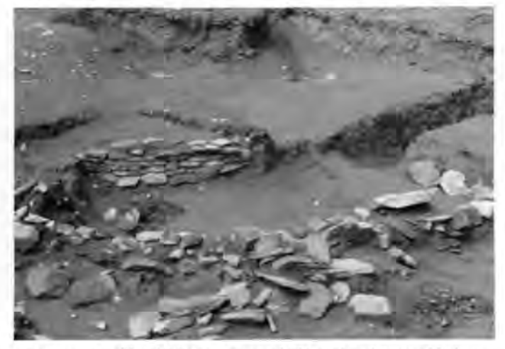
An excavated prehistoric site on a proposed BIA road project near Mexican Springs, New Mexico. The Zuni Archaeology Program is conducting all phases of the data recovery under a NNHPD Roads Program contract.

Facilities Management is responsible for evaluating historic buildings, preparing contracts, formulating historic preservation plans, coordinating with State Historic Preservation Offices, and preparing documents for the transfer of historic buildings from the BIA to the Navajo Nation. The Physical Anthropology program is in charge of the reburial of all historic and prehistoric remains found on the Reservation, and formulating, implementing and administering Navajo Nation policy regarding human remains.