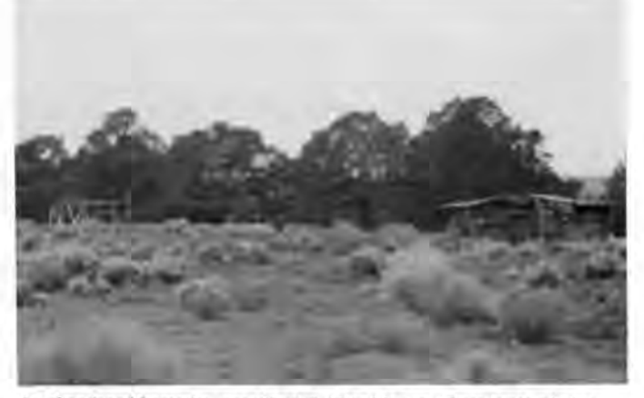
An abandoned homesite, near Crystal, New Mexico. These types of sites have religious significance which must be considered during any project that may affect the site.

The goals of HPD are far reaching. HPD's primary and most important goal is the preservation of the Navajo Nation's cultural resources, with special emphasis on the resources and preservation concerns important to Navajo people. An additional primary goal is to train Navajos as qualified cultural specialists so they may represent the Navajo people in tribal preservation dialogue. HPD also aspires to protect and manage cultural resources on lands owned, administrated, or controlled by the tribe; foster conditions under which the Navajo Nation's cultural resources can coexist with modern society in productive harmony; and promote the adaptive reuse of the Navajo Nation's stock of historic buildings.