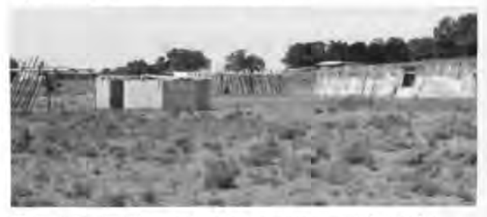
These structures are in preparation for a summer ceremonial, the Ndaa, near Crystal, New Mexico. This ceremony is a complex religious event that involves three different locations.

and contemporary issues. HPD also publishes the Navajo Preservation Quarterly , a newsletter, to inform and educate individuals, chapters, tribal and Federal agencies and other interested parties.