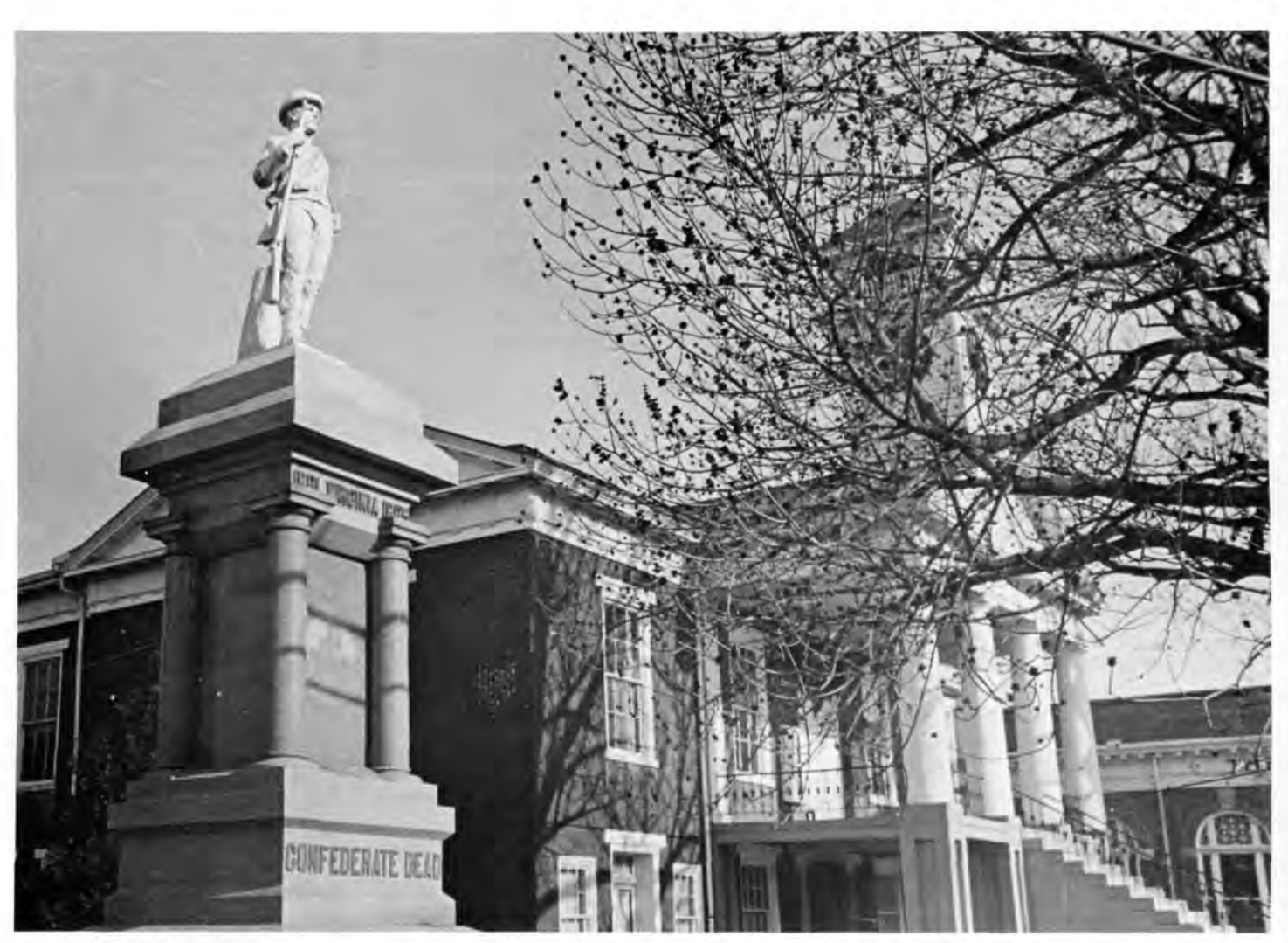
Pittsylvania County Courthouse

Pittsylvania County Courthouse (continued from page 5)