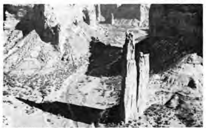
Overlook view-Spider Rock, CACH (Canyon de Chelly), Nov '88.