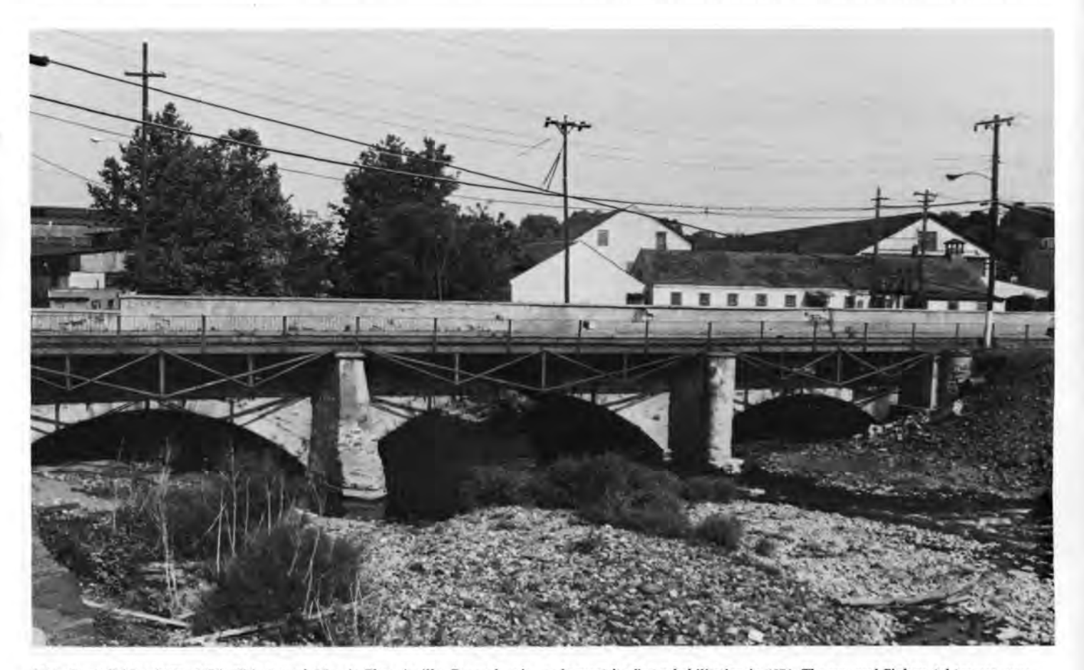
Main Street Bridge (1851, 1874). This stone bridge in Phoenixville, Pennsylvania, underwent its first rehabilitation in 1874. The unusual Fink metal trusses were added to carry a streetcar line. Current plans call for two 40-foot sections of the bridge to be used as a pedestrian bridge in a county park.

Several reasons account for the widespread replacement of historic bridges. The reasons relate both to