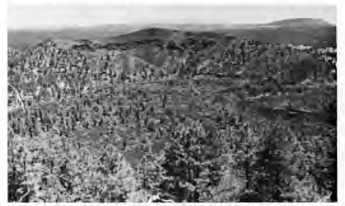
Bandera Crater, El Malpais National Monument.

*From an open letter from the Ramah Chapter of the Navajo Nation to the National Park Service and Bureau of Land Management