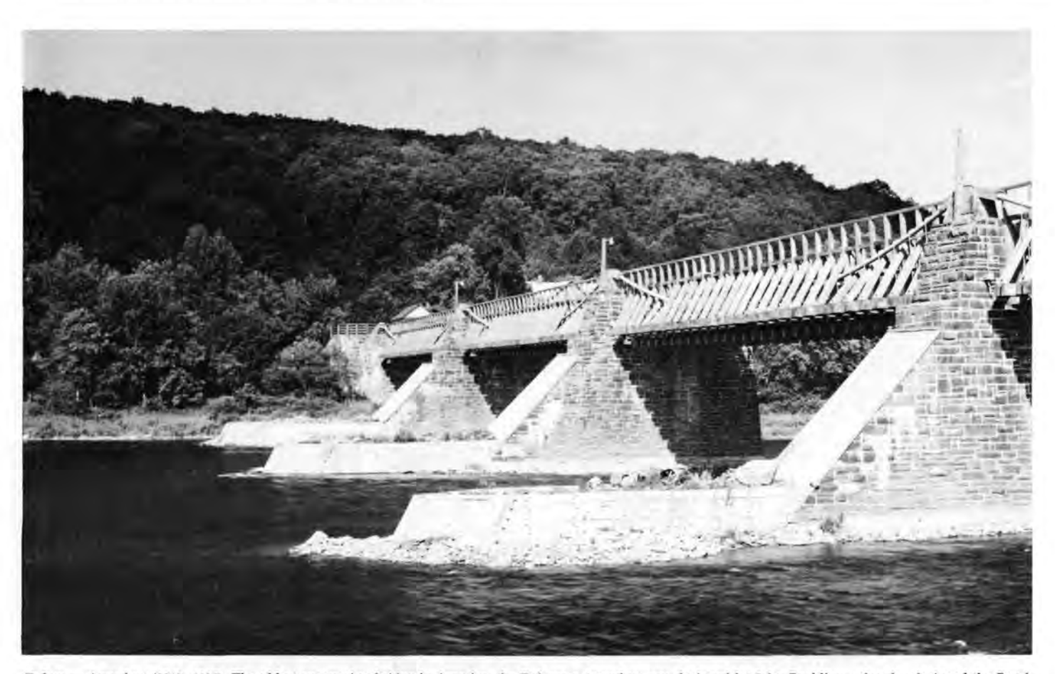
Delaware Aqueduct (1849, 1987). The oldest suspension bridge in America, the Delaware Aqueduct was designed by John Roebling, who also designed the Brooklyn Bridge. The aqueduct carried the Delaware and Hudson Canal across the Delaware River. Purchased by the National Park Service in 1980, the superstructure was reconstructed in 1987. The project received a Presidential Design Award.