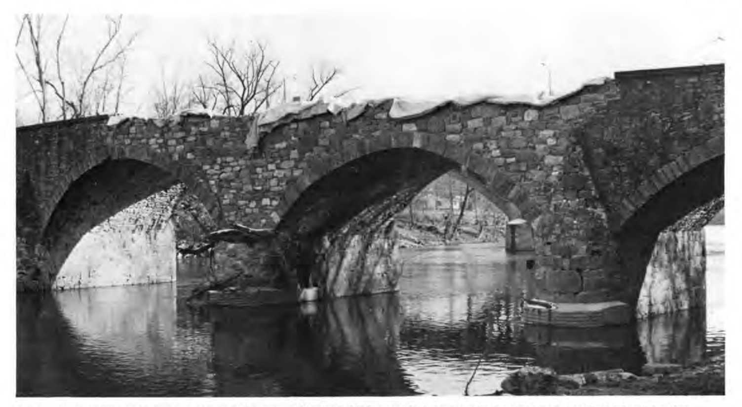
Wilson's Bridge (1819). Located seven miles west of Hagerstown, Maryland, this five-span bridge was greatly damaged by a spring flood. When it was then scheduled for demolition, a volunteer team from the Washington, DC chapter of the Society for Industrial Archeology assembled to measure and record the structure. The event was well covered by local media. As a result, it attracted the attention of a local contractor, who repaired the bridge at cost. This view shows the stonework in the process of being reassembled.