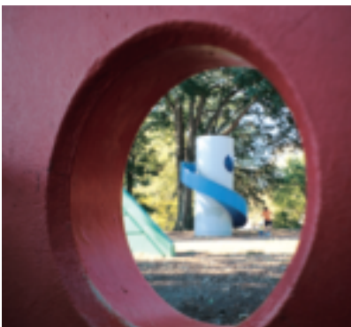
Left top: McCormick Pool by Garrett Eckbo. Left below: Piedmont Park Playground by Isamu Noguchi. Right: Eckbo’s ALCOA Garden, with aluminum screens and trellis.