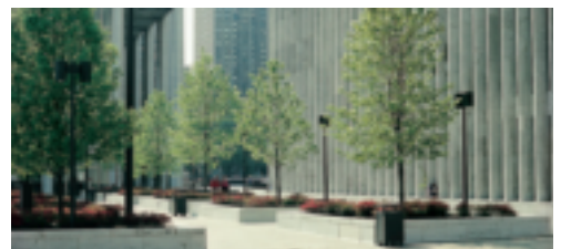
Clockwise from lower left: Fountain in Denver's Skyline Park by Lawrence Halprin; Dan Kiley's Lincoln Center design "before"; Kiley's masterpiece, the Miller Garden; Lincoln Center "after," trees removed.

Apply the Secretary of the Interior's Standards The standards require scholarship. The National Park Service recently produced reports on a pair of Dan Kiley landscapes—the mall at Independence National Historical Park in Philadelphia and the Jefferson National Expansion Memorial in St. Louis. Such research records the works in detail and informs management decisions.