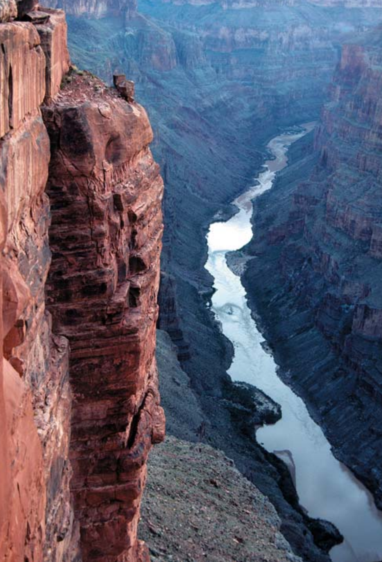
LEFT GRAND CANYON NATIONAL PARK. RIGHT LITTLE BIGHORN BATTLEFIELD NATIONAL MONUMENT