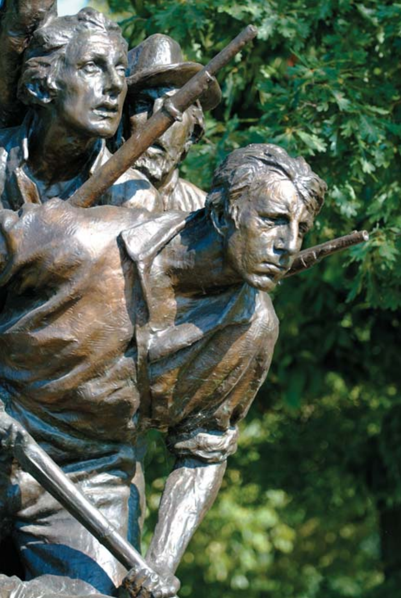
LEFT, RIGHT