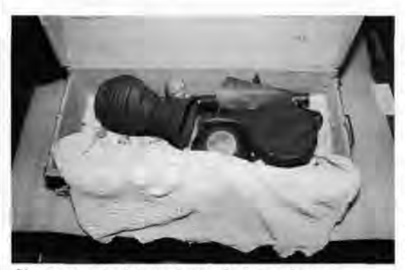
Chest or trunk, date and manufacture unknown. Contents of the trunk have various dates and origin of manufacture. (DEVA63126)

On January 5, 1999, a Death Valley National Park visitor delivered a mysterious trunk and its contents to park headquarters. The visitor claimed he had found the trunk under a rock overhang deep within the park's backcountry. A handwritten manifest and a letter in the trunk purportedly associated the find with the "Lost '49ers," a group of men, women, and children who traveled through Death Valley in December 1849 and January 1850 en route to the gold fields of California. If validated, the trunk would be historically significant, as only a small number of artifacts from this group of argonauts are known to exist.