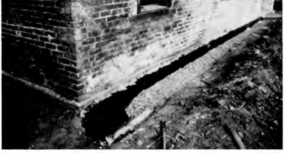
Photo 1. Whenever possible, ground moisture, wicking into a building, should be diverted from the foundation of a building. Shown is a sloped drain pipe, placed in a gravel bed at the base of the foundation wall. The below grade foundation wall has also been treated with a water-proof bituminous coating to retard lateral damp. The new drain will divert water away from the footing and relieve seasonal hydrostatic pressure.