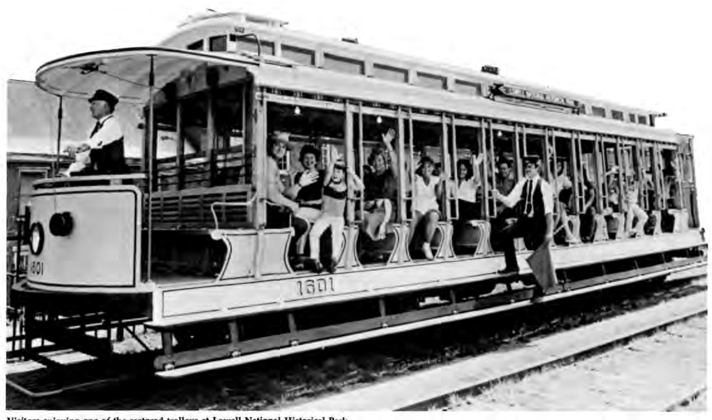
Visitors enjoying one of the restored trolleys at Lowell National Historical Park.

voices of the housekeeper and mill girls the activity that went on here. Rangers on duty explain the exhibit and direct the flow of visitors through the two-story structure. On the second level, the boardinghouse gives way to the Immigrant Exhibit, a multi-image, multi-media visit with some of the more than 50 different immigrant groups who have moved into Lowell.