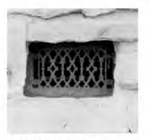
Photo 2. Historically, cast iron operable vents were built into foundation walls to provide air circulation to the crawl space. These vents should not be blocked with debris or sealed shut. They should be left open during hot or humid weather and if additional air circulation is needed, mechanical fans set on a humidistat/thermostat can often be installed on the inside of the vent grille. Sometimes, these common-sense treatments can reduce seasonal rising damp and eliminate the need for more invasive treatments.

If through moisture monitoring or other testing rising damp is diagnosed, there are a number of treatment options. Ground moisture can be removed or diverted (see photo 1); natural ventilation can be enhanced, artificial ventilation or dehumidification can be introduced into buildings to accelerate vaporization of moisture in walls (see photo 2); or the capillary action of moisture can be halted by the introduction (or repair) of a physical membrane (see photo 3) to create a waterproof barrier known as a dampcourse layer. Modern dampcourse layers can also be drilled or injected into a masonry wall, but this approach is invasive to the historic building. Treatments range from basic "common sense" maintenance to invasive injections into the walls. This article will focus on two "radical" approaches to controlling rising damp; in both cases they appear to have been effective, although the decision to use these treatments for other historic buildings should not