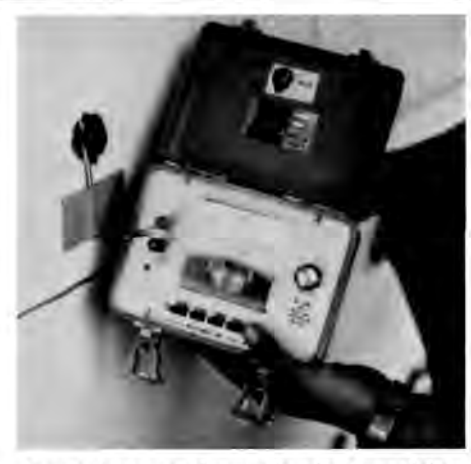
Photo 6. Moisture cells were installed around the perimeter of the René Beauregard House and on one of the columns. These cells, 22 of them, have been periodically read with a moisture meter to chart the success of the treatment.

In summary, after 10 years in place, the dampcourse layer created by the interlocking cores filled with a waterproof grout in the foundation walls and columns has effectively controlled the moisture from rising damp.