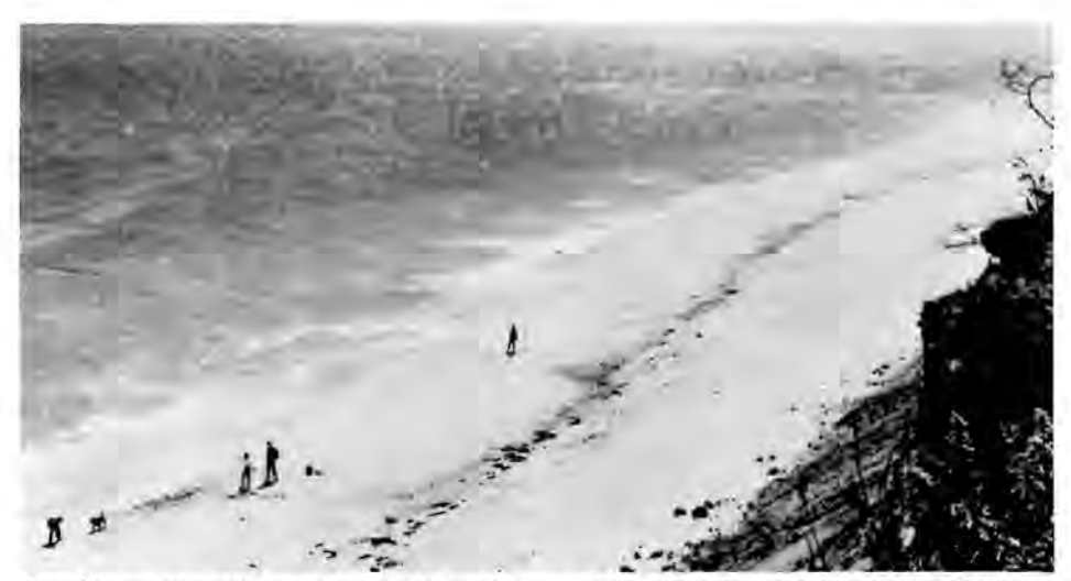
Cape Cod not only offers many recreational activities but also reveals a chapter in New England history dating from the Pilgrims to the space age.

It was not uncommon for ship captains in those days to first make landfall north of their final destination, and then to cruise along the coastline southward until their ultimate destination could be identified. But when landfall was made initially off of Cape Cod, and the Mayflower tacked southward, the crowded little vessel ran aground unexpectedly on the nearby Pollock