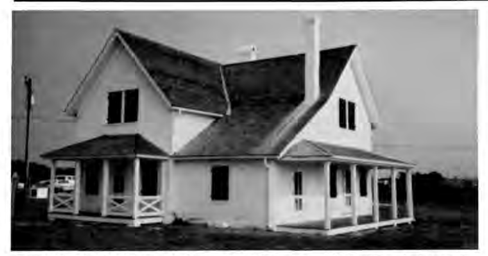
Photo 7. The Principal Light Keeper's Quarters, Cape Hatteras, NC, was built in 1870 and substantially remodeled and expanded in the early 20th century. Due to flooding, a high water table, and shifting sand, the brick foundation walls were chronically damp. Dry rot fungus had seriously deteriorated first floor joists built into seat pockets in the foundation wall. In 1985, a chemical dampcourse layer was installed to stop rising damp and to protect the new replacement joists.

Rising Damp in Historic Buildings (continued from page 25)