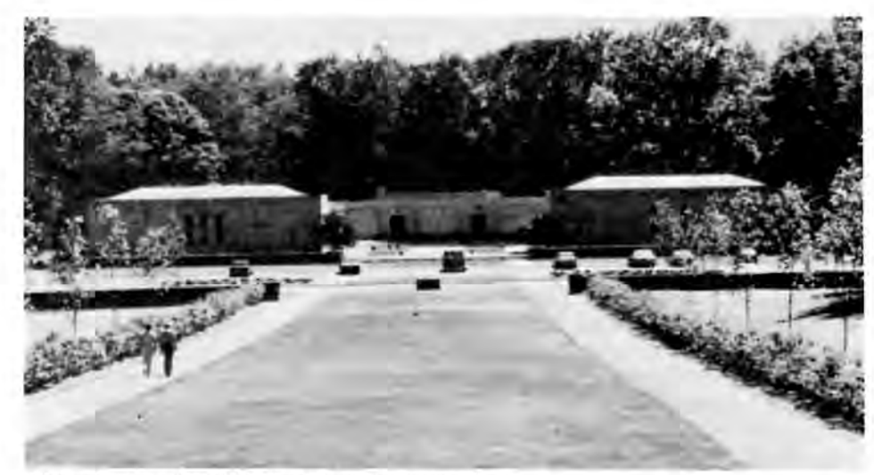
Allee as it appeared in 1988 in the early stages of restoration.

volved cultural landscape issues and both contained interpretive elements that contributed significantly to positive outcomes.