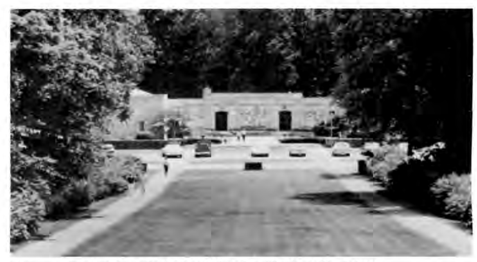
Overgrown allee at Lincoln Boyhood National Memorial, 1978. Lincoln City, Indiana.

I will describe preservation projects at two parks, Lincoln Boyhood National Memorial and Vanderbilt Mansion National Monument, to illustrate this point. Both projects in-