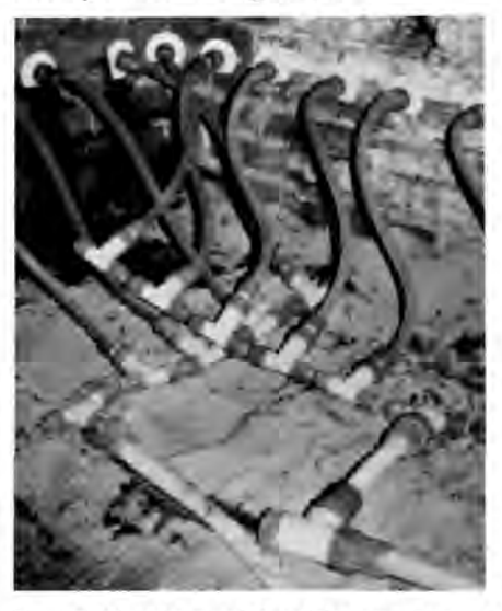
Photo 8. After the rotted floor joists were removed and the crawl space cleared of debris, holes were drilled about 5" apart and chemical resins (a siliconate compound with aluminum stearate in an alcohol base) were injected into the brick walls. The chemicals flood the porous mortar and bricks and upon curing form a moisture proof damp-course layer. To date, this chemical layer appears to be effective.

The chemicals were injected under pressure using a small gas engine and compressor. Multiple ports could be saturated at one time (see photo 8). It took much of a day and through the night for a crew of three to fully treat the building perimeter with approximately 200 gallons of fluid. The work was done in January 1986, and although the weather was dry and 40° F during the day, there were electric heaters on the site in the event that they would be needed in colder weather. After 14 days of curing, the port holes were filled with a preapproved cement mortar and the floor joists were replaced.