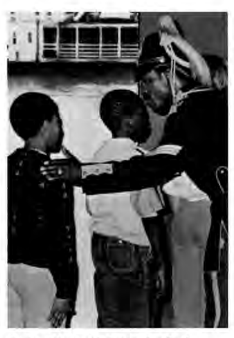
Soldier of Co. A, 10th Cavalry, Fort Concho Museum, San Angelo, Texas, teaching students the rudiments of 19th century military drill at the Jefferson National Expansion Memorial in St. Louis, Mo.