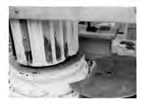
Photo 3. Physical dampcourses which provide an impervious layer isolating ground moisture from historic materials are often very effective. In this case, two lead sheets are being slipped between a stone plinth and the wooden column base to stop rising damp. The dark stains at the base of the raised column show the moisture damage from rising damp. The lead sheets were cut to surround the iron peg that stuck out of the top-center of the plinth. Careful placement of the two sheets will ensure complete coverage of the plinth surface.

was taken in the installation of these damp course layers to avoid the visual disfigurement that can result from drilling into historic materials.