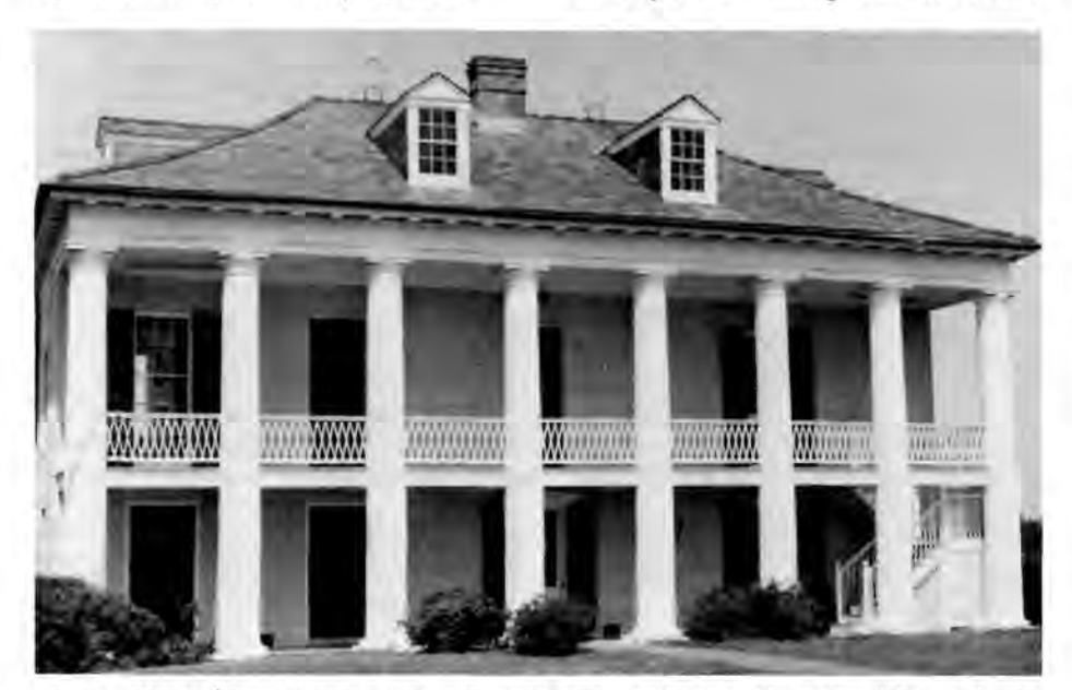
Photo 4. The René Beauregard House, ca. 1830, suffered from rising damp due to the high ground water adjacent to the Mississippi River. In 1979, a dampcourse layer of cement grout was installed at the base of the building. Stucco repair to the exterior cosmetically covered the visually disfiguring drilled holes.

After consulting with the NPS Southwest Regional Office (SWRO), a plan was devised to halt the rising damp, and work was undertaken. The 16" thick bearing walls were dampcoursed using a technique of overlapping drilled holes filled with waterproof cement. This technique, often referred to as the Massari system, was described by Mr. Giovanni Massari in the 1967 report on the Conference on the Problems of