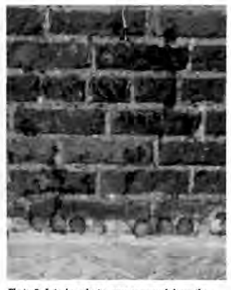
Photo 5. Interior plaster was removed from the lower 3½' of the first floor interior to help the walls of the René Beauregard House dry out. Note the continuous layer of cement grout that has been installed in overlapping ½' holes that were drilled through the 16" thick walls. The large masonry columns were also dampcoursed to stop moisture from deteriorating the replaced cyprus porch beams above.

Moisture in Historic Monuments sponsored by the International Council of Monuments and Sites (ICOMOS) and held in Rome, Italy. Using the Massari concept of interlocking cores, 11/4" diameter holes 10" apart were drilled just above the brick pavement level at the Beauregard House. Using high powered drills with carbide bits, the holes were drilled around the perimeter of the building and then filled with a commercially available waterproof cement product. After each hole was filled and tamped, another series of holes, 10" apart, was drilled 2" from the first hole. The alternate drilling of holes was to ensure that the structure was not undermined. Eventually the entire perimeter with interlocking holes filled with waterproof cement was completed (see photo 5). The columns were similarly dampcoursed.