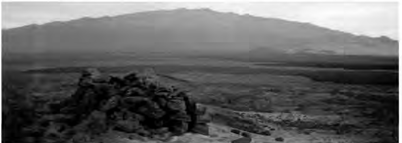
View of shrine with the Pohakuloa flats and Mauna Kea in the background.

Another management concern is site protection. To protect historic properties we must identify and monitor forces that impact sites. Thus, we are developing a Geographic Information System (GIS) database to store site information. In addition, we are performing regular field checks to monitor historic properties and educate the military and public regarding the sensitivity and care of these sites.