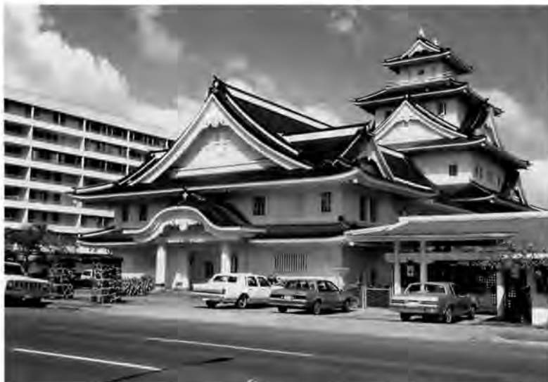
The Himeji Castle-influenced Makiki Christian Church (1931), Honolulu, Hawai'i.

economic and political spheres, could have easily entered the sphere of social relations.