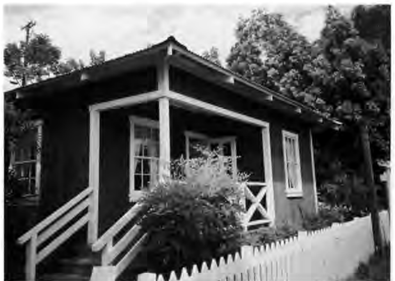
Plan XI, Hawai'i Sugar Planters' Association, 1919. This example was reconstructed at Waipahu Cultural Garden Park on O'ahu.