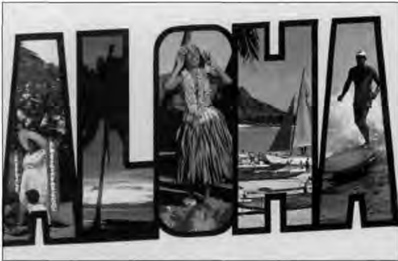
A postcard incorporates 1950s images typically used to promote Hawai'i.

ments involved in preserving and interpreting life on coffee farms during the early part of the 20th century.