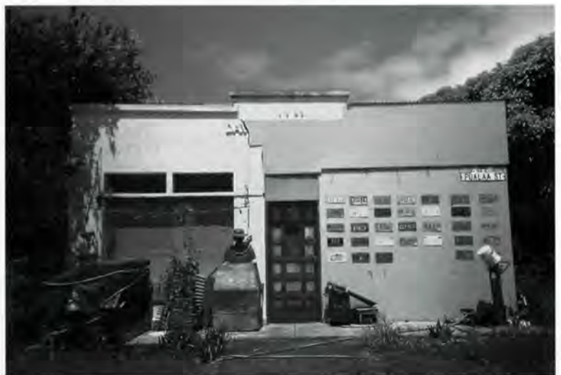
Kalaupapa, Moloka'i. Patient's cottage and former store.

The 1997 survey built on the 1976 survey. Students used the previous inventory to locate and catalogue the buildings in Kalaupapa today. With information not available at the time of the previous survey, students were able to clarify some of the questions concerning certain buildings such as date of construction and original use. In addition, four structures were chosen for measured drawings: the pool hall; Plumeria House, an early resi-