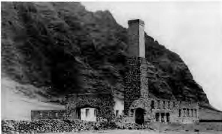
1860s mill at Kualoa, O'ahu. Wilder Sugar operation ran from circa 1864-1870. Photo circa 1920. The stone walls have further deteriorated.