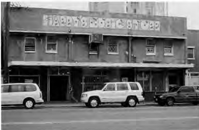
Typical Art Moderne (streamlined modern) commercial building in Honolulu.