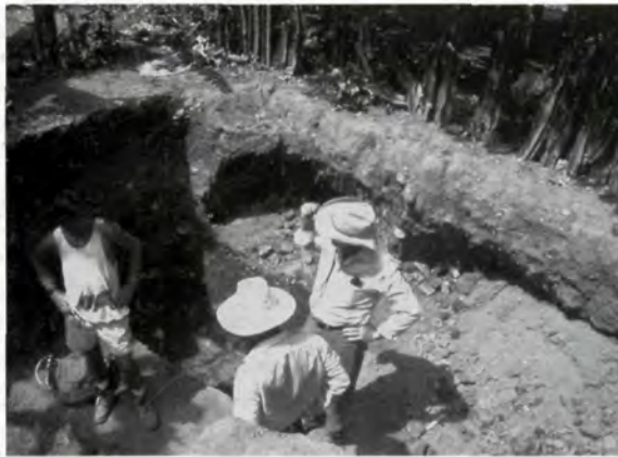
UH faculty and students on site at Angkor Borei.