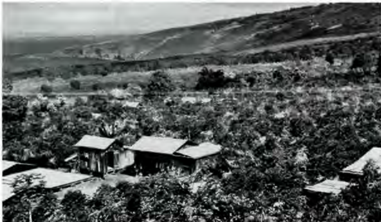
Kona Coffee Farm c. 1930 overlooking Kealakekua Bay.

When British explorer Captain James Cook landed at Kealakekua Bay in 1779, he and his crew found a productive agricultural region, a land "in high cultivation" at elevations between 1,000 and 2,000 feet. Dense with breadfruit, sugar cane, sweet potato, taro, and banana, this area supported a population of at least 10,000 people at the time of contact.