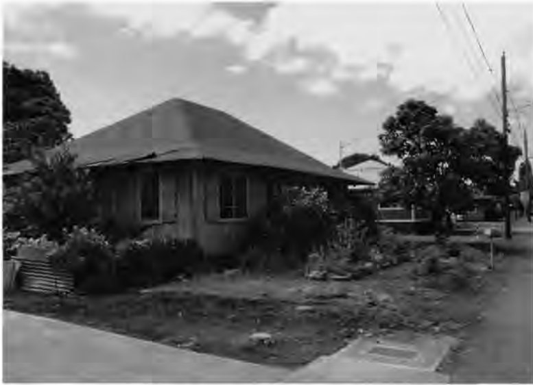
Typical c. 1937 workers' houses, 'Ewa Plantation before (above) and after rehabilitation (right).

ties. A neighborhood commercial area and a district park are planned for the old mill area and are expected to incorporate some of the remaining mill structures. The Manager's House is slated to become a community interpretive center. The three supervisors' houses will be used for special needs housing. A Bachelors' Quarters for skilled employees will be renovated into rental housing for current residents.