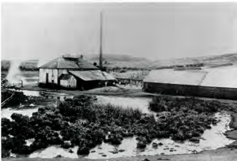
The Lā`ie Plantation sugar mill, constructed by the Mormons.

The temple drew faithful Mormon converts from all over the Pacific, many of whom resettled in Lā`ie. It also attracted tourists intrigued by reports of the unusual edifice on O`ahu's remote north shore. Tourist guidebooks of the period include the temple as the main attraction in coastal tours, comparing the visual effect of its striking white outline to that of the Taj Mahal. 11