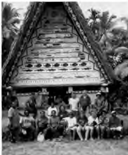
Group photograph at Bai-ra-irrai, the traditional Palauan bai or men's meeting house on Airai Island in 1996.

The Freely Associated States of Micronesia (FAS) is comprised of the Republic of Palau, Republic of the Marshall Islands, and the Federated States of Micronesia, including Chuuk, Pohnpei, Kosrae and Yap. The U.S. Historic Preservation Fund has been extended to these sovereign governments until the year 2001, with the exception of the Republic of Palau who signed their Compact of Free Association in 1995 (the U.S. government agreed to provide funding for 15 years under the compacts). Palau may receive HPF grant funds until 2010. In 1986 when the Compacts of Free Association were signed, the United Nations trusteeship for these island groups ended. The National Park Service (NPS)