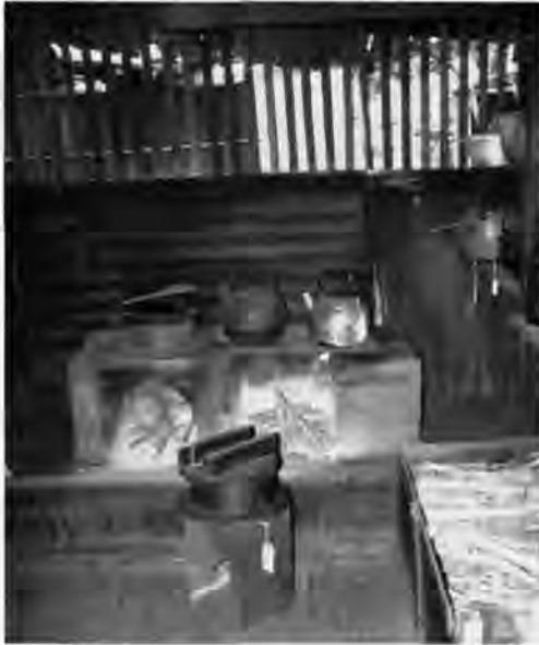
Uchida Coffee Farm kitchen with a traditional Japanese open hearth. The woodbox is at right.

The multi-ethnic and multi-cultural community that shaped what we now refer to as Kona's "coffee lifestyle" is still very much alive in the district. Second generation Japanese Americans ( Nisei ) born on coffee farms continue to farm the lands cleared and planted by their parents as do Filipinos, Hawaiians, and Portuguese. After decades of hardship and struggle by these early pioneers, Kona coffee now ranks itself