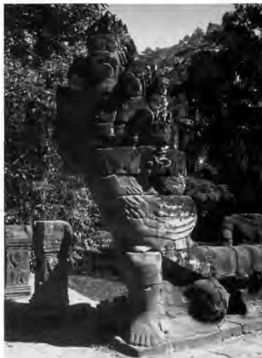
A naga guards the entrance to the Preah Kahn temple complex in Angkor.