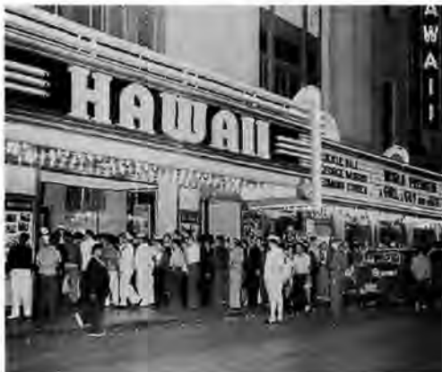
Hawai'i Theatre, March, 1941.

Honolulu's 1922 Hawai'i Theatre, recently re-opened after a 12-year, $31 million renovation, continues to generate controversy over the fate of its marquee. The neo-classical Beaux Arts theatre, listed on both the State and National Registers, originally featured a very simple exterior canopy. After several modifications, it was entirely replaced in the mid-1930s by an elaborate art deco marquee featuring the largest neon display in the islands. Inside, the lobbies likewise were done over in a "tropical deco" style, with Hawaiian floral and foliage designs, Polynesian geometric patterns, and various Asian elements, all crafted by local artisans.