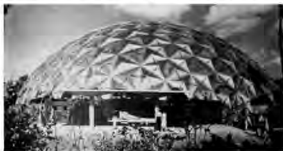
View of the R. Buckminster Fuller-designed Hilton Dome Auditorium, Waikīkī. Used with permission of R. Buckminster Fuller, Carbondale, IL., and supplied by Leco Photo Service, New York, NY.

The Hilton Dome Auditorium in Waikīkī, a geodesic dome designed by R. Buckminster Fuller, who pioneered the exploration of lightweight architectural design and materials, passed its life expectancy of 40 years in January of 1998. Erected in 22 hours building time in 1957, the 145-foot diameter aluminum dome remains a direct link between today