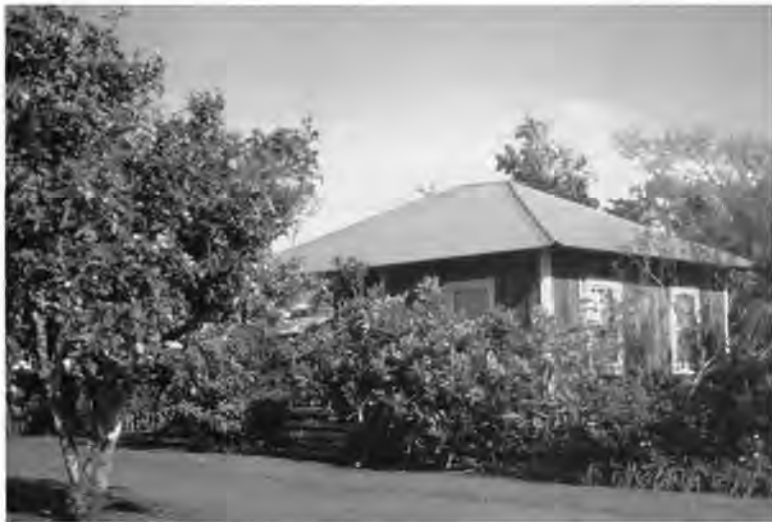
Worker's Cottage at Grove Farm Museum.

also included construction of replica buildings and preservation of existing taro fields. The decision to replicate buildings rather than move original threatened properties to the site was a carefully considered choice. The Design and Development Committee members felt that to wrest historic properties from their original context would not be a good preservation alternative and would set a bad precedent.