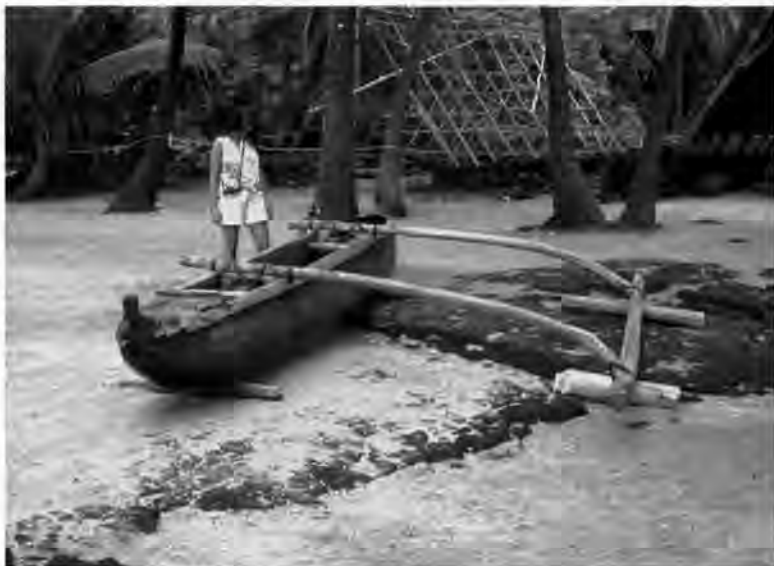
Pu'uhonua o Hōnaunau NHP

Composed of pre- and post-contact lava flows from Hualalai Volcano, the landscape at Kaloko-Honokōhau NHP looks harsh and incapable of supporting life. But there is plant and animal life here, and this land and its physical spirituality supported human life for a thousand years. The