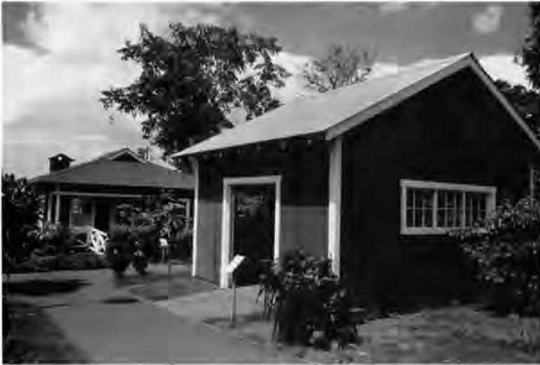
Barbershop and Okinawan House at Hawai'i's Plantation Village.

immigrant workers still remains in many clusters of plantation camps. However, hundreds of such structures are now under threat, as agribusinesses increasingly divest themselves of their holdings and company housing is privatized. Efforts to preserve what remains are becoming increasingly critical.