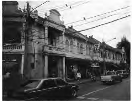
Historic shophouses in Bangkok, Thailand. Subject for the 1997 and 1998 University of Hawai'i Asian Preservation Field Schools.