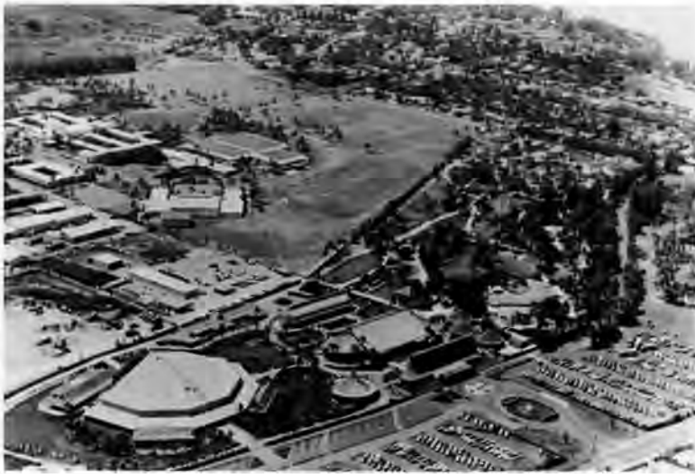
Lā'ie in the 1970s, with the PCC in the foreground, and BYU-Hawai'i just behind. The temple grounds, not shown, are just beyond the BYU-Hawai'i campus.