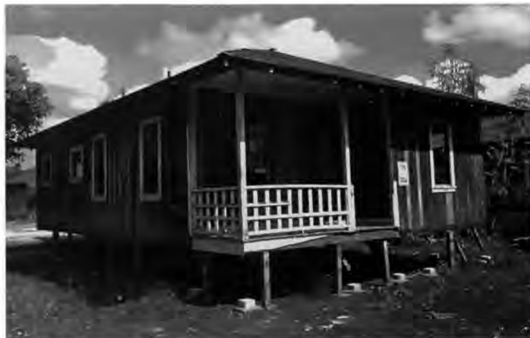
Deteriorating building at Ewa plantation site.