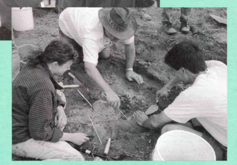
Archeological field excavation.