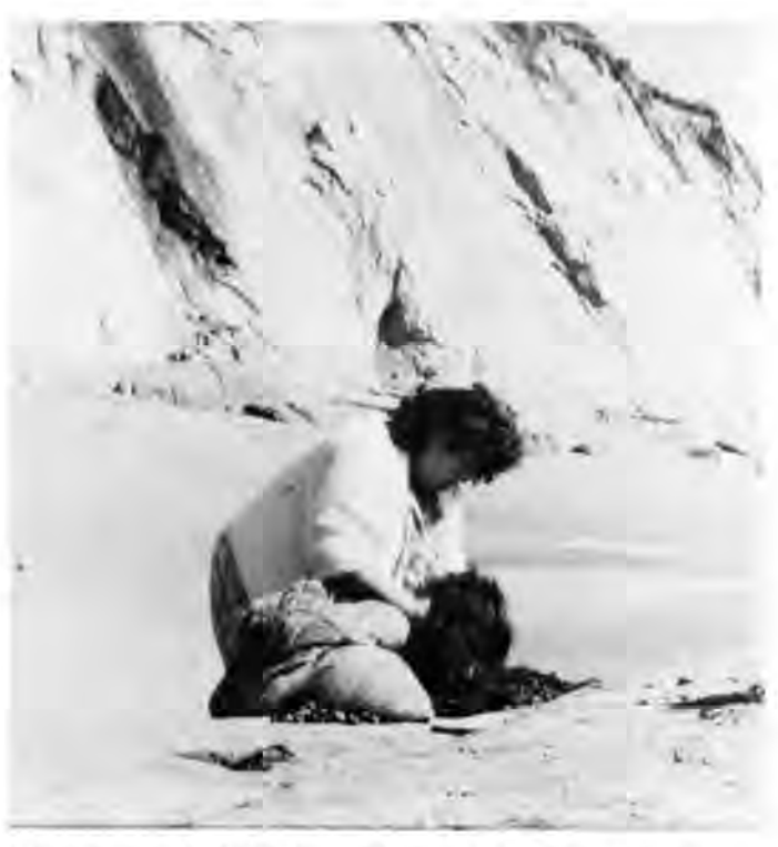
Hoopa woman collecting kelp seaweed, a traditional food resource, on Federal land. In some areas of the northwest, collection of aquatic resources is regulated by Federal and state agencies who must balance the need of Native Americans to gather and use these resources—some of which may be endangered species.

consistent with multiple use mandates of Federal resource-administering agencies, and can be accomplished in a manner which maintains the "neutrality" of the government with respect to particular religious interests (Suagee 1982). Although the term "mitigation" is still frequently used to describe agency options in this context, it takes on a new meaning in response to Native American cultural values. In many cases "mitigation" involves "accommodation" of subsistence activities, collection of crafts material, or religious and ritual practice: a very different concept than that applied to material cultural resources (archeological sites, historic structures, etc.).