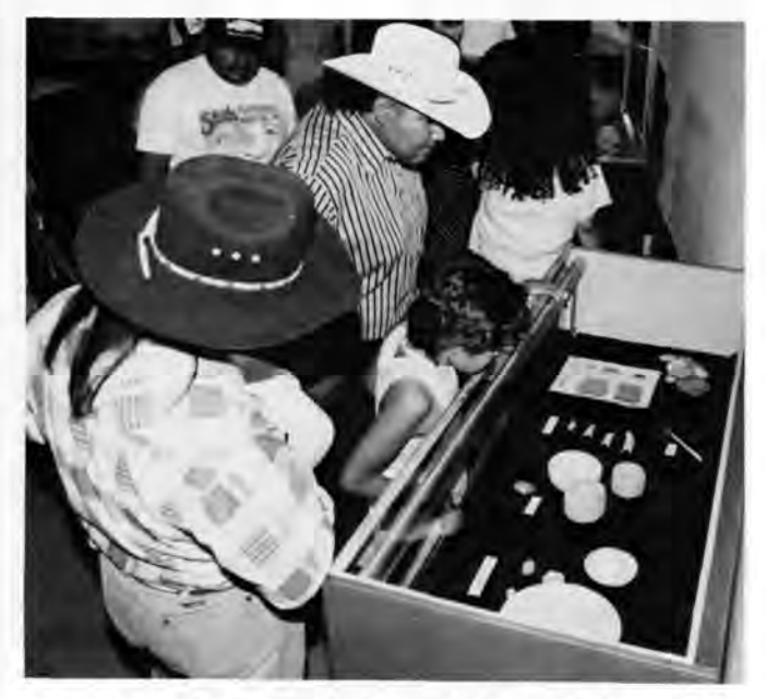
Community members and guests view an exhibition of artifacts excavated from an archeological site on the Ak-Chin Indian Community reservation.

The first part was designed to promote an awareness of the multiple roles and functions a museum could have in tribal life, and to build cooperation and consensus for the museum throughout the community. The plan called for tribal leaders, elders, project staff and advisors to visit museums and archives in the United States and Canada to see existing models firsthand, and to get a sense of the problems and