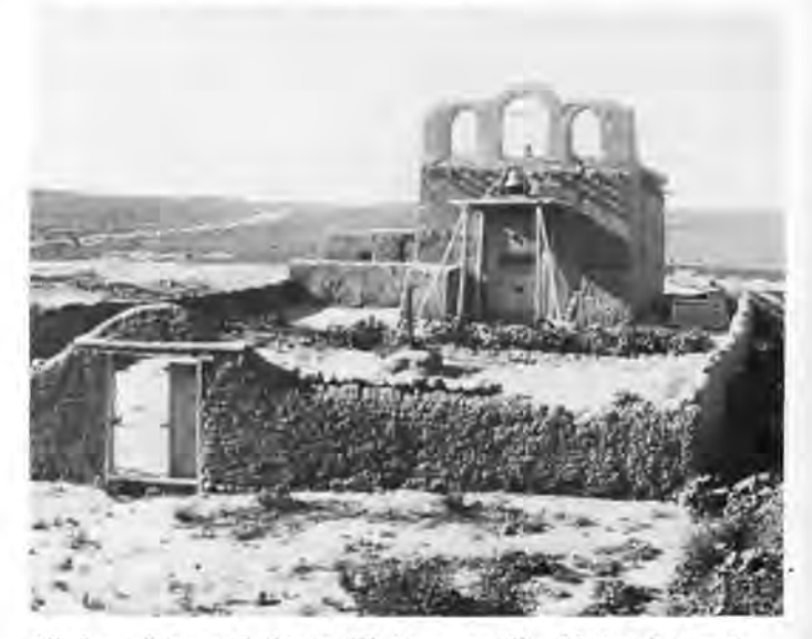
Mission at Pojoaque Pueblo in 1899. Museum of New Mexico photograph by Adam C. Vromon, Neg. No. 13897.

Between 1912 and 1932, the Pueblo was not an organized community. Although the majority of the people remained in the area, Indian land was being used for open grazing by non-Indian ranchers. In 1933, the land of Pojoaque was returned to its people. Under the Indian Reorganization Act, 14 members of the Tapia, Viarrial, Romero and Montoya-Gutierrez families were awarded lands that had been in the hands of Mexican families. In 1946, the Pueblo became a federally recognized Indian reservation of 11,603 acres. With great determination and pride, the people of Pojoaque regained their tribal arts, and, in the early 1970s, danced in a public ceremony for the first time in more than a century.