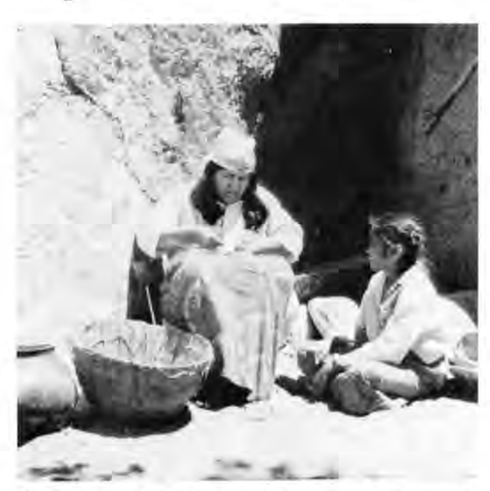
The continuation of cultural traditions often depends on access to resources on lands administered by public agencies. Cahuilla basketmaker, San Jacinto, California.

Ethnographic data collected during the initial stages of planning inventory may be summarized and used to identify management issues and Native American community concerns regarding potential conflicts. Tribal government officials and traditional cultural leaders should be identified in initial planning review and consulted in subsequent agency actions that could affect sensitive cultural values or tribal lands. The planning process also provides opportunities for developing programs to protect and enhance Native American concerns as one component of Federal land management mandates.