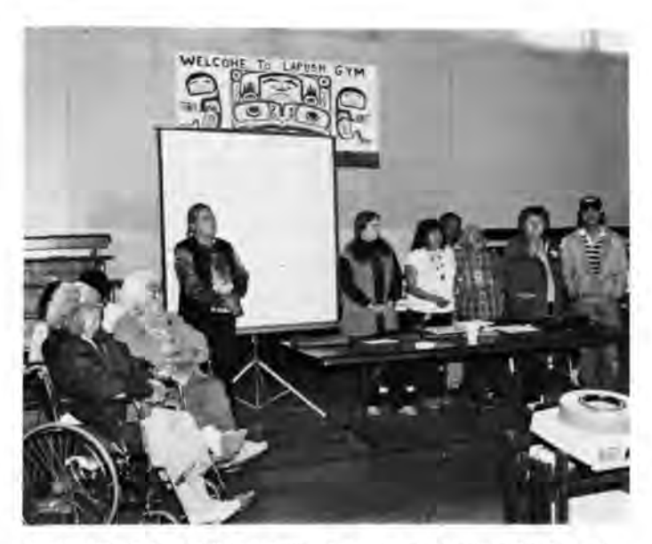
In May 1986, Federal Cylinder Project staff made a site visit to the Quileute Reservation in western Washington State.

What we have found is that those who are willing to listen repeatedly through whatever noise level may be present are often able to make use of the materials. Many anticipate that the recordings will help them reclaim something that has been lost. Occasionally this is the case. More often those who are knowledgeable in the traditions of their communities find it possible to sing along with the recordings, and thus receive verification that, despite all the acculturation pressures over the years, the traditions, the songs, have survived. And this is a source of considerable pride. Though some are hesitant about having their ancestors' recordings made public, relatives and descendants of singers are usually pleased and excited