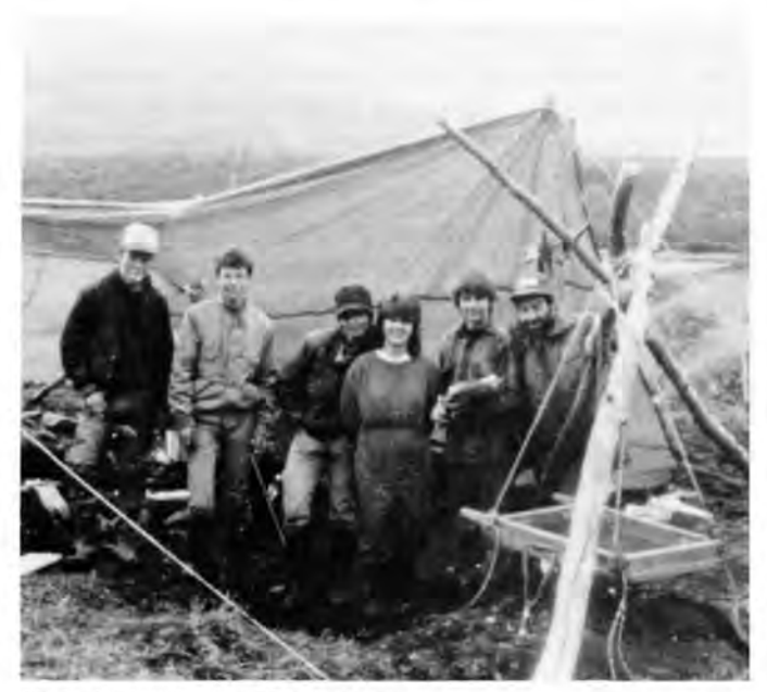
Field school students and BIA instructor

One of the more successful joint BIA-Native programs involved an archeological field school with students from the Kodiak Area Native Association (KANA). Five youths, ages 15-18, camped at the isolated site on Kodiak for approximately two months. More than 50% of a multi-component, 1,300-year-old dwelling structure was excavated. The students not only learned archeological methods and techniques, but also absorbed field camp operations and participated in evening discussions regarding daily activities. Despite bear problems and some of the worst weather on record, all students stayed to the end, and successfully completed the university accredited course.