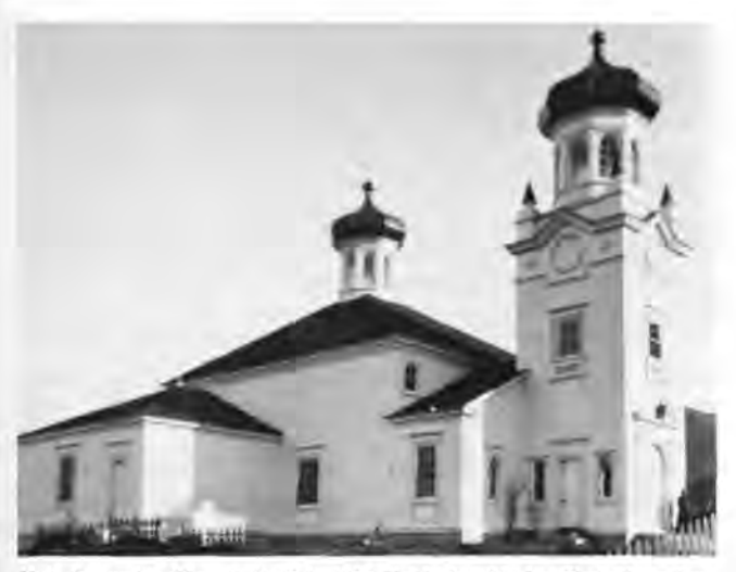
Holy Ascension Church, built in 1895, Unalaska, Alaska.

In 1990, the Alaska Regional Office and the Unalaska Aleut Development Corporation entered into a cooperative agreement to conduct a cultural resource inventory of the town center. The following year, the Unalaska Historical Commission and many others in the community worked with Service staff to produce the Unalaska Preservation Plan . Hopefully, the plan will serve as a tool to help preserve the integrity of not only the National Historic Landmarks, but cultural resources of state and local significance as well.