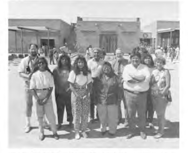
Ak-Chin Him Dak staff, with some of the project advisors, pose before the completed ecomuseum on opening day.

The Ak-Chin Indian Community consists of 550 people who are descendants of Akimel O'odham (Pima) and Tohono O'odham (Papago) Indians. They live on a 21,800 acre farm located approximately 30 miles south of Phoenix, Arizona at the northern edge of the Sonoran Desert. The reservation was created by Executive Order in 1912. A community council, which operates under Articles of Association adopted in 1961,