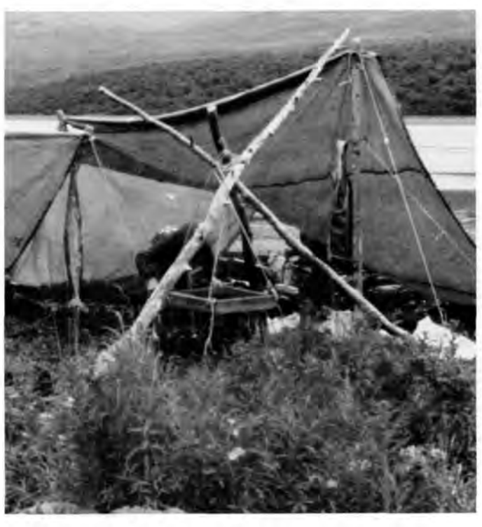
Covered site during excavation