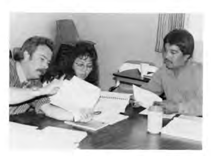
Participants divide into groups that "role-play" the review of a project's impact on historic properties. In Window Rock the hypothetical properties included a place where sand is gathered for sand paintings, several ancient living sites, and the ceremonial site of another tribe.

"The actual hands-on experience of developing a determination of no adverse effect and a Memorandum of Agreement was very beneficial."