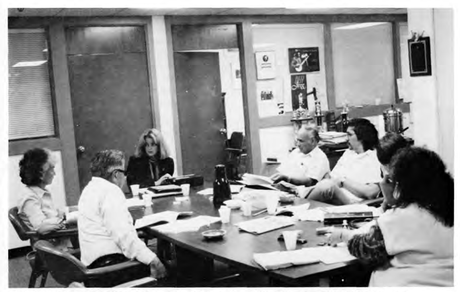
Federal Cylinder Project staff meet with the Sitka Community Association Tribal Council, Sitka, Alaska, in August 1986.

The early recordings can thus provide the stimulus for a short-term individual project or become part of a much larger ongoing tribal program. They have also been used as a focal point for applications to agencies that fund cultural retention or archival projects and thus may contribute to the process of building projects into programs.