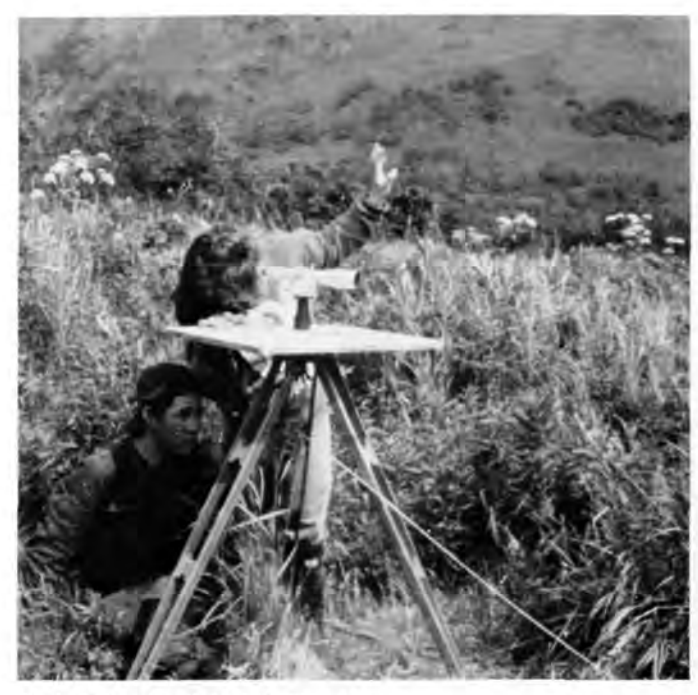
Students learning plane table mapping

artifacts collected by the BIA. Yet, in every case to date, the owner has chosen to allow the Bureau to curate the objects, house them under a long term loan agreement and to ultimately donate them to a local museum when such a facility is available. This little known fact shows the trust that is growing steadily between Natives and cultural resource personnel in the government.