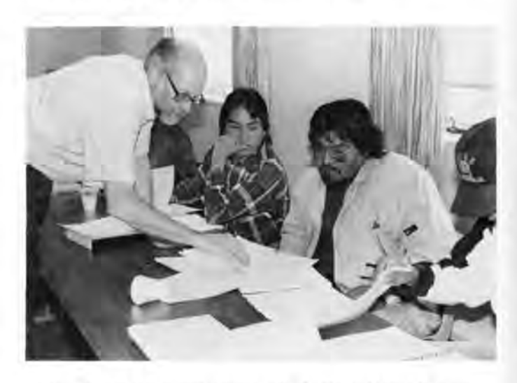
Advisory Council training, like this class for the Navajo Nation, features a seminar atmosphere stressing intensive interaction between trainees and the instuctor. Participants receive and use course books containing a wide range of relevant laws, regulations, and guidelines.

"Preparing Agreement Documents under Section 106 of NHPA," with the University of Nevada, Reno. Fourteen introductory courses and five advanced courses will be offered at locations around the country in 1992. Those who want information about open enrollment or special courses can write or call the Council's Training Coordinator, Advisory Council on Historic Preservation, 1100 Pennsylvania Avenue, NW, Room 803, Washington, DC 20004; 202-786-0505.