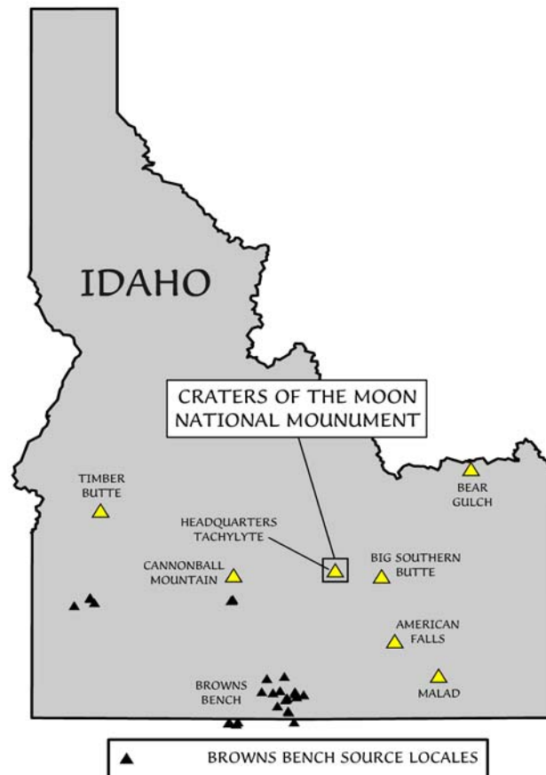
Figure 1. Locations of the sites and the sources of the obsidian artifacts.