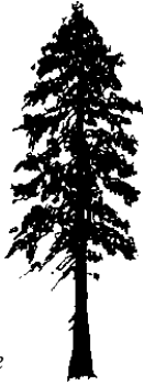
Shasta red fir profile

Firs (genus Abies ) are represented by five separate species at Crater Lake, although one species, the Pacific silver fir ( A. amabilis ), has only one known specimen inside park boundaries. Members of the pine family (Pinaceae), firs have stemless needles that leave small circular indentations when pulled from the branch. Whole fir cones are rarely found around the tree because they fall apart after maturing.