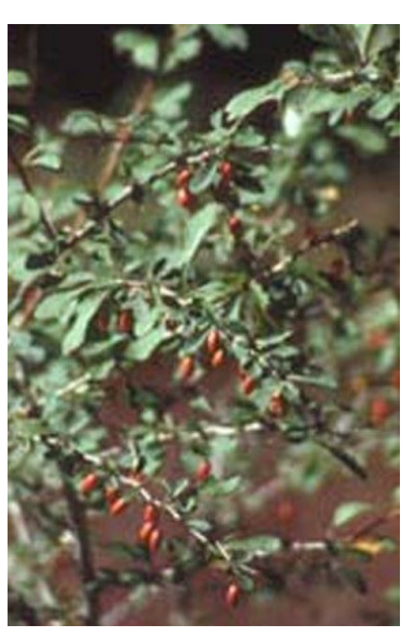
Japanese Barberry Berberis thunbergii

Japanese stiltgrass is an annual grass with slender stalks that produce tiny flowers in late summer. Japanese stiltgrass may impact other plants by changing soil chemistry and shading other plants.