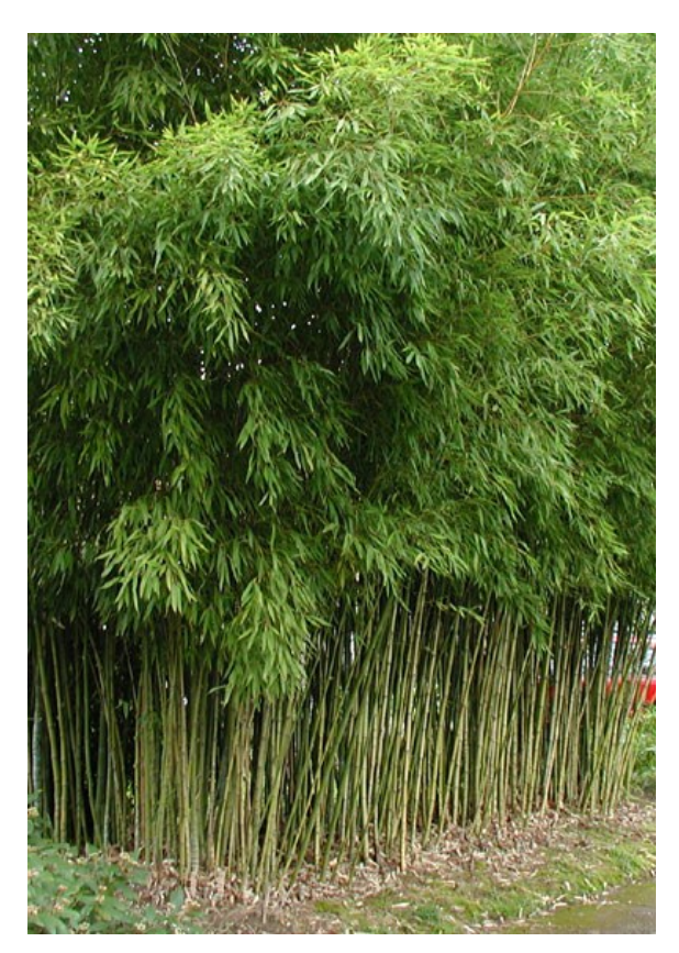
Golden Bamboo Phyllostachys aurea

Privet has opposite leaves, white flowers, and berries that range from green to black. It can grow up to 30 ft. in height and forms dense thickets.