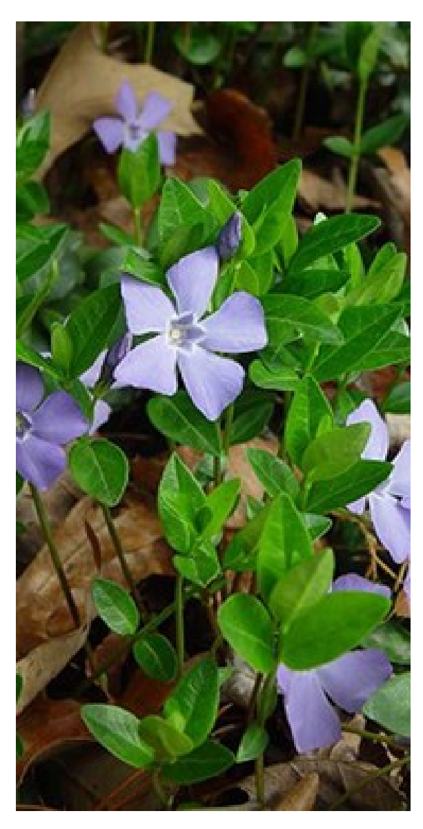
Common Periwinkle Vinca minor

Multiflora rose was originally used as a living fence for livestock. It is identified by its compound leaves, white flowers, and red rose hips in the fall.