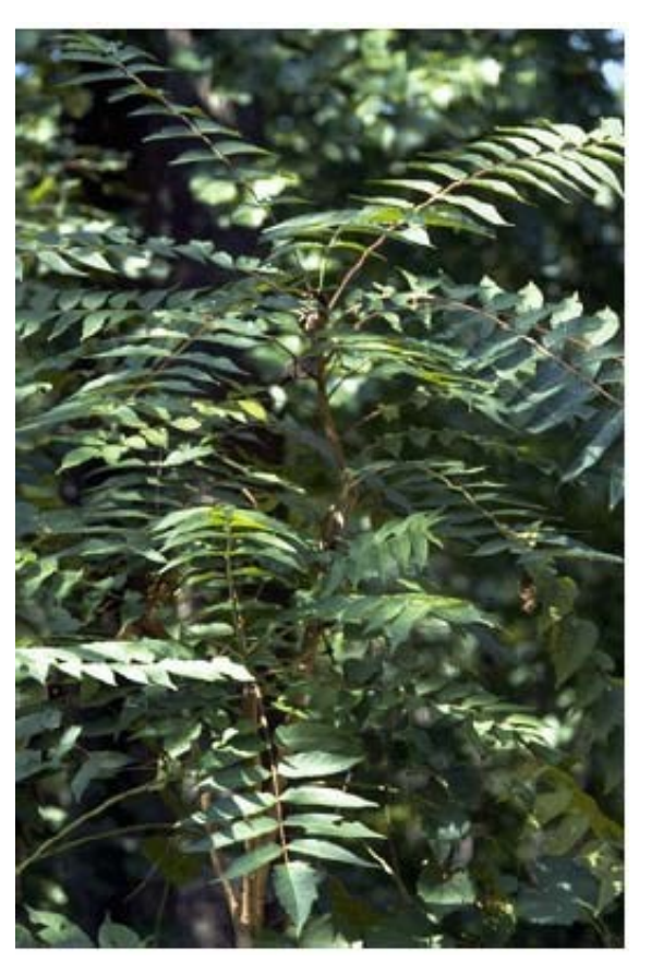
Tree of Heaven Ailanthus altissima

Golden bamboo has alternate, grass-like leaves and can reach heights of 24 to 30 ft. It shades out native plants and destroys wildlife habitat.