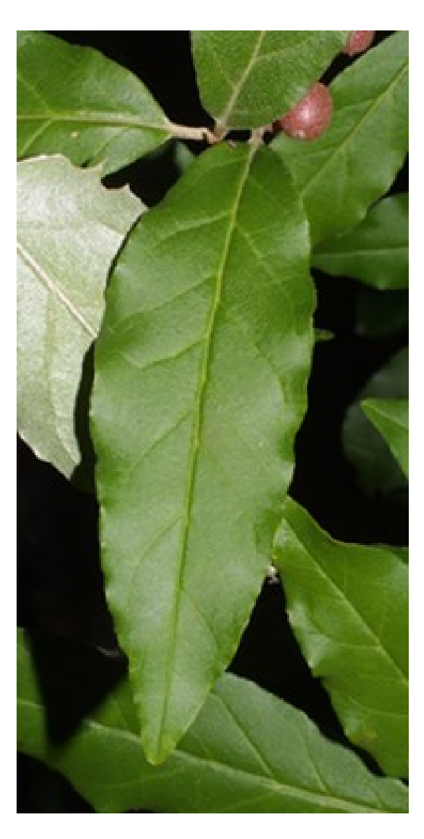
Autumn Olive Elaeagnus umbellata

Autumn olive is recognizable by its bright green leaves with silver undersides and red berries in the fall. It can grow to a height of 20 feet and forms dense stands.