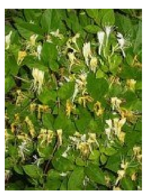
Japanese Honeysuckle Lonicera japonica

Some of the most aggressive, and notable invasive species in the park include Phyllostachys aurea (Golden bamboo), Elaeagnus umbellata (Autumn olive), Lonicera japonica (Japanese honeysuckle), Rosa multiflora (Multiflora rose), Ligustrum spp. (Privet), and Microstegium vimineum (Japanese stiltgrass).