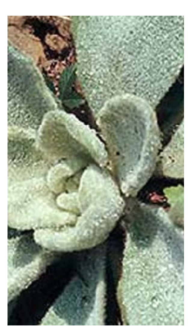
Mullein Verbascum sp.

Mullein is native to Europe and Asia. It forms a rosette of leaves at ground level and eventually a tall flowering stem. The leaves are often hairy, giving the plant its alternate name, velvet plant.