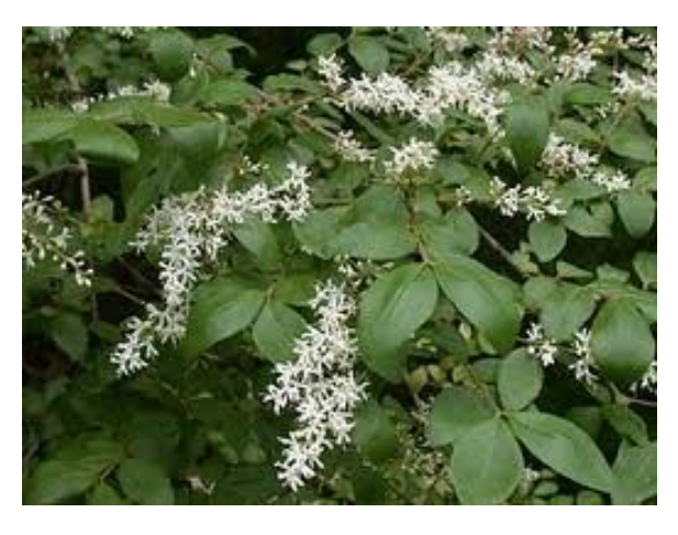
Chinese Privet Ligustrum sinense

Privet has opposite leaves, white flowers, and berries that range from green to black. It can grow up to 30 ft. in height and forms dense thickets.