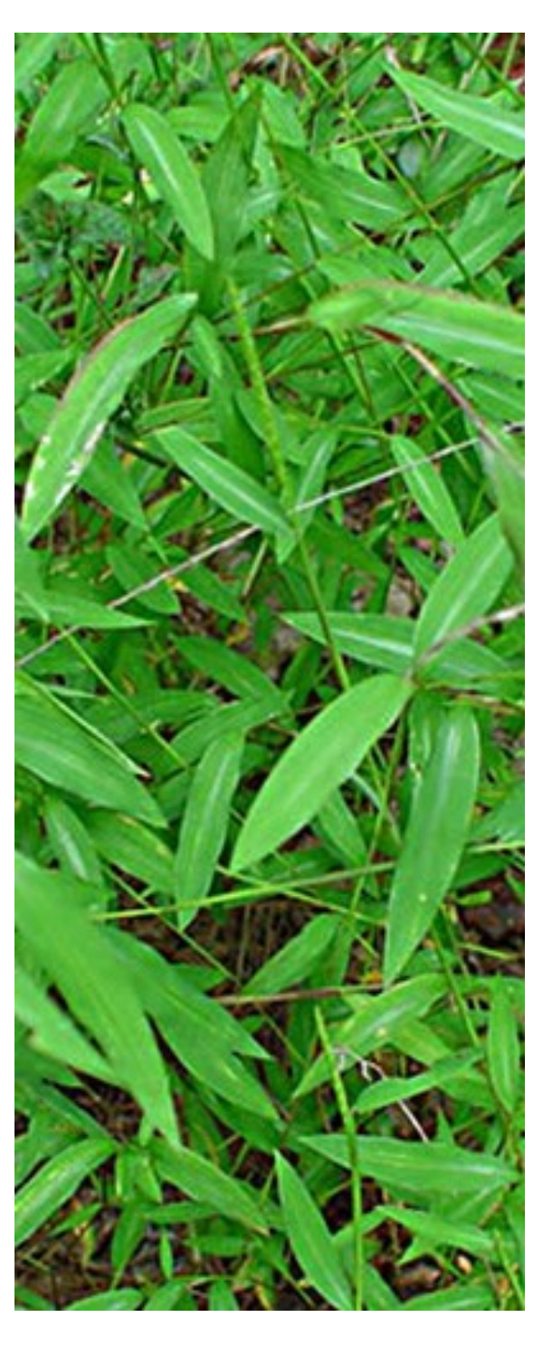
Japanese Stiltgrass Microstegium vimineum

Japanese stiltgrass is an annual grass with slender stalks that produce tiny flowers in late summer. Japanese stiltgrass may impact other plants by changing soil chemistry and shading other plants.