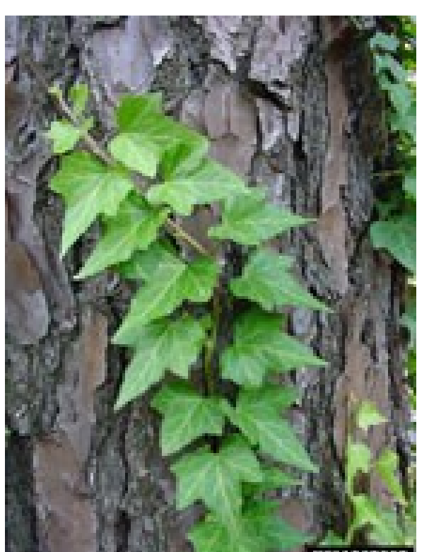
English Ivy Hedera helix

Japanese honeysuckle is one of the most commonly occurring invasive plants in the south. It is identified by its woody vine, opposite leaves, and fragrant flowers.