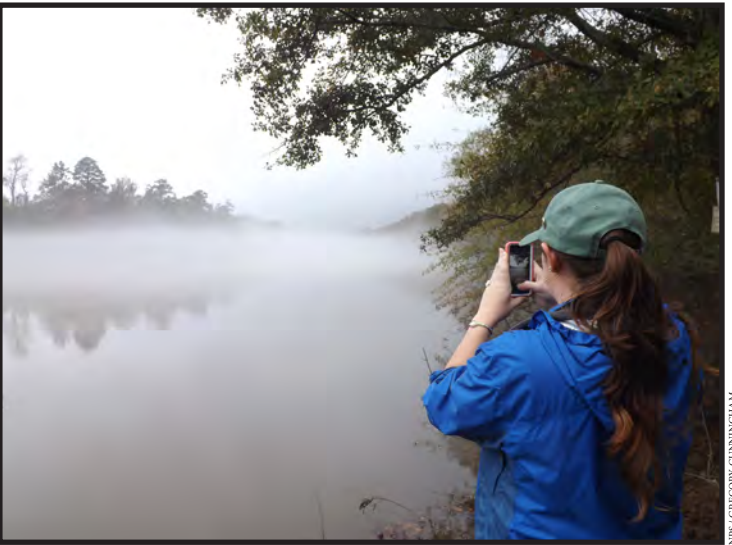
View of the Congaree River from Bates Ferry Trail.

Firefly Trail (#10) - 1.8 Miles EASY Visitors are treated to a magical light show produced by synchronous fireflies along this trail in the late spring.