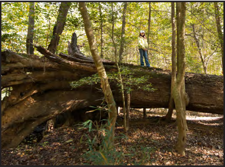
A large fallen tree along Oakridge Trail.

Even in ideal conditions, some trails can be challenging for those unprepared for a wilderness experience. Most park trails are subject to periodic flooding and may become impassible. Storms can also bring down trees and drop debris on trails. If you encounter such conditions, consider turning around or adjusting your plans. The rating descriptions below can help you find the best trails to fit your desired experience.