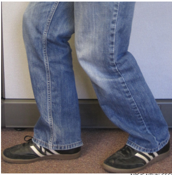
Opposable thumbs, binocular vision, and bipedal movement and three physical adaptations of humans.