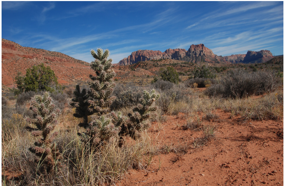
Plants and animals that live in the desert have adaptations to survive the dry conditions

When groups have finished designing their animal, have them choose a speaker to present the drawing and answers to the above questions. Do the creatures have all the elements they need to survive in their specific habitat? If not, what's missing?