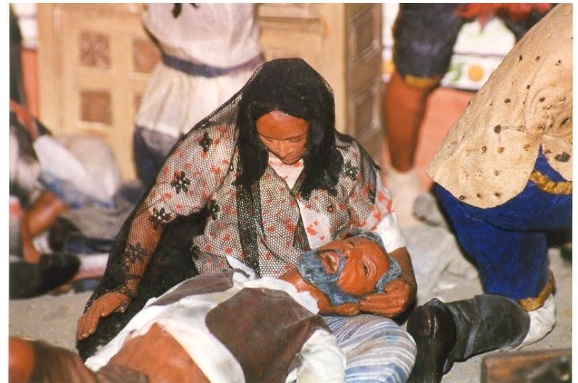
Diorama of Rebellion, Tumacácori NHP Museum