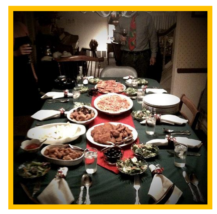
The Feast of the Seven Fishes