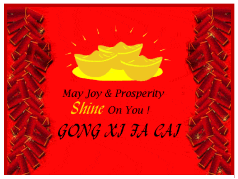
Happy New Year "Lucky Money" Envelope