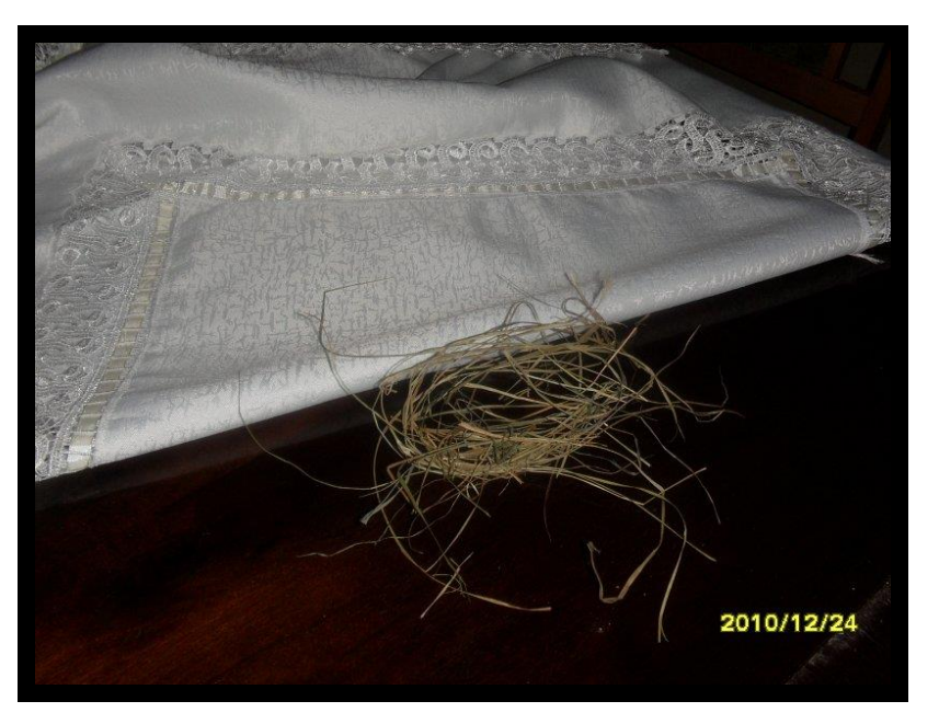
Christmas Hay "Sianko" Beneath a Tablecloth