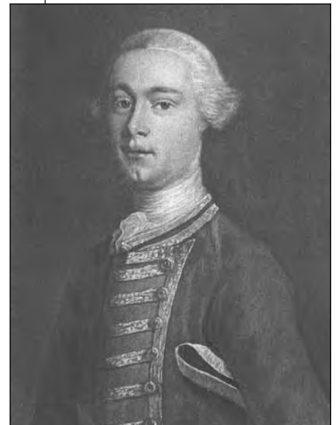
General James Wolfe