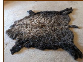
Buffalo robe $3