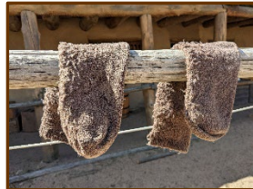
Wool socks $5