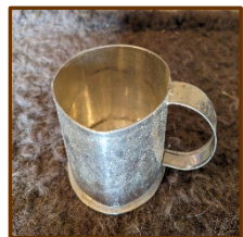
Tin cup $2