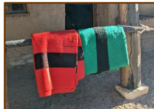
Wool blanket $9