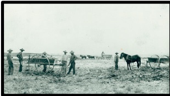
Chinese workers at Harmony Borax Works