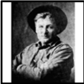
Death Valley Scotty

I am Walter Scott, or Death Valley Scotty. I am a true prospector....ok, no I am an entertainer and an amazing storyteller. I was born in Kentucky but soon found odd jobs that took me all the way to Death Valley. I worked at Harmony Borax Works and with the Buffalo Bill Wild West Show. Then, I convinced everyone I had a gold mine. Mr. Albert Johnson was my best investor. He soon learned that I didn't have a gold mine. However, we became good friends and he built a castle in Grapevine Canyon where I entertained all my new friends.