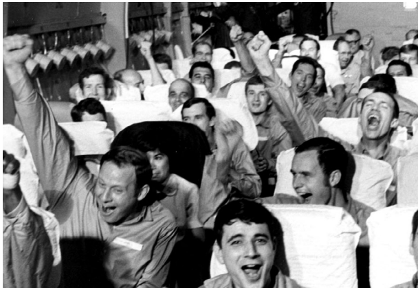
Released prisoners from Vietnam celebrate on their flight home in 1973.