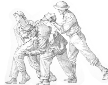
Prisoners of war

4. A group of Marines are surrounded and are forced to surrender.