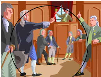
to call people together