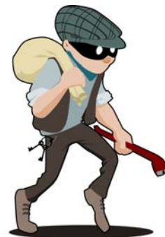
It was stolen.