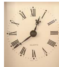
to tell the time