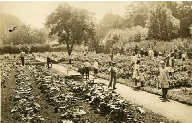
Colt Park early 1900's