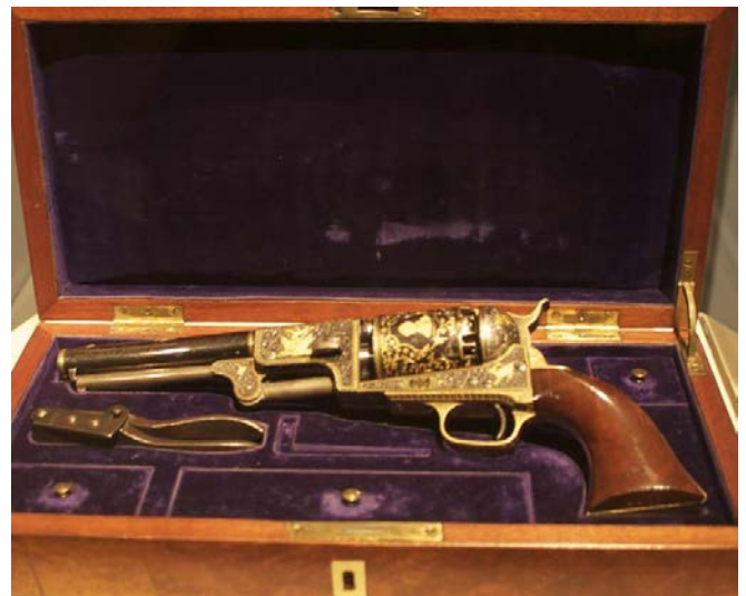
Gold Inlaid revolver presented to Sultan

Colt traveled the world to present heads of state with lavishly engraved, gilded pistols. He bestowed complementary arms on world leaders from Czar Nicholas of Russia to the king of Siam, to King Victor Emmanuel II of Italy, to Hungarian freedom fighter Lajos Kossu. After Colt presented an Ottoman sultan a custom-engraved and gold-inlaid revolver, the Turks ordered 5,000 of his pistols. Colt even coined the expression “new and improved.” By the start of the U.S. Civil War in 1861, Colonel Colt’s revolvers were perhaps the best-known firearm in the world