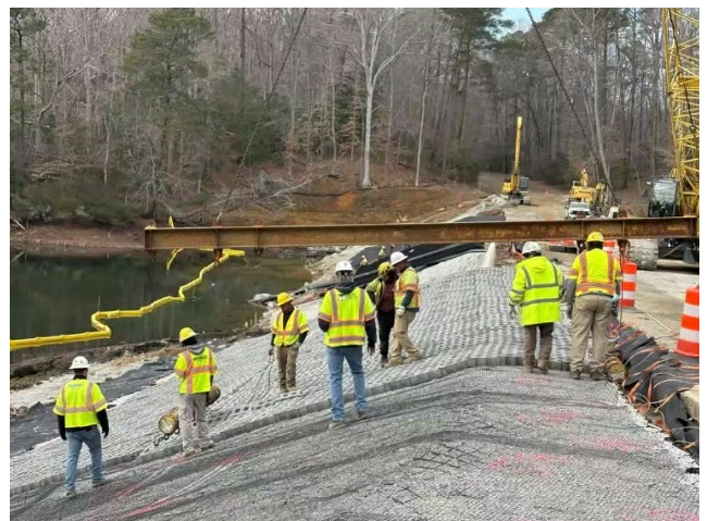
Contractors applying articulated concrete block matting.

The contractor is making significant progress, including: