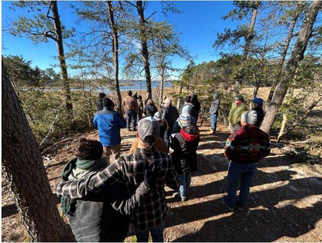
Tribal members take in the views along Leigh Creek during the NHL visit.

In January, tribal representatives and NPS staff met at Werowocomoco to tour the site and gather inspiration for developing ideas related to the criteria for the National Historic Landmark (NHL) application.