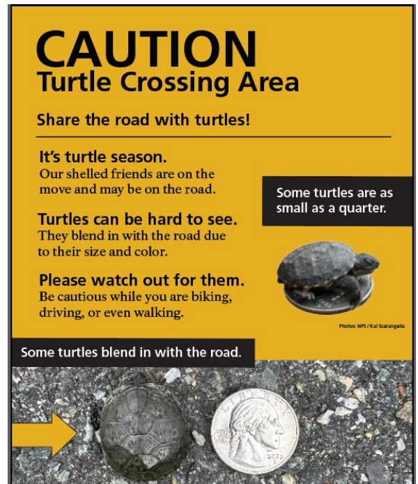
New signs posted on the Island Loop Drive.

Visitors can make a meaningful difference simply by moving slowly, staying alert, and using only designated paths.