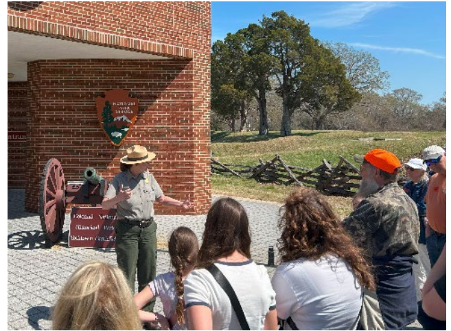
Park ranger presenting a program.

Prefer to explore at your own pace? Try our self-guided walking and driving tours . And don't forget to ask about our popular Junior Ranger Program —perfect for young adventurers!