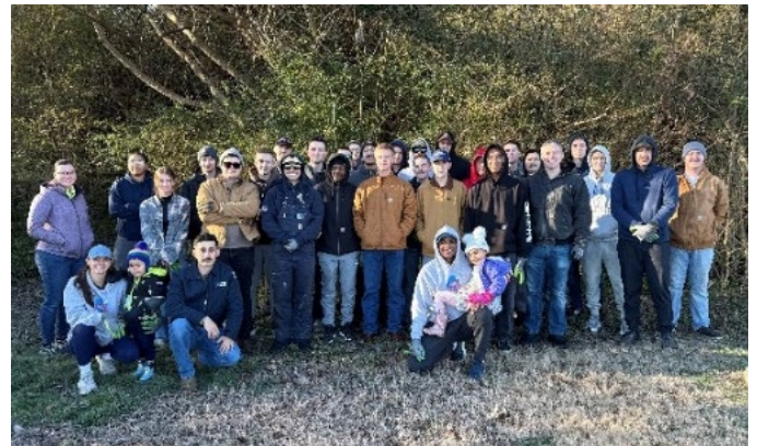
Volunteers on Martin Luther King Jr. National Day of Service.

Thirteen volunteers from Scout Troop 318 worked with park staff to remove flagging tape from wooded areas near the former Slabtown community. Their efforts contributed to site maintenance and helped participating scouts earn their Trail Maintenance badges.