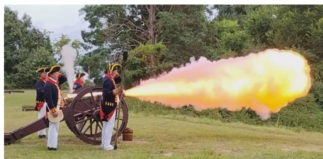
NPS volunteers firing a cannon.

Feel the boom of History! Volunteer members of the Royal Artillery and Lambs Artillery are conducting live artillery firings at the Yorktown Battlefield Visitor Center on select weekends. Witness the power, precision, and pageantry of Revolutionary War-era cannon firings—an unforgettable experience for visitors of all ages. Find the full schedule on our website and follow us on social media for updates.