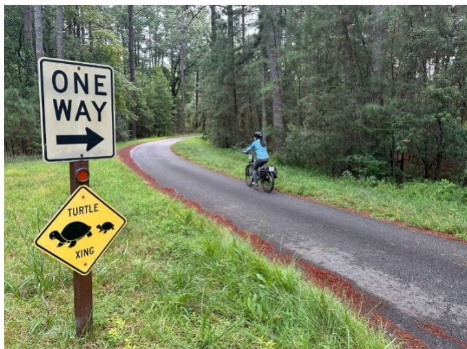
Bicyclist on the Jamestown Island Loop Drive.

Turtle activity increases significantly in spring and fall, and early observations suggest that reducing motor-vehicle access may help reduce turtle mortality. During this test period, park staff will be monitoring the area to learn more about how turtles use the habitat around the loop.