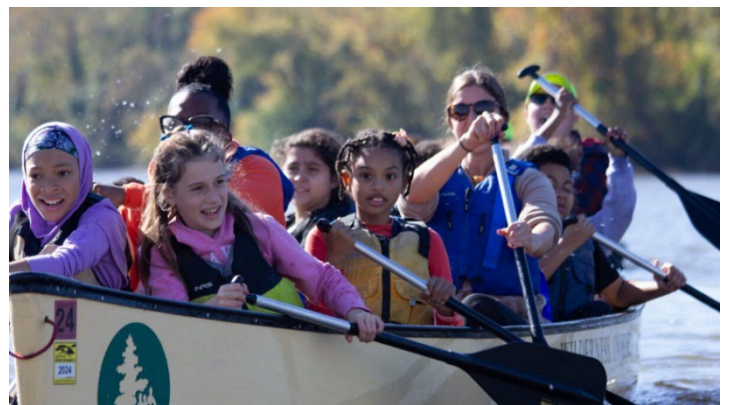
York County, PA fifth graders enjoy the day on the Susquehanna during Canoemobile activities.

Originally funded through the Every Kid Outdoors initiative, NPS continues to support Canoemobile as a key educational program. It remains a powerful way to connect young people with their local waterways, build confidence in the outdoors, and inspire future stewardship of the trail and the Susquehanna River.