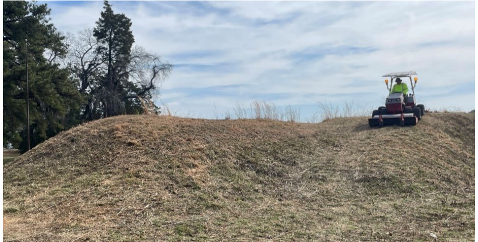
Park staff mowing the earthworks near the Yorktown Visitor Center.

Yorktown’s earthworks—original, modified, and reconstructed—represent key moments in the site’s history, from the 1781 siege to Civil War activity and the reconstruction work of the 1930s. These features face ongoing challenges from natural erosion, vegetation growth, and visitor use, making regular maintenance and public cooperation critical to their preservation.