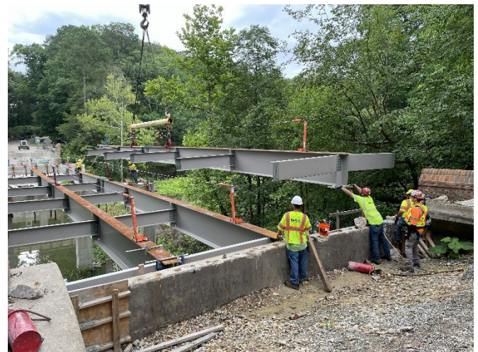
Crews installing steel girders for the Yorktown Creek bridge.

We appreciate the public’s patience and support as these once-in-a-generation improvements move toward completion. Updates—including detour and closure maps—will be posted on the project webpage at nps.gov/colo/planyourvisit/colo-parkway-rehab and shared via our email list at COLO_Parkway_Rehab@nps.gov .