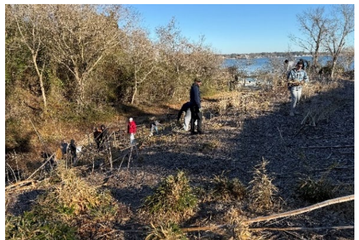
Volunteers removing invasive bamboo near Cornwallis Cave in Yorktown.