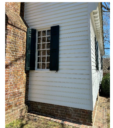
Moore House during repair (top) and after (bottom).