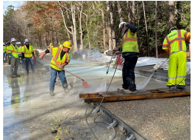
Workers stand on a makeshift bridge and use pressure washers to expose the aggregate in newly poured slabs, creating the historic exposed- aggregate finish.