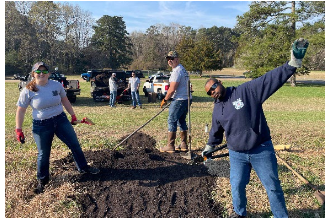
Volunteers building pathways at the Grand French Battery.

Thirty-one volunteers from the U.S. Coast Guard Training Center Yorktown and five volunteers from the College of William & Mary helped park staff support erosion control efforts to help protect the park’s historic earthworks. Volunteers built paths, cleared brambles and saplings, and raked away debris at the Grand French Battery at Yorktown. This work also ensured the site’s readiness for upcoming semiquincentennial visitation.