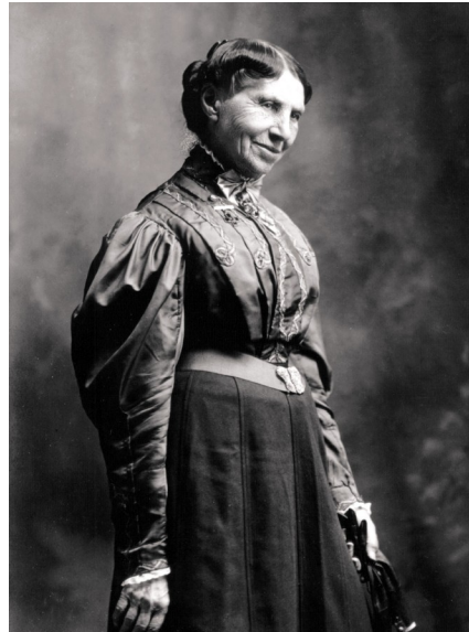
Clara Barton, Red Cross-Era, 1906