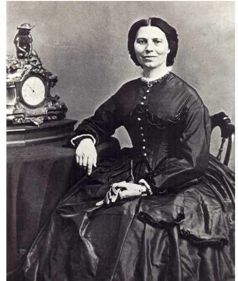
Clara Barton, Civil War-Era, 1865

Clara Barton (1821-1912), a former school teacher and Patent Office clerk, was a relief worker during the Civil War (1861-1865). She collected and organized supplies, as well as treated wounded soldiers on the battlefields. Miss Barton provided aid to the sick and injured on both sides. She also established an office to locate missing soldiers of war. After learning of the International Red Cross, based in Switzerland, which aided victims of war, Clara Barton founded the American Red Cross in 1881. Her organization also provided assistance during natural disasters and peacetime. Clara Barton was a woman who, through determination and perseverance, was able to accomplish what few women of her time were able to do.