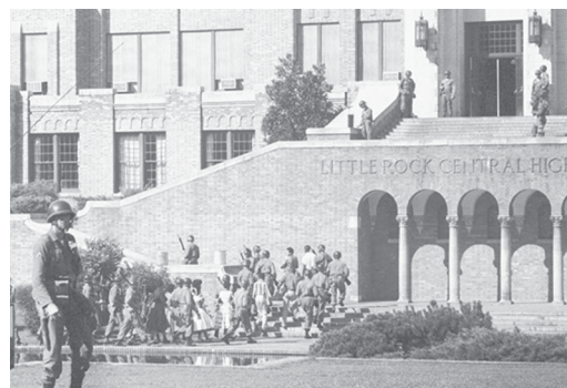
The Little Rock Nine are escorted into Central High School by 101 st Airborne troops, Sept. 25, 1957.

On September 25, 1957, under federal troop escort, the Little Rock Nine made it inside for their first full day of school. The 101 st Airborne left in October and the federalized Arkansas National Guard troops remained throughout the year.