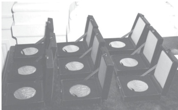
Congressional Gold Medals of the Little Rock Nine.