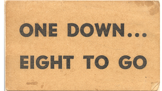
Segregationist card distributed by Central High students after Minnijean Brown's expulsion in 1958.

Ernest Green, Life Magazine , June, 1958