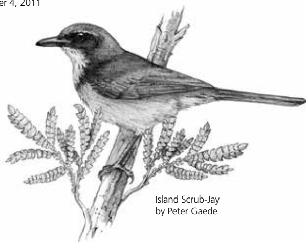
Island Scrub-Jay