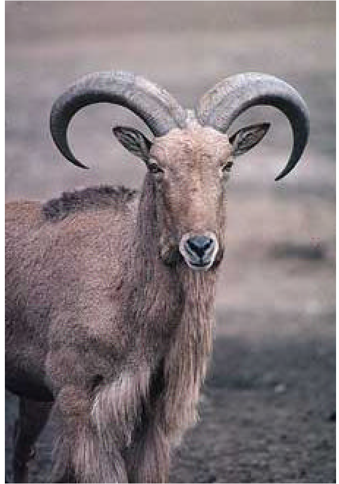
A Barbary Sheep, Ammotragus lervia.

Mexico Department of Game and Fish (NMDGF) saw fit to introduce Barbaries into several areas in the state—thinking this drought-resistant exotic might be a desirable substitute for New Mexico's beleaguered native sheep—in areas native bighorn sheep did not inhabit or were extirpated. 5 Closer to home, the Guadalupe Mountain population was established via the southward dispersal of annual escapees (1943–1979 and beyond?) from the aforementioned McKnight ranch located in the Hondo Valley. 3 The year 1959 marks the first recorded sighting of Barbary sheep in Carlsbad Caverns National Park.