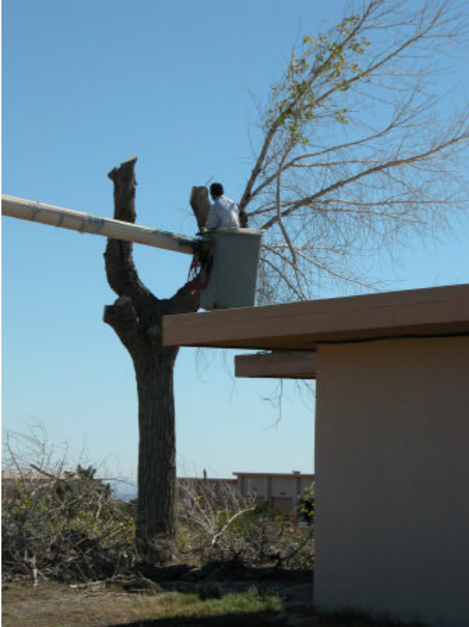
A contractor removes the last cottonwood from the housing area.

top of the juniper and cactus-lined ridge they had been planted on. In conjunction with the Carlsbad Cavern Resource Protection Plan and in anticipation of removing the Mission 66 apartments, a decision was made to remove the cottonwoods and a few other non-native trees. The removal process was phased in over a few years to keep bird disruptions, particularly woodpeckers, to a minimum. In October 2003, the last of the cottonwoods were removed from the housing area.