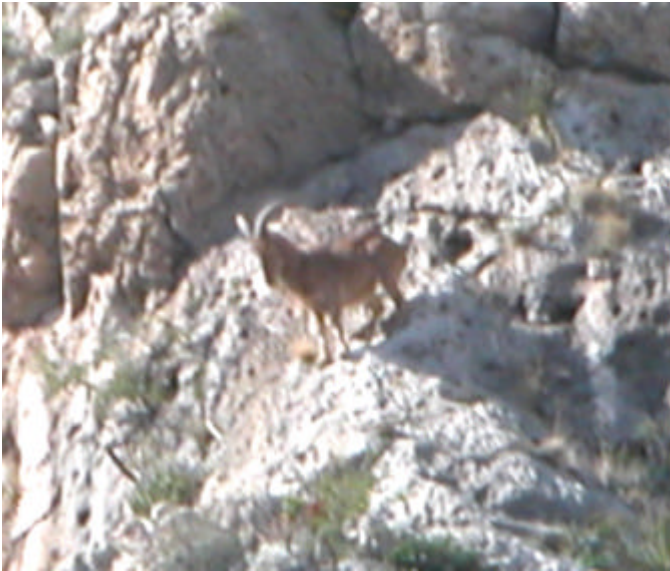
Though out of focus, this photo shows a Barbary ram as he descends a steep canyon wall in the Slaughter Canyon area.