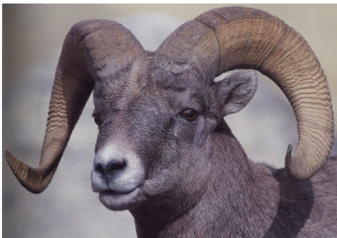
A Bighorn sheep ( Ovis canadensis ).

The presence of Barbary sheep has been deemed a threat to the ecological communities and native wildlife species occurring in the park. Scientists have concluded Barbary sheep are an ecologically aggressive species based upon their rapid dispersal rate and successful colonization of virtually any rough terrain. More specifically, they are reproductively prolific, thrive on low-quality forage, and exhibit significant dietary overlap with native ungulates (i.e., mule deer and desert bighorn). 7 While Barbaries are known to live sympatrically (i.e., occurring together) with several native North American ungulates, including the mule deer, the scientific community believes Barbary sheep would outcompete the native bighorn sheep. The Barbary sheep's nearest ecological counterpart in North America is the desert bighorn. In addition to having greater fecundity (ability to produce offspring) and forage overlap, Barbaries could further threaten the survival of desert bighorn through parasite and disease transmission. 6 For these reasons it is necessary to eliminate Barbaries from historic desert bighorn habitat before reintroduction efforts are initiated.