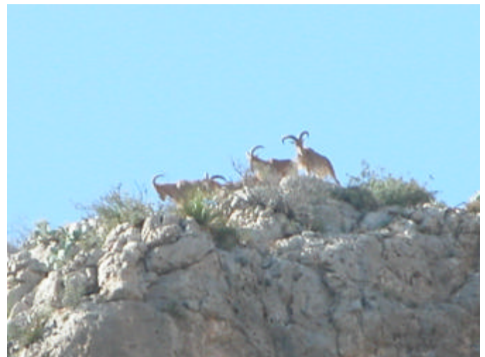
Part of the Slaughter Canyon herd as they begin their descent into a canyon.

By the 1990s, the result of the past decades of desultory management efforts was manifest. A park Environmental Assessment (circa 1993) revealed: "Barbary have become firmly established in the park's rugged canyons, it is extremely costly and difficult to remove them." Evidently, NMDGF's effort at reducing the Barbary population in the Guadalupe Mountains in the 1980s was not successful and opportunistic shooting by park personnel was ineffective. The last park animals removed by direct reduction occurred in January 1993, with five Barbary sheep shot. The realization that previous management efforts did not produce the desired result of eradicating Barbaries from the park sparked a change in course; the superintendent wrote to a reporter from the local newspaper, Carlsbad Current-Argus , in fall of 1995: "Currently we are not shooting Barbary sheep. We may in the future, but we would re-evaluate the problem before doing so." 1