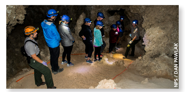
Lower Cave Tour

Distance:0.5 mile (0.8 km)Elevation Change:79 ft (24.1 m)Difficulty:StrenuousTour Time:3 hoursAge Limit:12 years