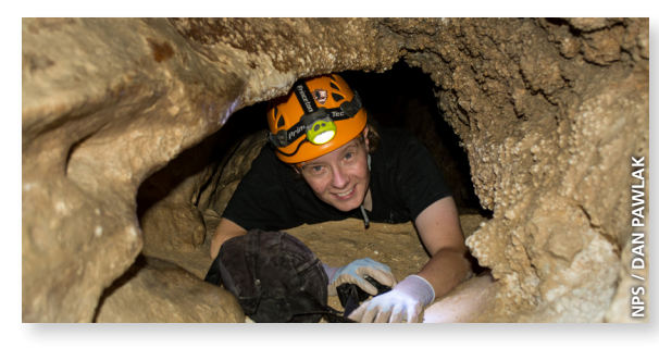
Hall of the White Giant Tour

Distance: 1.7 miles (2.7 km) Elevation Change: 944 feet (287.7 m)