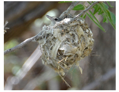
Bell's Vireo

conservation concern (e.g. threatened and endangered species), range-restricted species (species vulnerable because they are not widely distributed), species that are vulnerable because their populations are concentrated in one general habitat type, or species or groups of similar species (such as waterfowl or shorebirds) that are vulnerable because they occur at high densities due to their congregatory behavior.