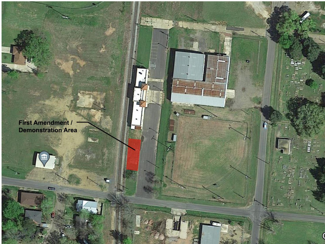
Detail of designated Demonstration Area / First Amendment Area (in red) at Texas & Pacific Railway Depot, located in grassy area south of the building.