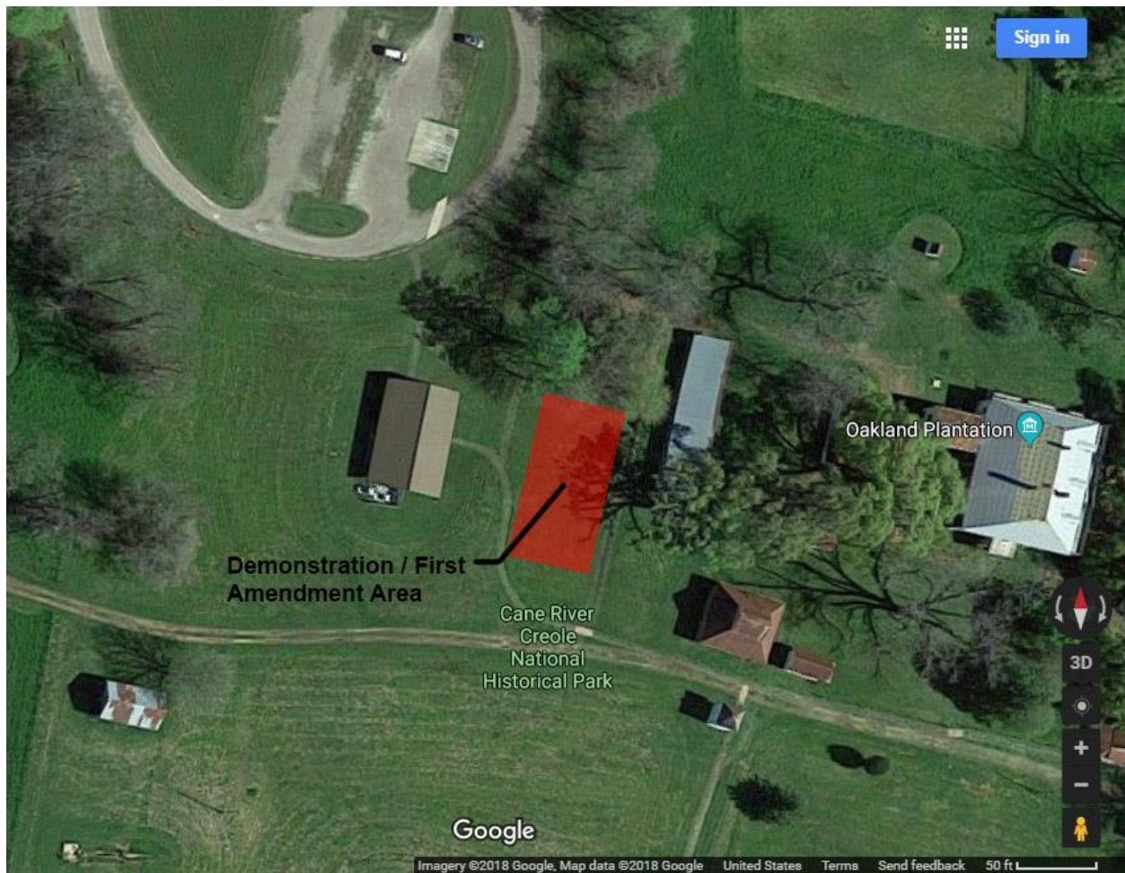
Detail of designated Demonstration Area / First Amendment Area (in red) at Oakland, located in grassy area between Entrance Pavilion and Tractor shed.