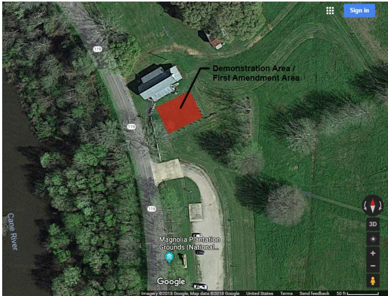
Detail of designated Demonstration Area / First Amendment Area (in red) at Magnolia Plantation, located in grassy area between parking lot and Plantation Store.