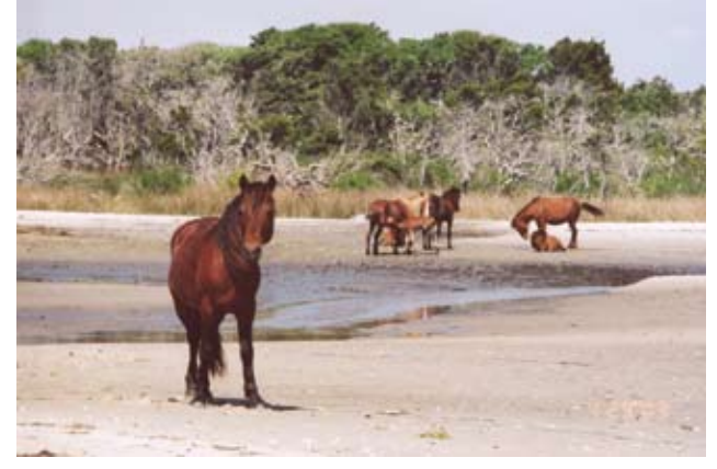
Checking a potential threat: Stallions will often come out of their harems to see if the creature they see approaching is a rival stallion.

Remember that these aggressive behaviors can be directed toward other animals, like dogs, and toward people. Keep your dog on a leash and stay away from the horses for safety.