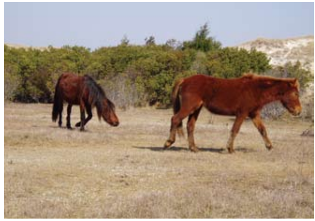
Herding: Stallions keep their mares in the harem and away from other stallions by herding them.