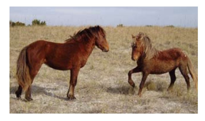
Striking: This stallion is striking the ground during a conflict. His opponent seems unimpressed – and later won by chasing off the aggressor. Stallions also strike at each other and can inflict dangerous blows.