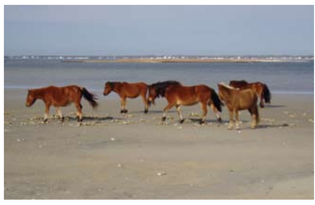
Following: Harems most often follow their alpha (most dominant) mare. The stallion most often brings up the rear unless he is checking ahead for a potential rival