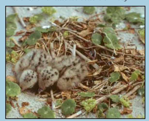
You may never notice the bird nest nearby

Most bird species are protected, and many are listed as threatened or endangered. For example, about two-thirds of all the piping plovers (an endangered species) in North Carolina nested at the seashore in 2005.