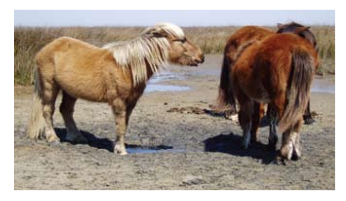
Pinned Ear Threat: Horses threaten each other by pinning their ears back (normally even closer to their neck than this) and tightening their lips. This young bachelor is trying to chase his neighbor from the water without success.