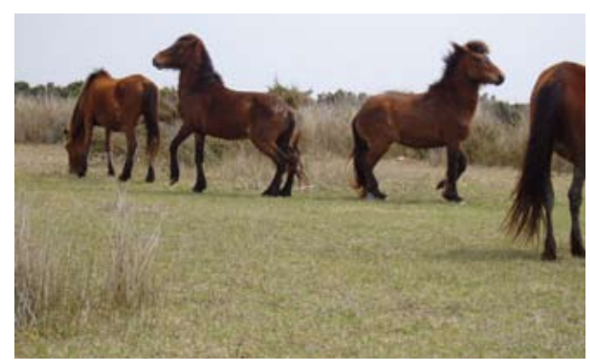
Kick Threats: Feuding horses threaten each other by backing towards each other and threatening to kick with the hind legs. Mares do this more than stallions, but this photo shows two stallions. The stallions are defending their mares (seen on right and left sides of the photo).