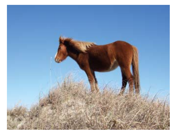
Observing: Horses will stand on dunes to look for other horses. They also stand on high spots to take advantage of the breeze that keeps insects away.

Wild horses display a myriad of fascinating behaviors for anyone who has the time to sit at a distance with binoculars and watch. Here are some behaviors you might see.