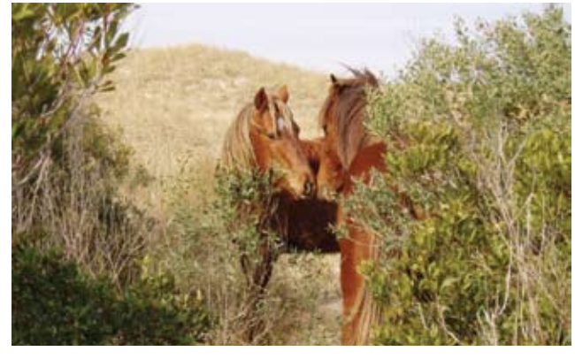
Nose-to-Nose: Stallions size each other up by sniffing noses