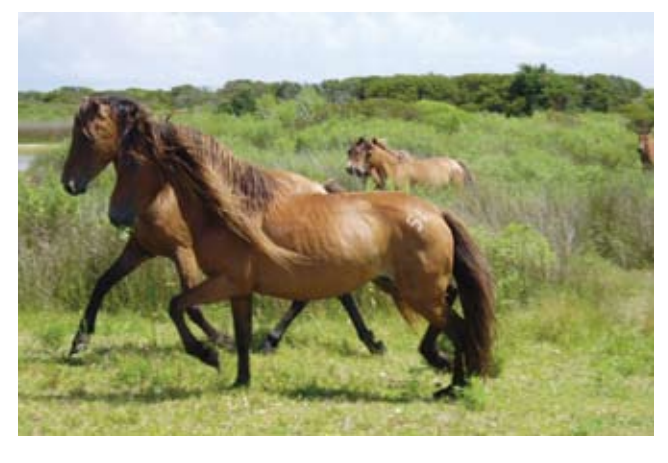
Parallel Prance: Stallions try to show their opponent how formidable they are by trotting side by side with their necks arched and manes flying.