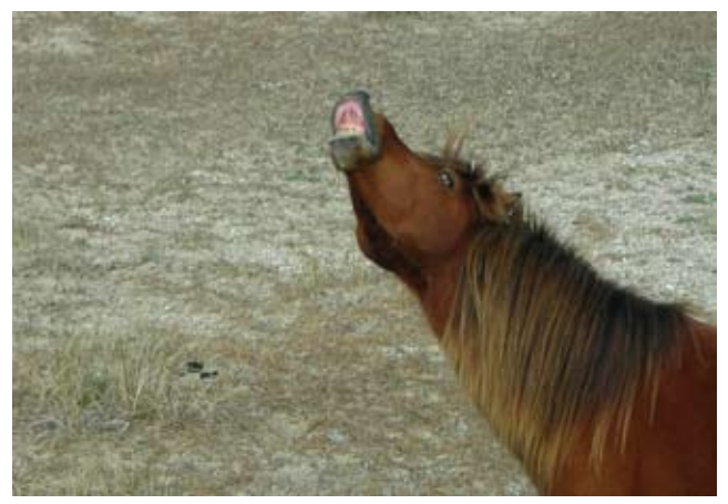
Flehman: Stallions (mostly) use their vomeronasal organ (sensory apparatus in the nose) to detect pheromones (chemicals used for communication) by closing their nasal passages with their upper lip and raising their noses in the air.