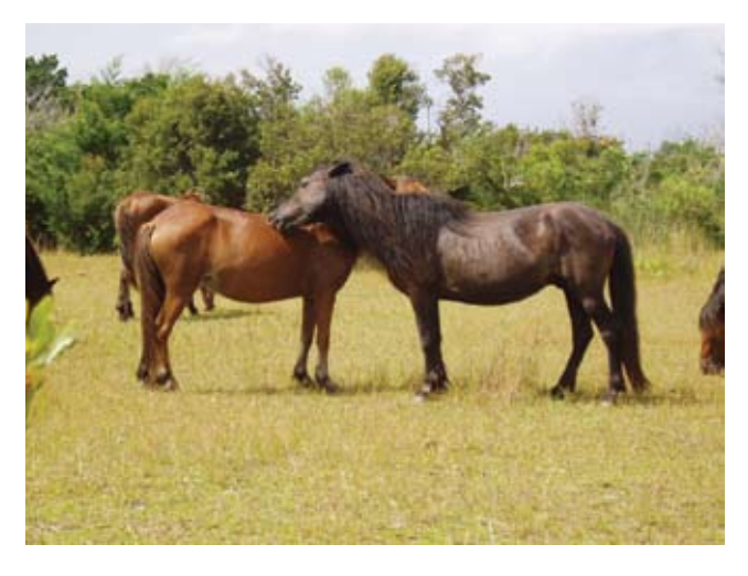
Mutual Grooming: A stallion and his mare scratch each other on the backs and necks. This behavior is also seen between mares who know each other well and between mares and their older offspring. The stallion's ears – part way back – show his concentration.