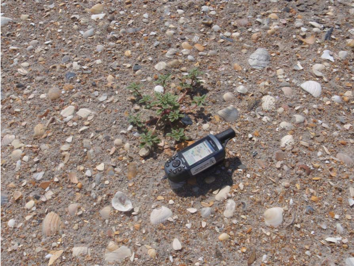
Recording coordinates for a Sea Beach Amaranth Plant at Power Squadron Spit.