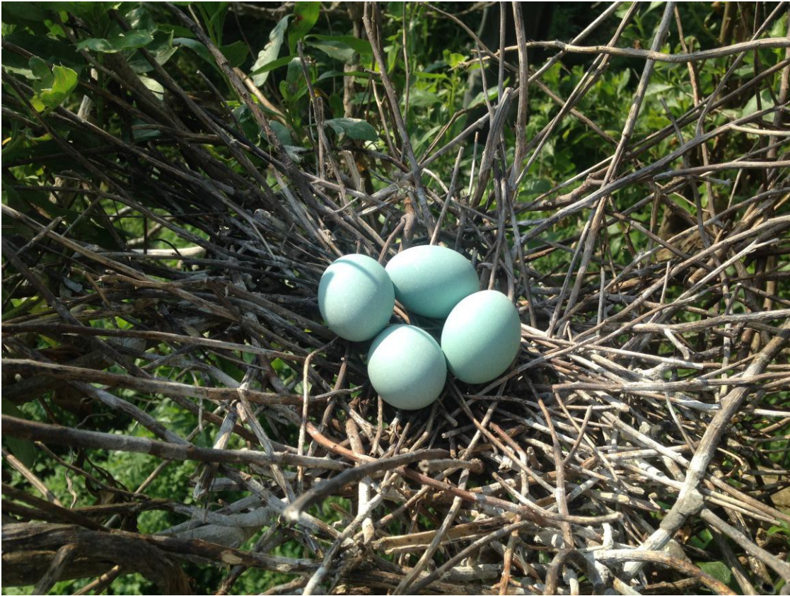
A Great Egret ( Ardea alba ) Nest on Morgan Island.