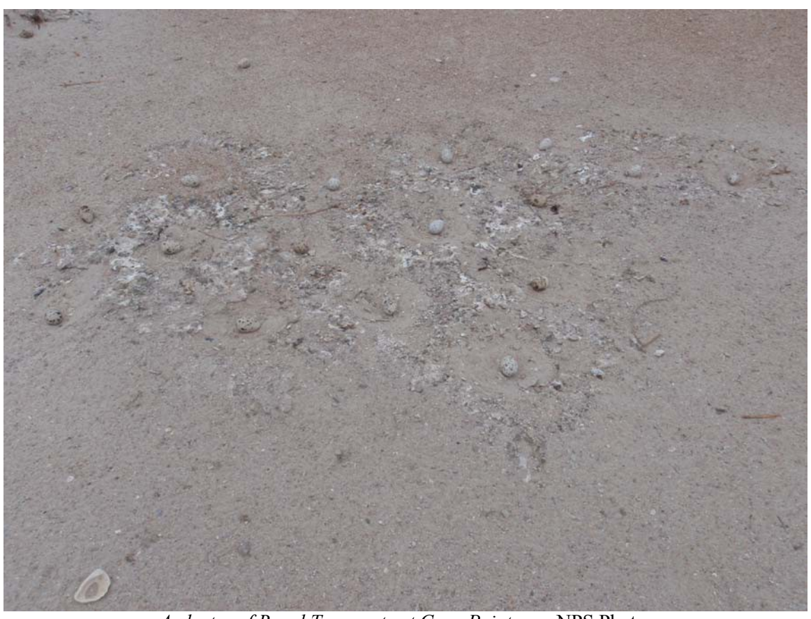
A cluster of Royal Tern nests at Cape Point.

National Park Service Cape Lookout National Seashore 131 Charles Street Harkers Island, NC 28531