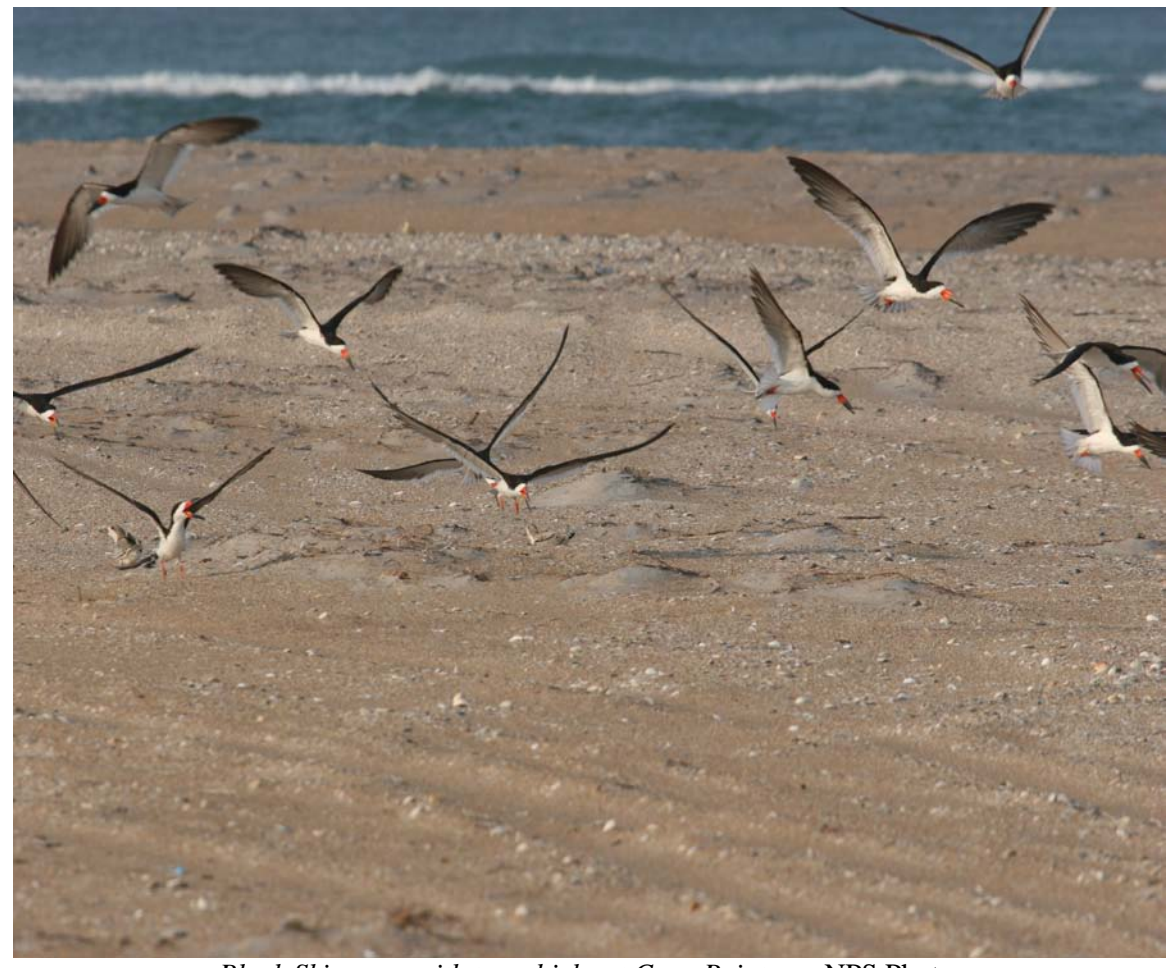
Black Skimmers with two chicks at Cape Point.

Prepared by: Jon Altman Biologist Cape Lookout National Seashore National Park Service