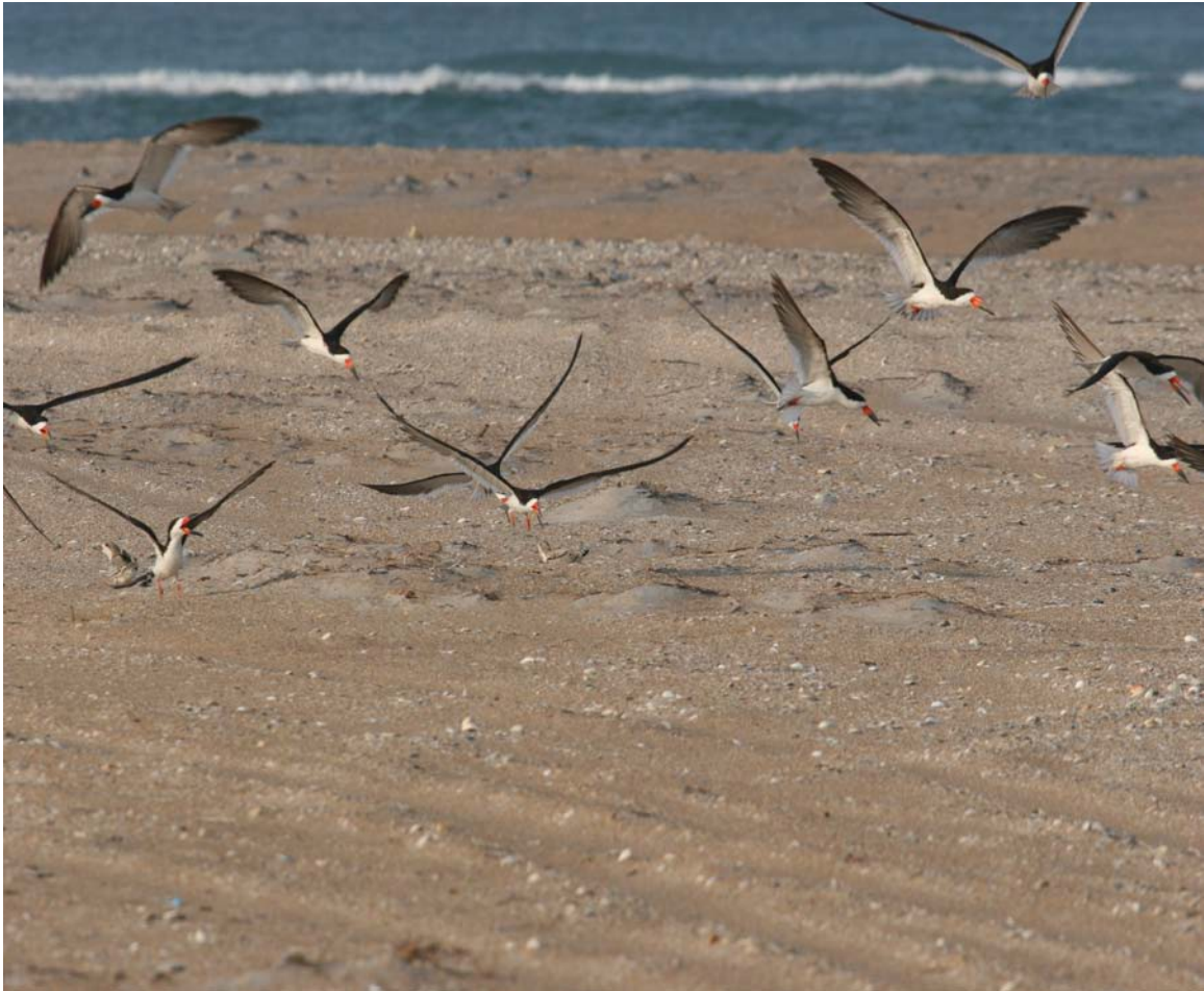
Black Skimmers with two chicks at Cape Point.

Prepared by: Jon Altman Biologist Cape Lookout National Seashore National Park Service