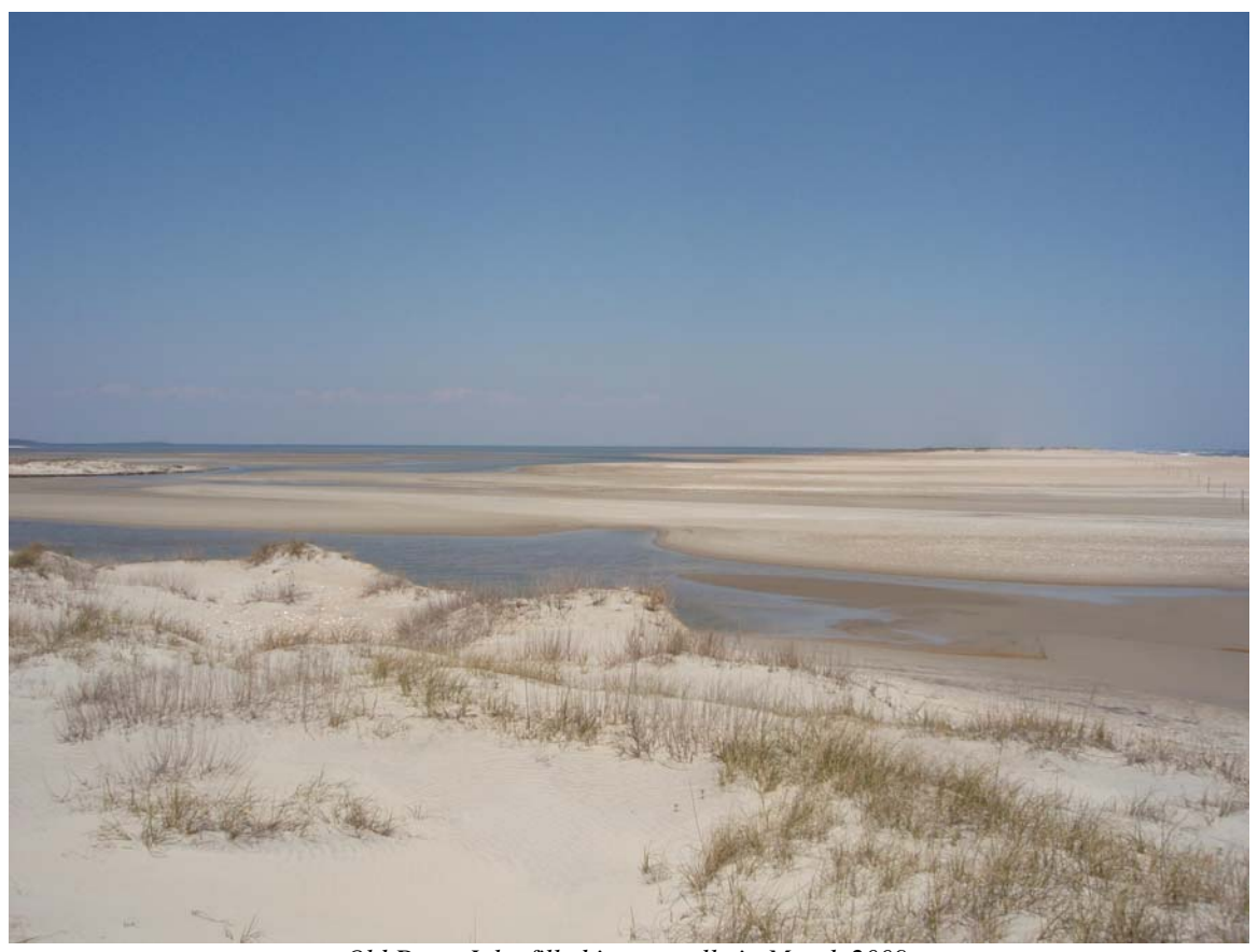
Old Drum Inlet filled in naturally in March 2009.