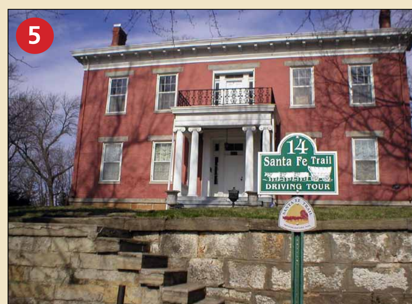
5 Aull House In the 1820s and 1830s, caravans were outfitted in Lexington. The town was the headquarters for the Aull Brothers (traders) and Russell, Majors, & Waddell (freighters). The river route of the Santa Fe Trail passed in front of the Aull house, built around 1850.