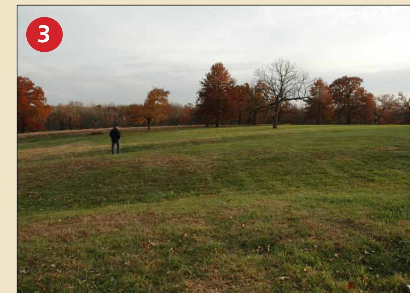
3 Minor Park and New Santa Fe Swale The 27-acre Minor Park preserves dramatic swales left behind as wagons crossed the Blue River. The New Santa Fe cemetery also has a trail swale.