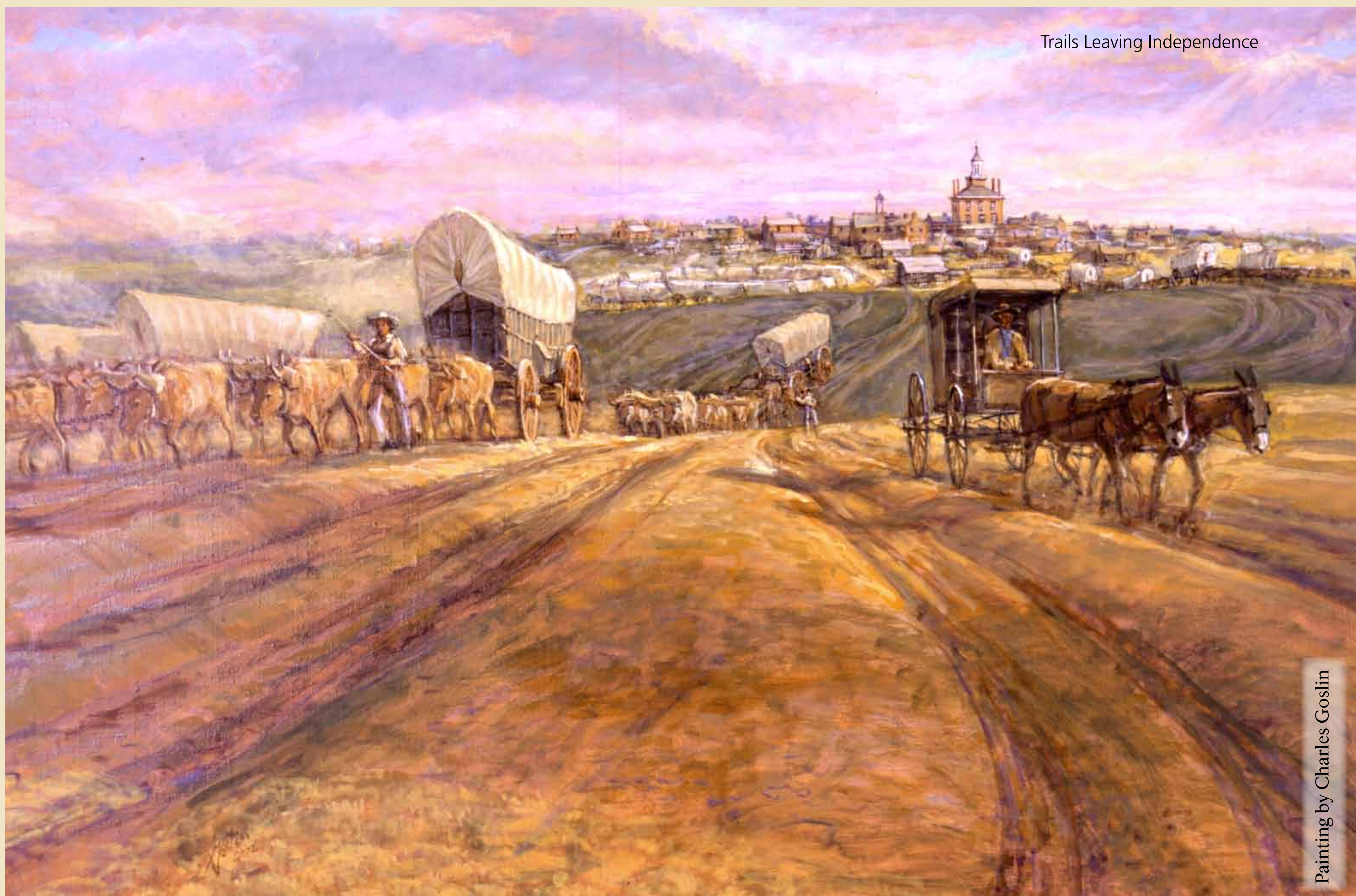
Trails Leaving Independence

Today these routes are part of the Santa Fe, Oregon, and California national historic trails.