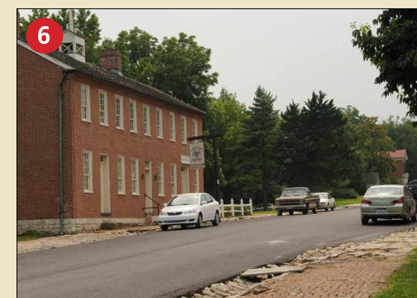
6 Arrow Rock The Arrow Rock bluff appeared on maps in 1732. The Osage Trace, which became the Santa Fe Trail, crossed the Missouri River here. Arrow Rock was a landmark for explorers, traders, and travelers.