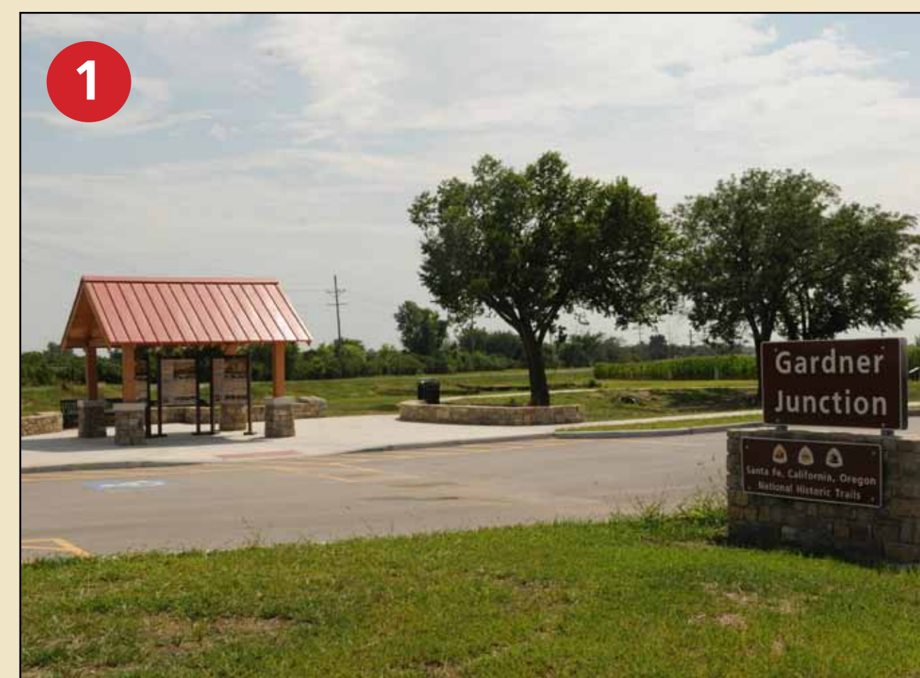
1 Gardner Junction Park Dedicated in 2008, the park is located near the junction where the Oregon and California trails split from the Santa Fe Trail. This one-acre park features prairie flora that traders and emigrants would have encountered in the 1800s.