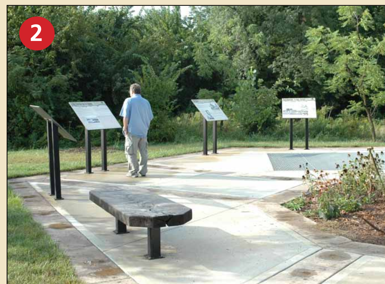
2 Lone Elm A famous frontier trail campsite and rendezvous point, Lone Elm was used for almost four decades by thousands of Santa Fe traders and emigrants on the Oregon and California trails.