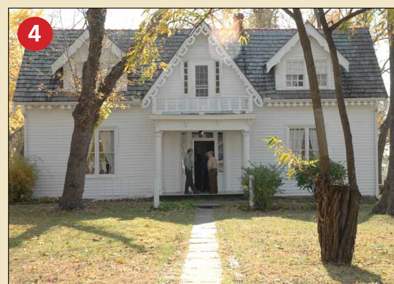
4 Rice-Tremonti House Built in 1844, and located eight miles from Independence, the Rice Farm quickly became a popular camping site for travelers on the Santa Fe and the Oregon-California trails. There was space for wagons, springs for watering, and corn and prairie grasses for feeding animals.