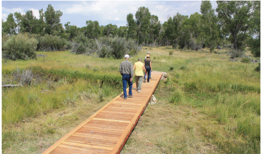
New Fork River Crossing Historical Park staff installed a new footbridge over a muddy swale last summer. The park's dedication ceremony occurs on June 21, 2014.

GIS staff and the University of Utah will continue providing support on translating mapped marker information from the OCTA Crossroads Chapter.