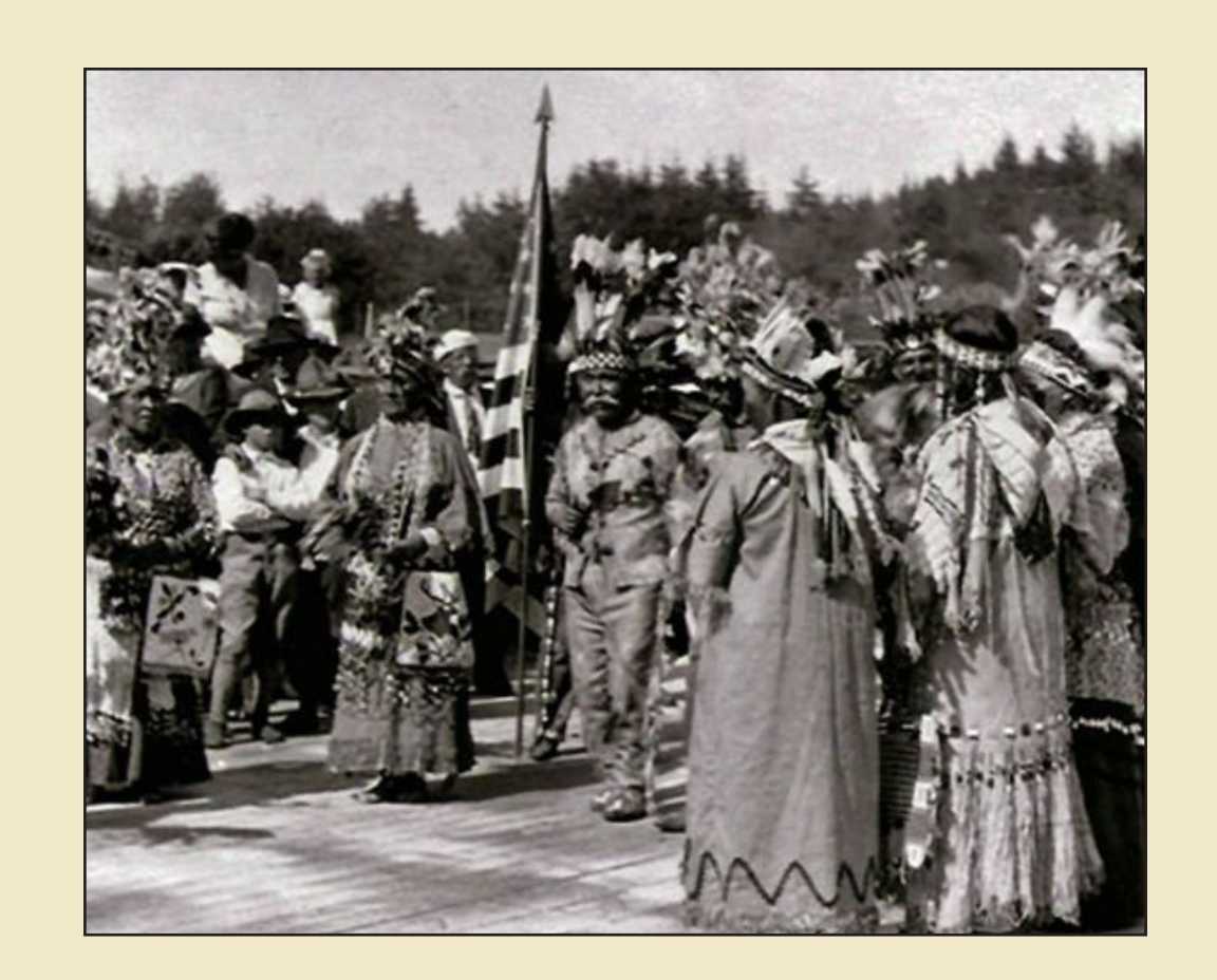
Siletz Feather Dance Confederated Tribes of Siletz Indians (a confederation of tribes from northern California to southern Washington)

Traditional systems of trade, marriage practices, and long-standing means of dispute resolution promoted healthy tribal society—one that allowed political groups to reside next to each other in relative peace.