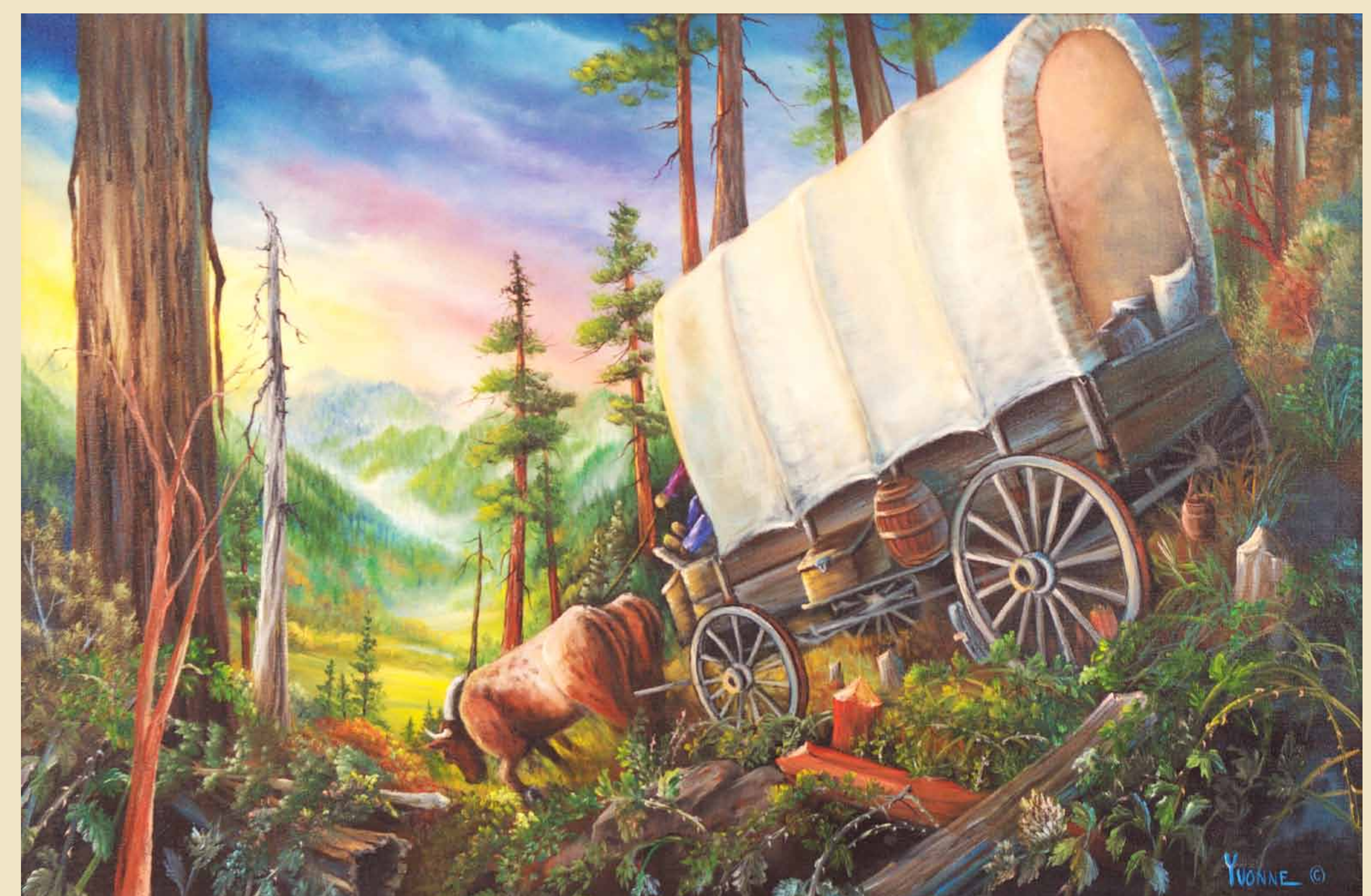
Wagon coming down Sexton Mountain