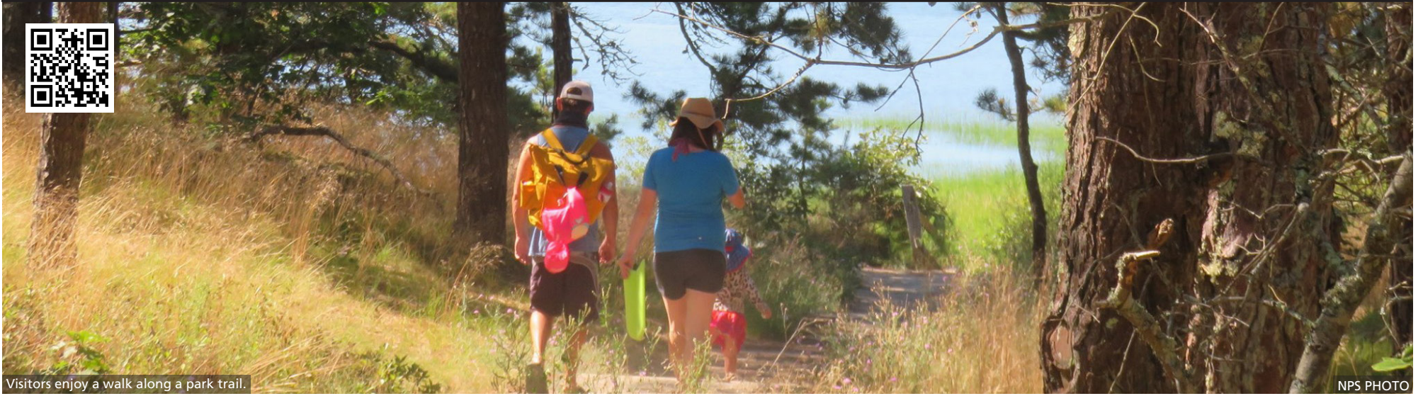
Visitors enjoy a walk along a park trail.