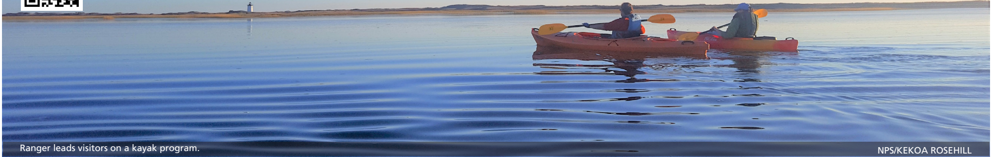
Ranger leads visitors on a kayak program.