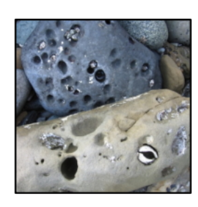
Holes in rocks made by Boring Clams

*Photos are not to scale. Thank you to the Cabrillo VIPs for most of these photos.