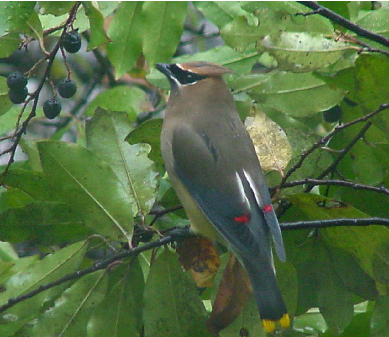
Cover Photo: Bombycilla cedrorum (Cedar Waxwing)