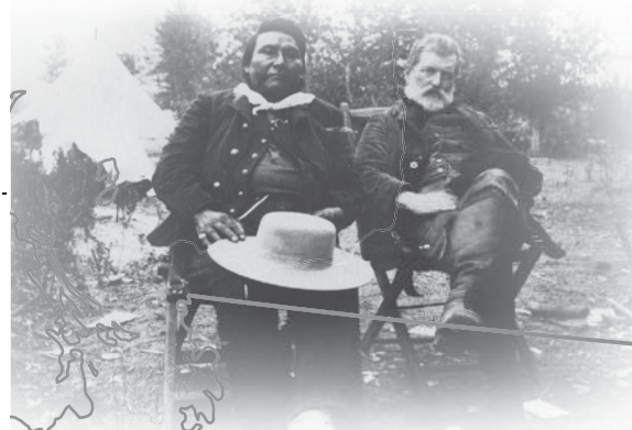
hinmató-wyalahtqít (Young Joseph) and General Gibbon, 1889