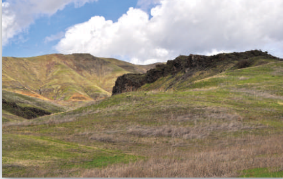
White Bird Battlefield

In addition to Big Hole National Battlefield, Nez Perce National Historical Park includes sites in four states related to nímí-pu- history and the events of 1877. Visit White Bird Battlefield (above), where the battles began, and Bear Paw Battlefield (far right), where they ended. Learn more at the visitor center in Spalding, ID, or on the park website. The Nez Perce (Nee-Me-Poo) National Historic Trail also commemorates the flight.