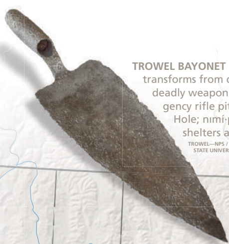
TROWEL BAYONET This sharp trowel transforms from digging tool to deadly weapon. Soldiers dug emergency rifle pits with them at Big Hole; nímí-pu- dug emergency shelters at Bear Paw.