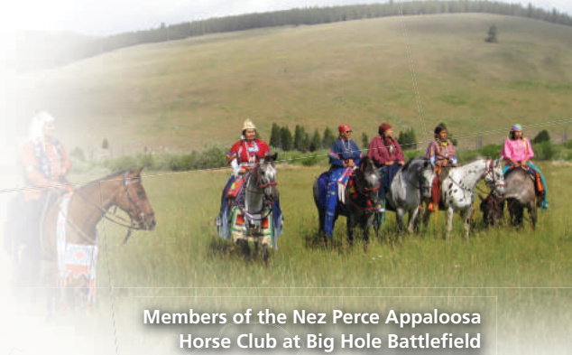
Members of the Nez Perce Appaloosa Horse Club at Big Hole Battlefield