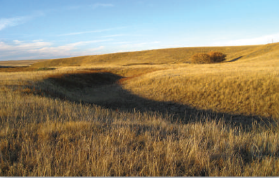
Bear Paw Battlefield

The battle at Canyon Creek (above) took place 10 miles north of present-day Laurel, MT. Most of the battlefield site is on private property, but Nez Perce National Historical Park maintains an outdoor exhibit at the junction of MT 532 and 401 and provides information about the battle on its website.