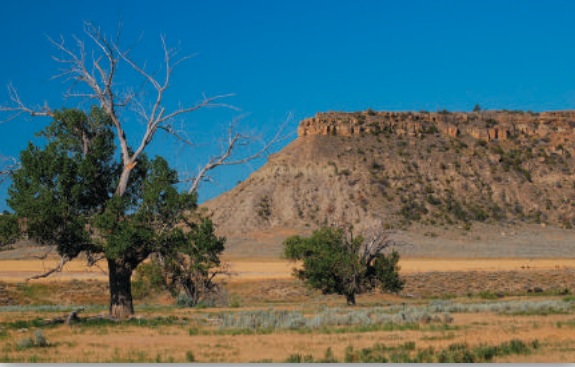
Canyon Creek Battlefield

In addition to Big Hole National Battlefield, Nez Perce National Historical Park includes sites in four states related to nímí-pu- history and the events of 1877. Visit White Bird Battlefield (above), where the battles began, and Bear Paw Battlefield (far right), where they ended. Learn more at the visitor center in Spalding, ID, or on the park website. The Nez Perce (Nee-Me-Poo) National Historic Trail also commemorates the flight.