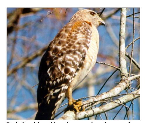
Red-shouldered hawk surveying the area for its next meal.

Look east to see a sawgrass prairie, with a cypress strand visible beyond. The sawgrass is a dominant prairie species, but ironically it is not grass, it is sedge. Prairies are flooded for less time out of the year, on average, than the slightly lower regions which have cypress trees. Every inch of elevation change counts in the Preserve. These open regions are often good spots to search for raptors, birds of prey that tend to perch in prominent locations such as atop standing dead trees. Drive another mile for a second sawgrass prairie.