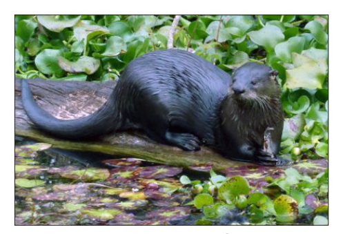
The elusive river otter is one of many creatures that call Big Cypress National Preserve home

This section of Loop Road has many small culverts. Depending on the time of year, these may dry up as water levels drop during the winter. Not only to protect the road from washing out, these culverts allow a more natural flow of water southwards. The Preserve's