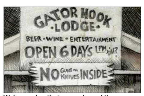
Welcome sign that once adorned the entrance to Gator Hook Lodge

The town of Pinecrest once had a population of nearly 400 at its peak in the 1930s, the town started as the center of operations during road construction in the 1920s. Please respect private property.