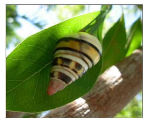
Liguus tree snails are a special sight throughout this area.

The Loop Road Eduacation Center is operated by Everglades National Park for educational groups with reservations. Across the street on the north side, the Tree Snail Hammock Trail is maintained by Big Cypress National