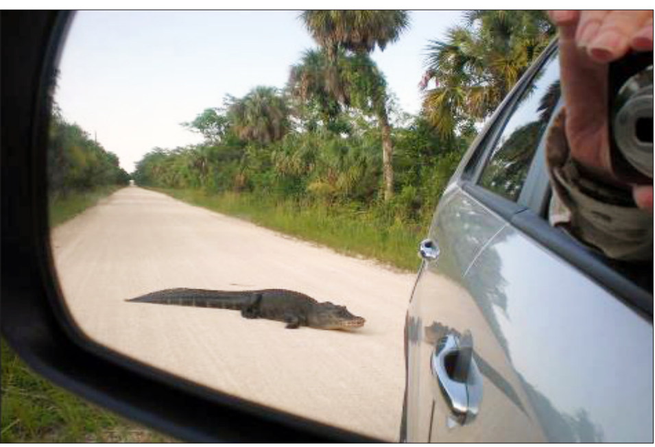
Remember, the Preserve is their home and you are the guest. Respect wildlife and observe from a safe distance.