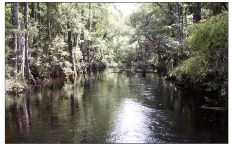
Sweetwater Strand is a popular spot along Loop Road.

The large trees provide a wind-break and shelter to many other organisms. Feel how the air is cooler, and moist? There is usually wildlife as well– both alligators and birds know this is a good source of fish, and the branches above