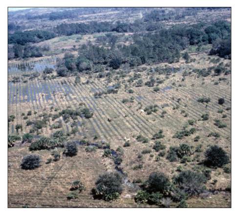
Nearby abandoned plowlines.

Into the mid-1900s, the Big Cypress Swamp and the Everglades were considered swampy wastelands by many. Efforts were made to "tame" the region – including the construction of roads, such as this one, canals to drain the swamp, and levees to control flooding. An aerial view of today's Preserve still shows evidence of farming attempts– some prairies have the tell-